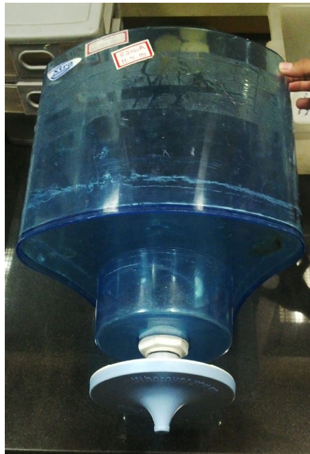
Drink Pure Cartridge Picture.

INFERENCE : Tested Factory made cartridge is capable reducing E.Coli bacteria to > 99.9999 ( 6 logs) and MS2 phage Virus to about 99 % ( 2 logs ). E.Coli reduction is meeting USEPA requirement i.e. 6 logs, but the virus reduction is lower than the requirement i.e. 4 logs.