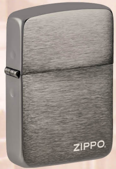
41 24485 1941 Replica Black Ice® Laser Engrave $42.95