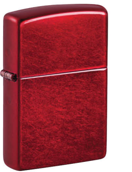
21063 Candy Apple Red $24.95