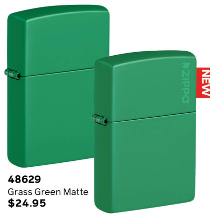
48629 Grass Green Matte $24.95