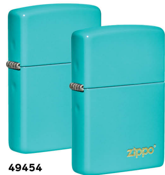
49454 Flat Turquoise $24.95