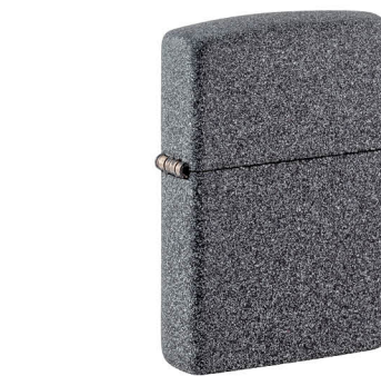
211 Iron Stone $22.95