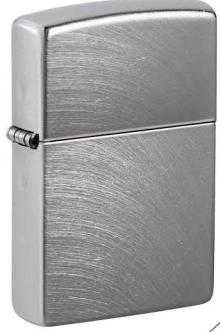
24647 Chrome Arch $22.95