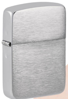
41 1941 1941 Replica Brushed Chrome $29.95