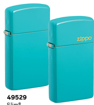
49529 Slim® Flat Turquoise $24.95