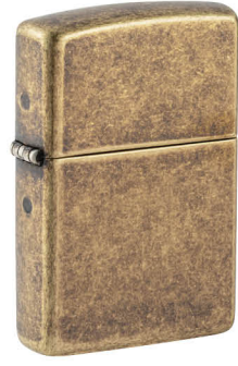
201FB Antique Brass $29.95