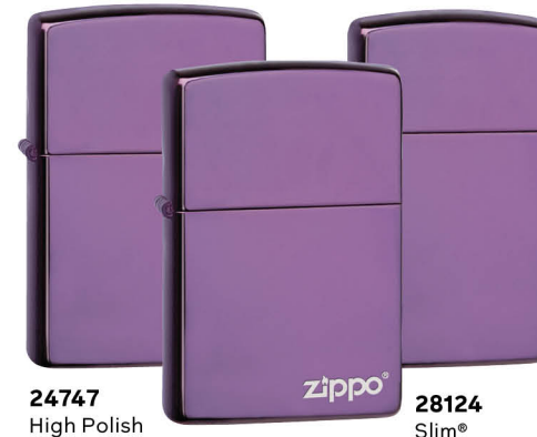
24747 High Polish Purple $29.95