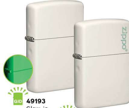
49193 Glow-in-the-Dark Green $27.95