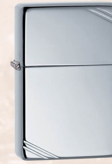
260 Vintage High Polish Chrome $27.95