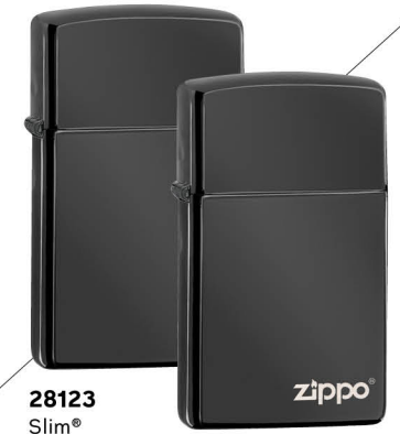
28123 Slim® High Polish Black $29.95