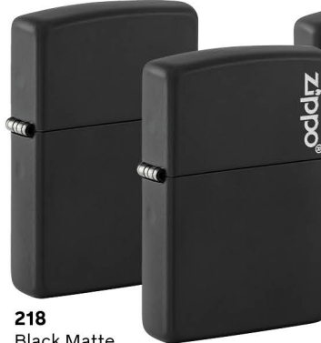
218 Black Matte $22.95