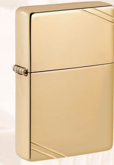
270 Vintage High Polish Brass $29.95