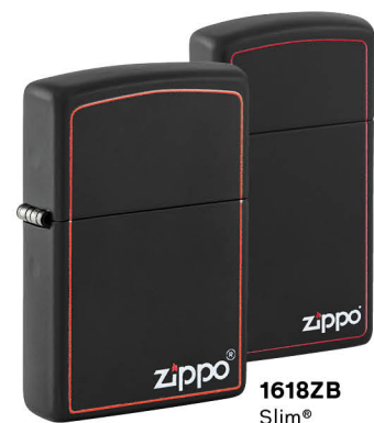
218ZB Black Matte Color Image $27.95