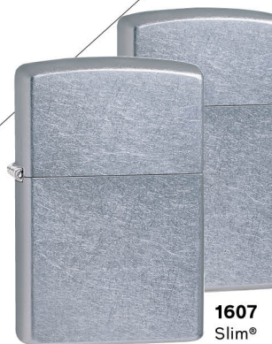
207 Street Chrome $17.95