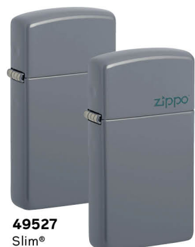
49527 Slim® Flat Grey $24.95