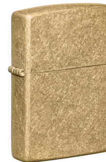
28496 Armor® Tumbled Brass $29.95

An exclusive bottom stamp authenticates these chrome and solid brass lighters as heavy-walled Armor®, about 1.5 times as thick as a standard Zippo case.