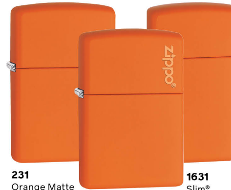
231 Orange Matte $22.95