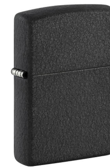
236 Black Crackle® $22.95