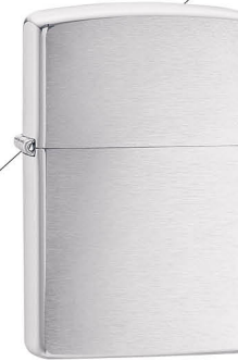
162 Armor® Brushed Chrome $24.95