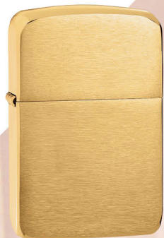
41 1941B 1941 Replica Brushed Brass $36.95