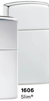
1606 Slim® Armor® High Polish Chrome $32.95