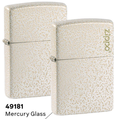
49181 Mercury Glass $22.95