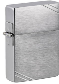
35 1935 1935 Replica Brushed Chrome $39.95