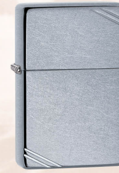
267 Vintage Street Chrome $22.95