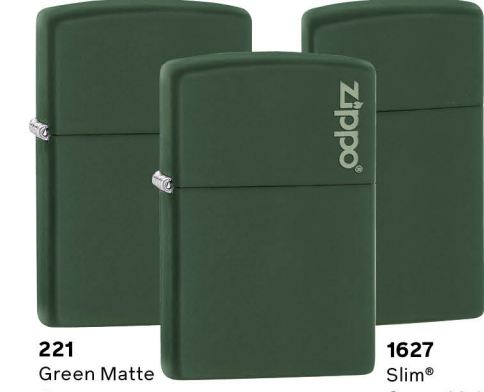
221 Green Matte $22.95