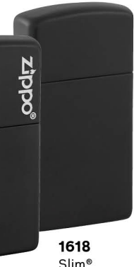
1618 Slim® Black Matte $22.95