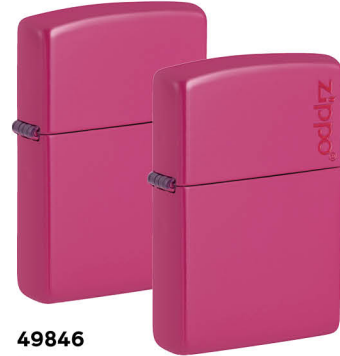
49846 Frequency $24.95