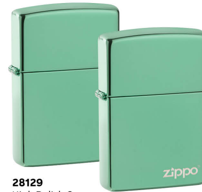
28129 High Polish Green $29.95