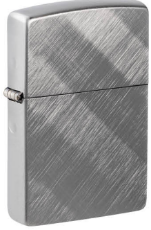
28182 Diagonal Weave $22.95