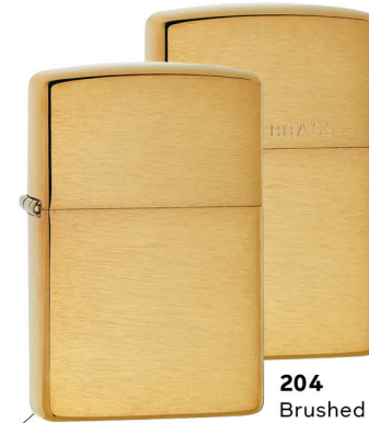
204B Brushed Brass $24.95