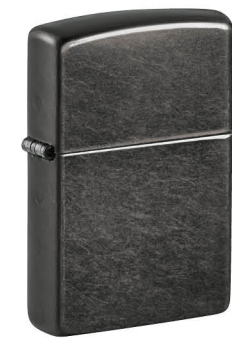
28378 Gray $24.95