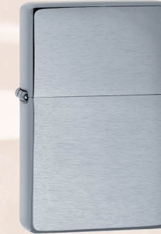
230.25 Vintage Brushed Chrome $22.95