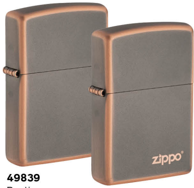
49839 Rustic Bronze $39.95