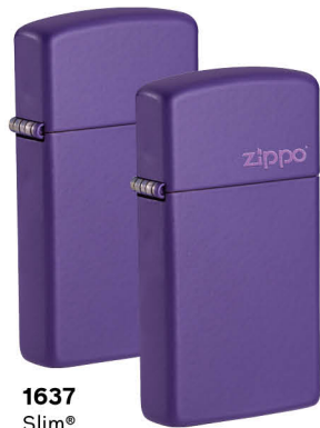
1637 Slim® Purple Matte $22.95