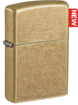
48267 Street Brass $17.95