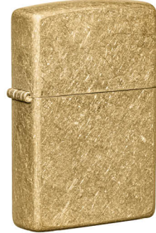
49477 Tumbled Brass $27.95