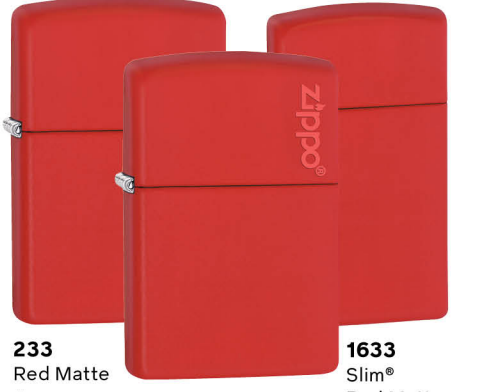
233 Red Matte $22.95