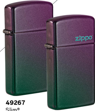
49267 Slim® Iridescent $24.95