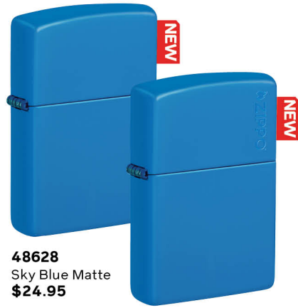
48628 Sky Blue Matte $24.95