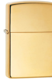
169 Armor® High Polish Brass $32.95