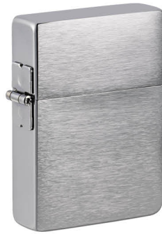
35 1935.25 1935 Replica Brushed Chrome $39.95