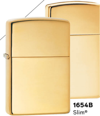
254B High Polish Brass $27.95