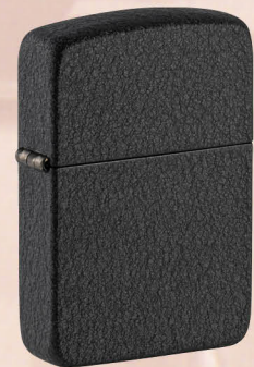
41 28582 1941 Replica Black Crackle® $32.95