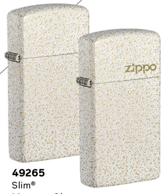
49265 Slim® Mercury Glass $22.95