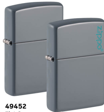
49452 Flat Grey $24.95