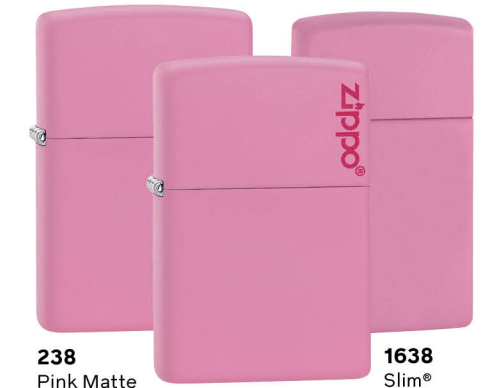
238 Pink Matte $22.95