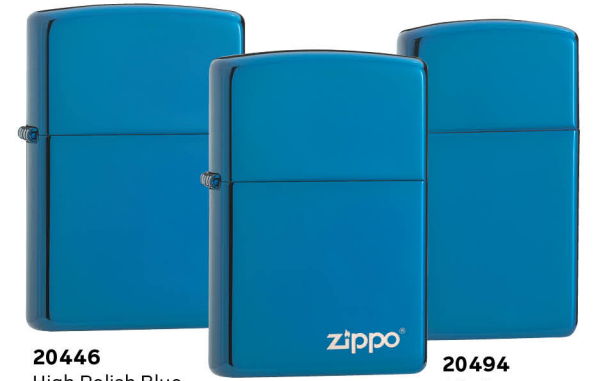
20446 High Polish Blue $29.95