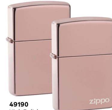
49190 High Polish Rose Gold $29.95