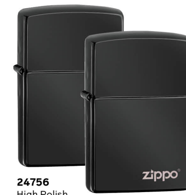
24756 High Polish Black $29.95