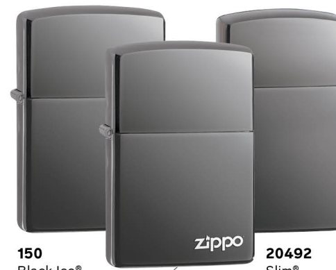
150 Black Ice® $29.95