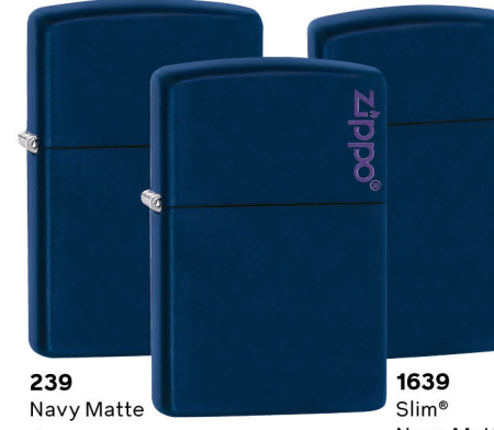
239 Navy Matte $22.95