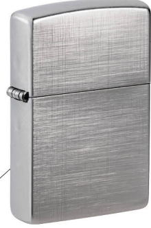
28181 Linen Weave $22.95