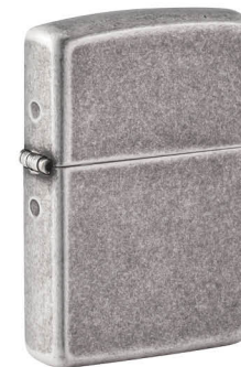
28973 Armor® Antique Silver $44.95