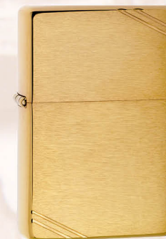
240 Vintage Brushed Brass $29.95