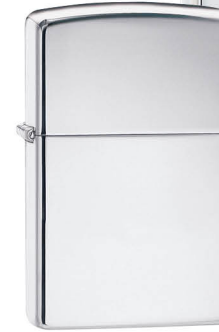
167 Armor® High Polish Chrome $29.95