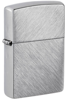
24648 Herringbone Sweep $22.95