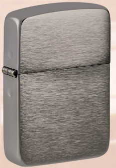
41 24096 1941 Replica Black Ice® $36.95