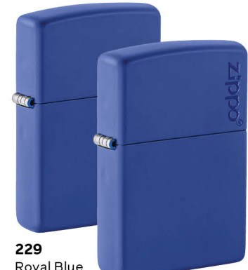
229 Royal Blue Matte $22.95