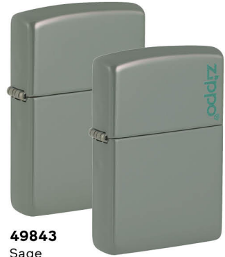
49843 Sage $24.95