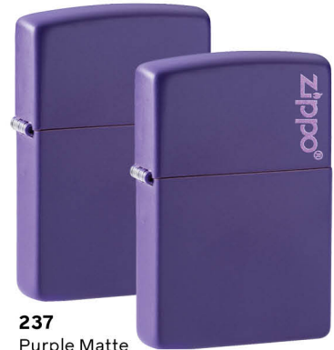
237 Purple Matte $22.95