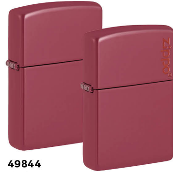
49844 Brick $24.95