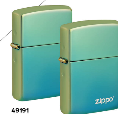
49191 High Polish Teal $29.95