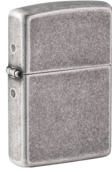
121FB Antique Silver $29.95