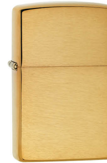
168 Armor® Brushed Brass $29.95