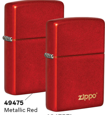
49475 Metallic Red $24.95