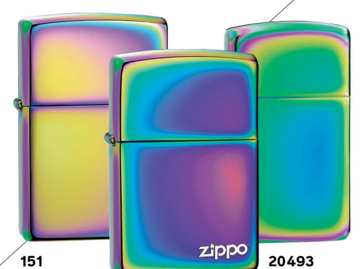
151 Multi Color $29.95