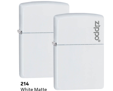
214 White Matte $22.95