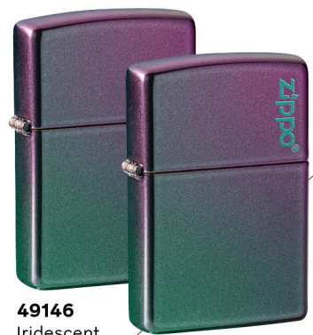
49146 Iridescent $24.95