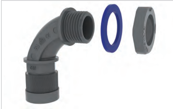
1 Prepare Connector, Rubber Washer(FWH), Nut(FLN/SLN) like in the Image