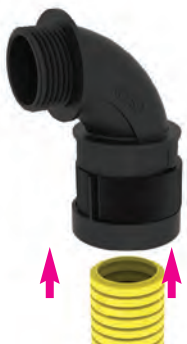
① Insert Tube to Connector