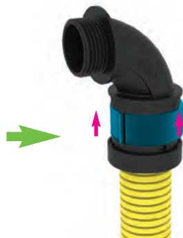
② Hand Cover moves up by inserting Flexible Tube