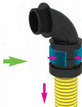
③ While grabbing extended Hand Cover and pull Flexible Tube down, Hand Cover is securely fixed