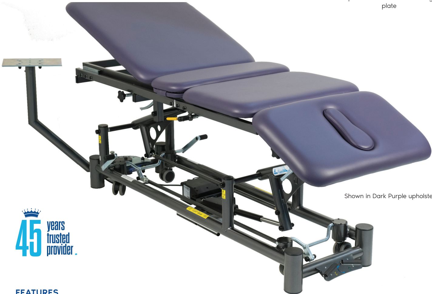
Shown in Dark Purple upholstery