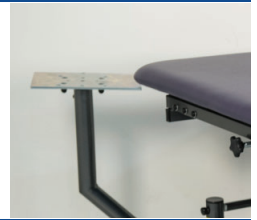
Traction mounting plate