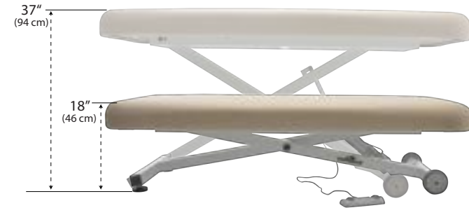
ADA compliant height range