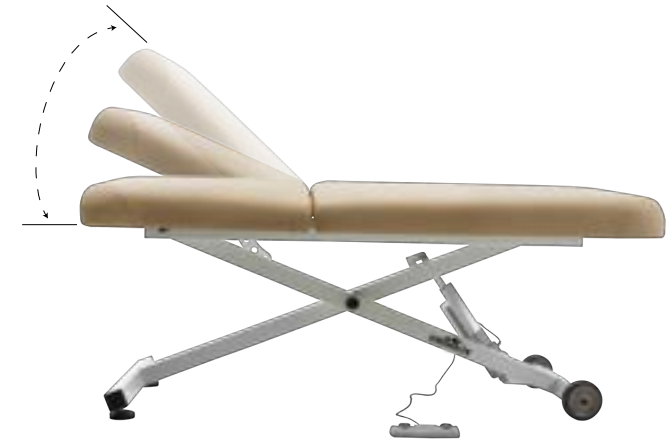
Tilt top with adjustments in 10° increments