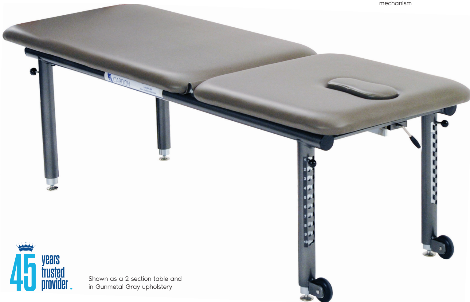
Bolt action quick-3adjust mechanism