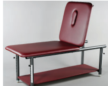
Shown as 2 section with optional shelf and gas