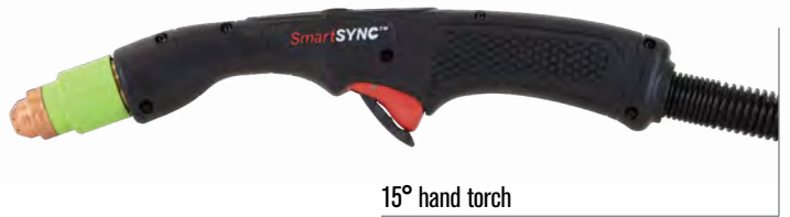
15° hand torch