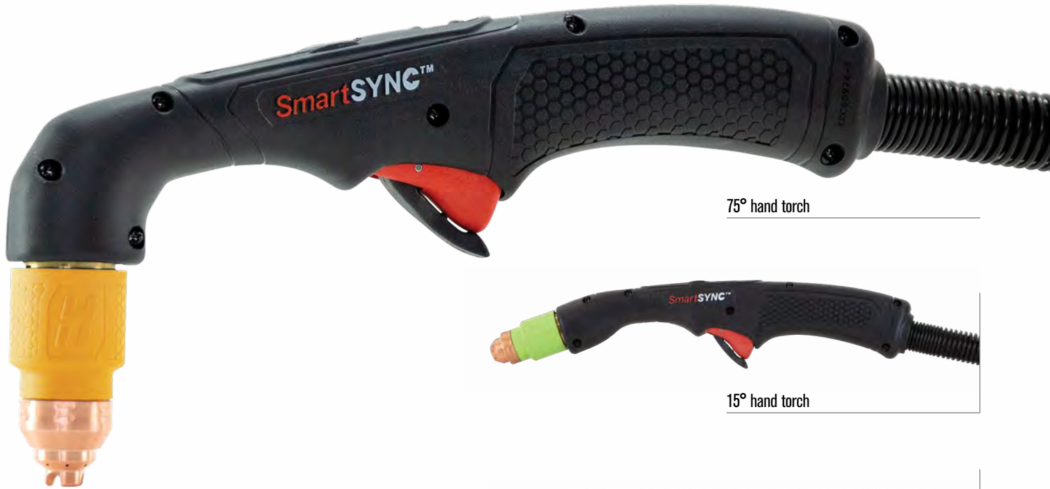
75° hand torch