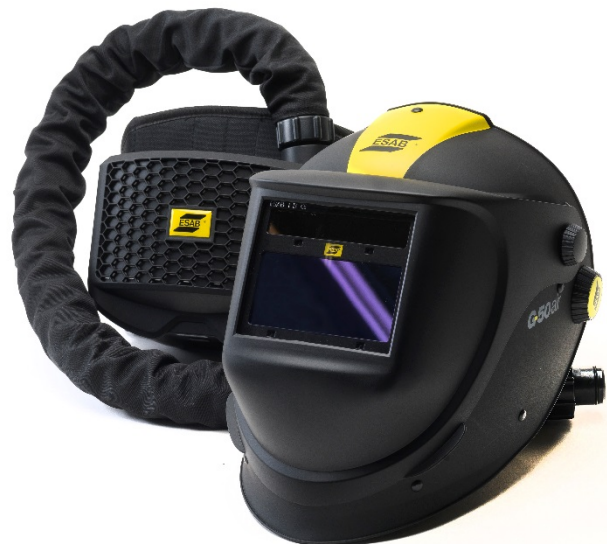
G50 Air with ESAB PAPR