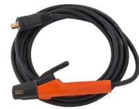
Welding cable 5 m 25 mm 2

The Flexlite TX torches are designed for use with MasterTig welding equipment. The torch range includes several neck models, offering superb cooling performance and good access to challenging joint designs.