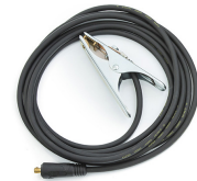
Earth return cable 5 m, 25 mm 2