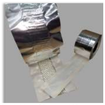
Available in 50mm or 100mm widths on 12.5m rolls