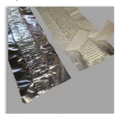
Medium gauge fibre glass cloth backing, 40mm wide for 100mm tape.