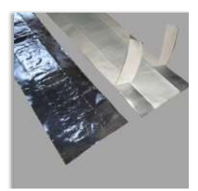
Light gauge fibre glass cloth backing, 25mm wide for 50mm tape.