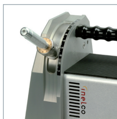
Grind the electrode in the desired angle.