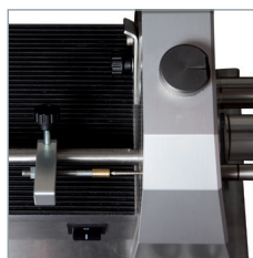
Set the cutting length.