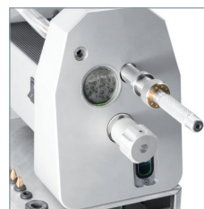
Cut the electrode by turning the handle.