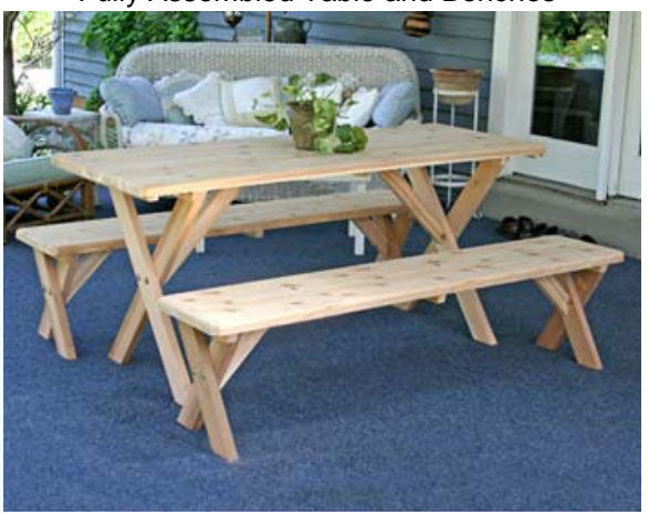
5 Foot Table Shown Above