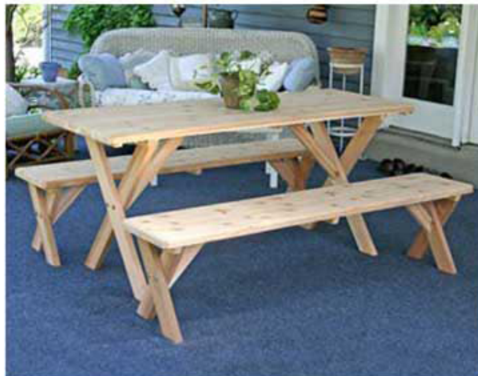
5 Foot Table Shown Above