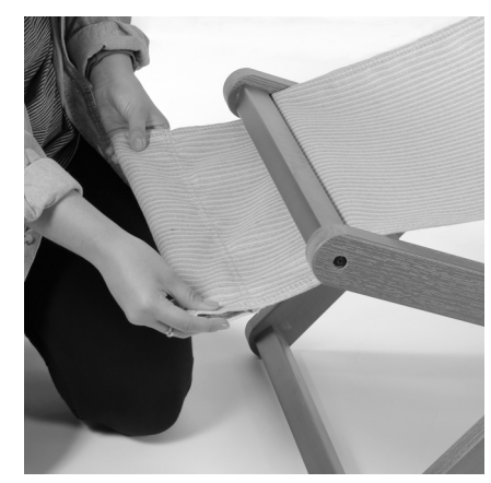
6) Pull the fabric through