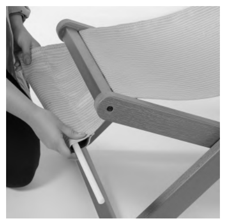
7) Thread the supplied dowel through the fabric opening