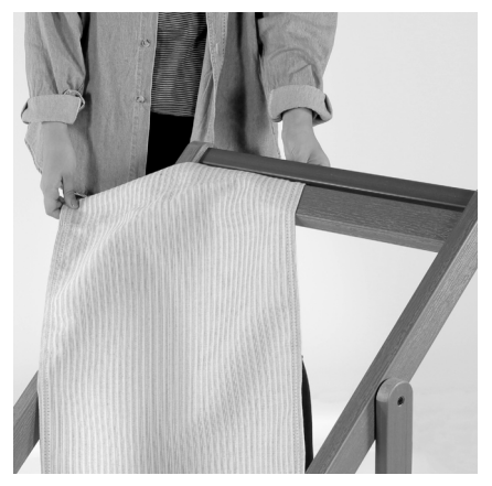
2) Slide fabric from the front through the gap at the top of the chair