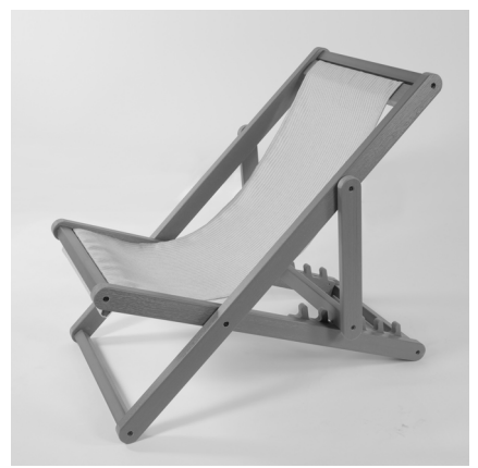
8) Enjoy your Arabella chair