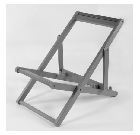
1) Unfold your Arabella sling chair