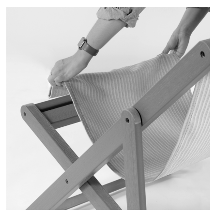
5) Slide fabric from the front through the gap at the bottom of the chair