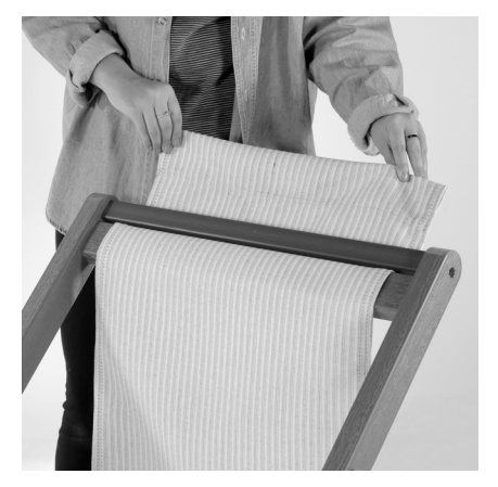
3) Pull the fabric through