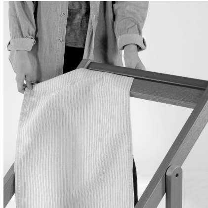
2) Slide fabric from the front through the gap at the top of the chair