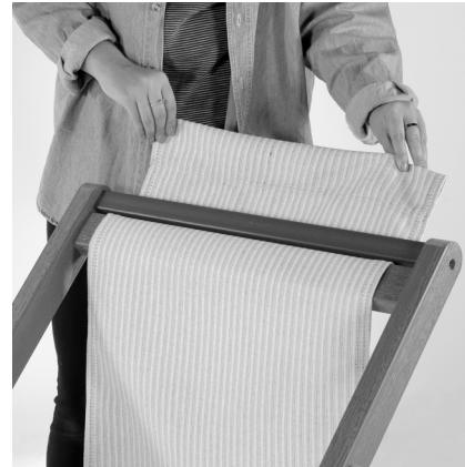
3) Pull the fabric through