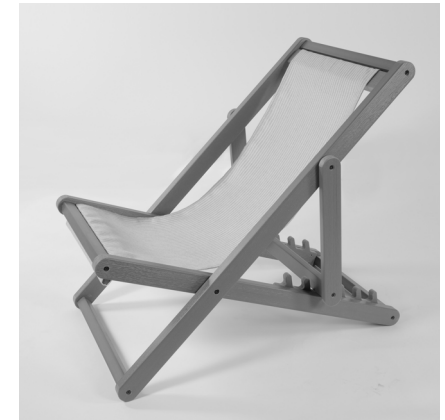
8) Enjoy your Arabella chair