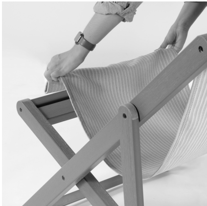
5) Slide fabric from the front through the gap at the bottom of the chair