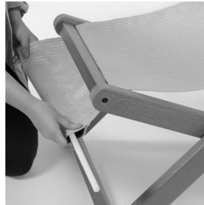
7) Thread the supplied dowel through the fabric opening