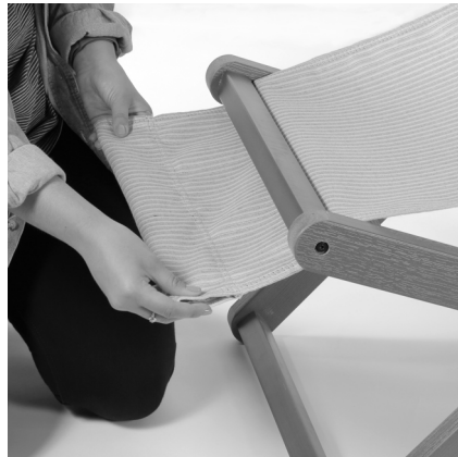
6) Pull the fabric through