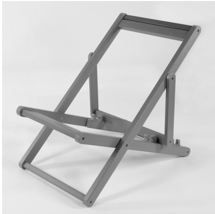
1) Unfold your Arabella sling chair