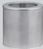
CARBON FILTER 2 YEARS