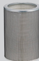
HEPA FILTER 3-5 YEARS