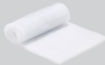
PREFILTER 12 MONTHS