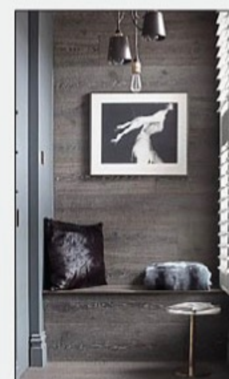
Lighting's vital: do your budget – then double it

mirrors: from Abigail Ahern ( abigailahern.com )