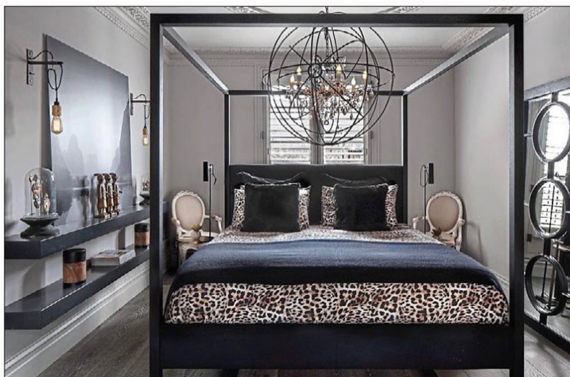
The middle-floor master bedroom: new plasterwork, modern four-poster and "gyroscope" chandelier

Drama: left, floor-to-ceiling French windows, exposed brick and the York stone-paved garden with trim olive trees