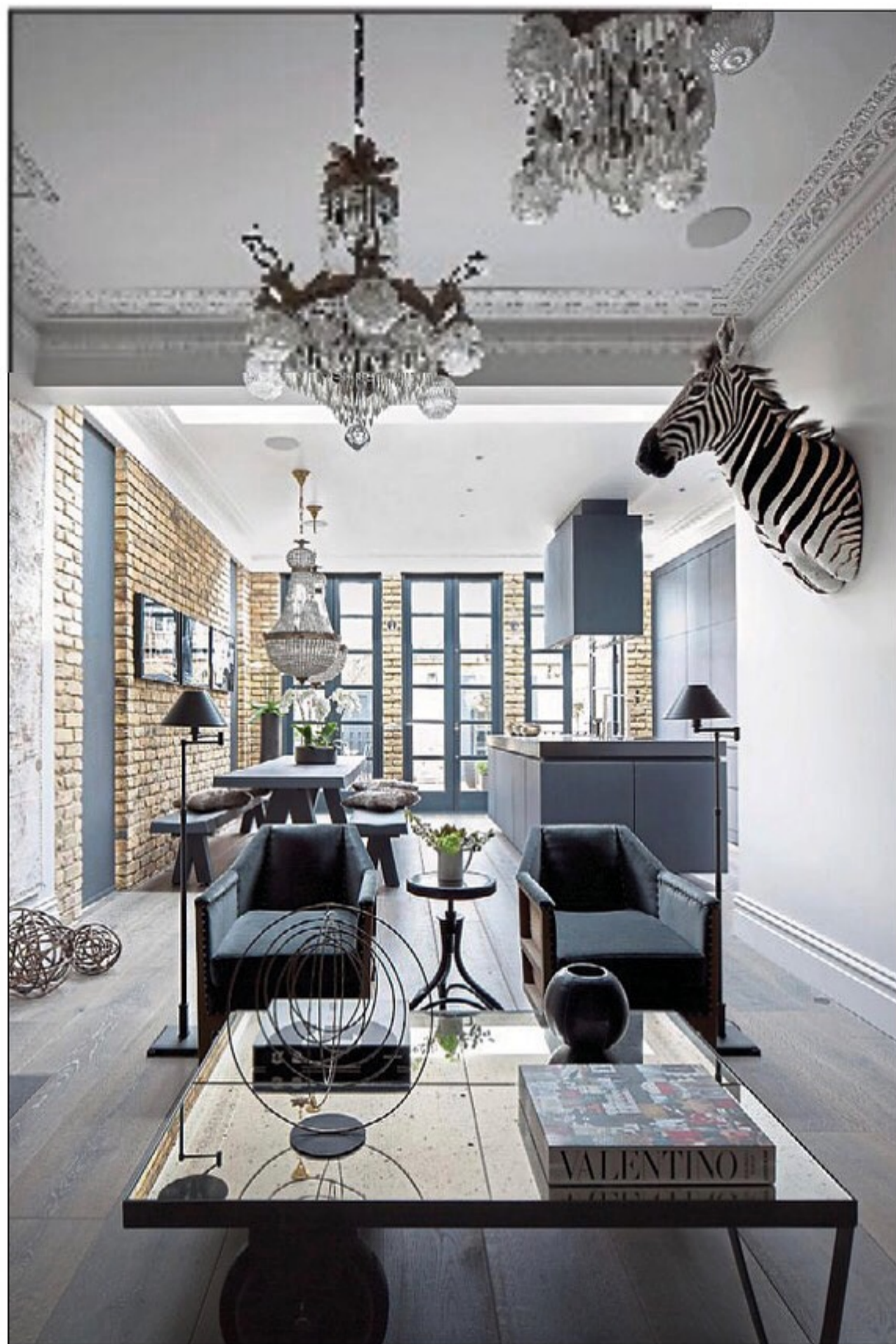
Shades of grey: the look is eclectic, romantic, yet with an industrial edge, both in the huge, knocked-through drawing-living area, above, and in a bathroom, below