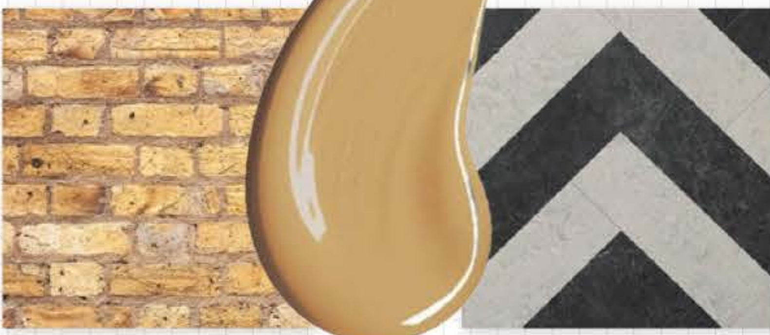
FROM LEFT Yellow Brick wallpaper, £28 per sq m, Wallpapered; Cherished Gold matt emulsion, £24.49 for 2.5l, Dulux; and Zig Zag lino flooring, £69.60 per sq m, Sinclair Till