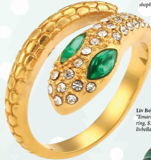
Liv Bella Vita "Emaris" snake ring, $38 at livbellavita.com