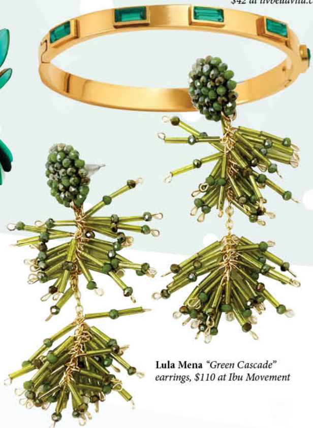
Lula Mena "Green Cascade" earrings, $110 at Ibu Movement