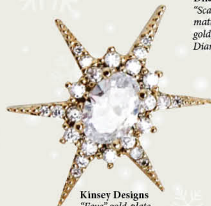
Kinsey Designs "Faye" gold-plate and cubic zirconia stud earrings, $64 at Copper Penny