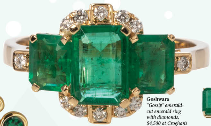
Goshwara "Gossip" emerald-cut emerald ring with diamonds, $4,500 at Croghan's Jewel Box