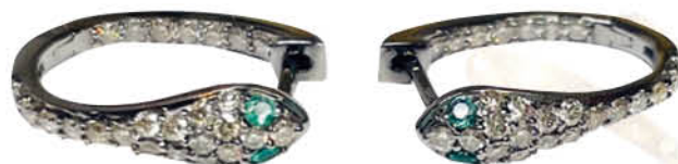
Theodosia silver snake huggie earrings, $1,000 at theodosiajewelry.com