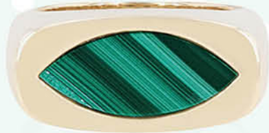
Classique Creations green onyx signet ring, $3,700 at Diamonds Direct