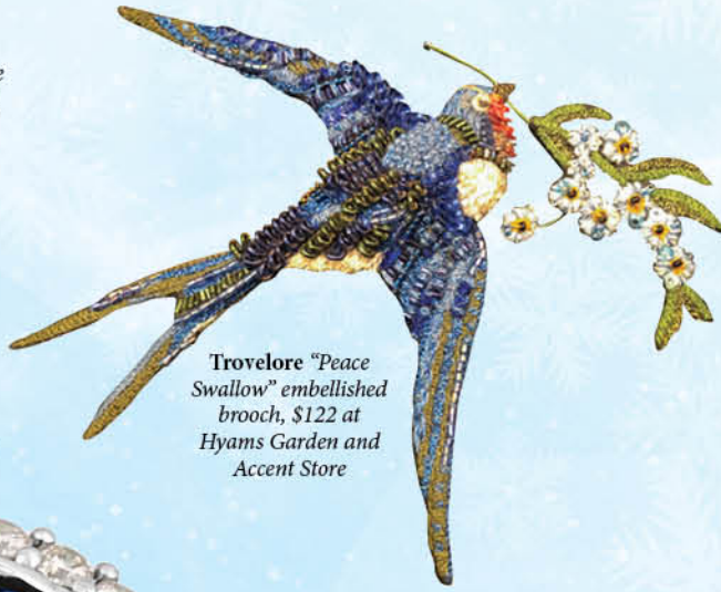
Trevolore "Peace Swallow" embellished brooch, $122 at Hyams Garden and Accent Store