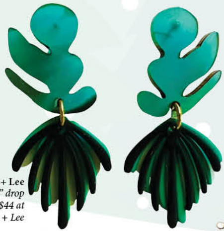
Holst + Lee "Matisse" drop earrings, $44 at Holst + Lee