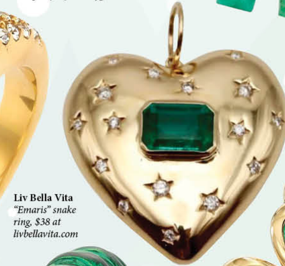
Emerald and diamond 14K-gold heart pendant, $1,725 at Croghan's Jewel Box