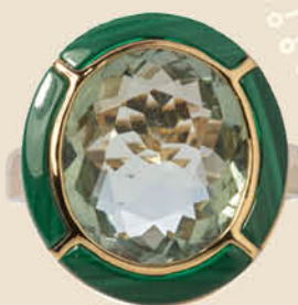
Goshwara prasiolite ring with malachite inlay, $2,600 at Croghan's Jewel Box