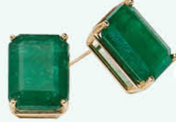
Jane Pope large emerald-cut emerald earrings (15.12 total carat weight), $5,898 at Jane Pope Jewelry