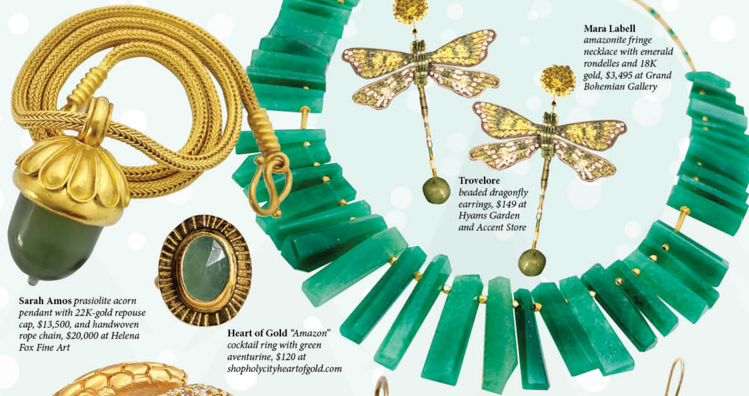
Mara Labell amazonite fringe necklace with emerald rondelles and 18K gold, $3,495 at Grand Bohemian Gallery