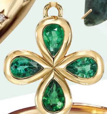
Single Stone "Emerald Rosemary Cross" pendant, $6,400 at Croghan's Jewel Box