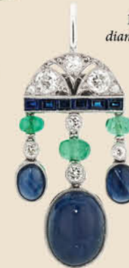
Kiersten Elizabeth sapphire, emerald, and diamond earrings in platinum, $3,900 at kierstenelizabeth.com