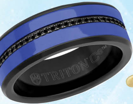
Triton black sapphire, black tungsten carbide, and blue ceramic men's band, $750 at reeds.com