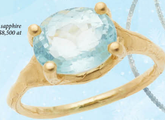
Christina Jervey aquamarine and 14K-gold ring, $2,275 at christinajervey.com