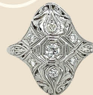
Estate old European-cut diamond navette ring, $1,750 at Gold Creations