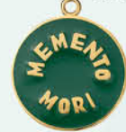
Hart "Memento Mori" charm, $80 at Hart Jewelry

Color them happy with these pieces crafted from emeralds, malachite, onyx, and more