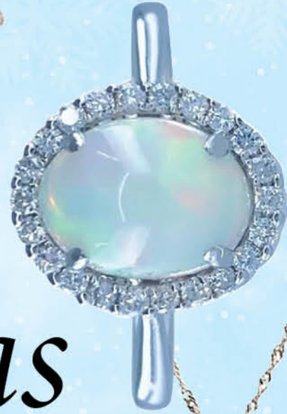
Opal and pavé diamond ring, $750 at Polly's Fine Jewelry