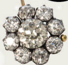
Estate old transitional-cut diamond cluster earrings, $33,000 at Croghan's Jewel Box