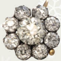
Vintage diamond dangle earrings, $6,000 at Sandler's Diamonds & Time