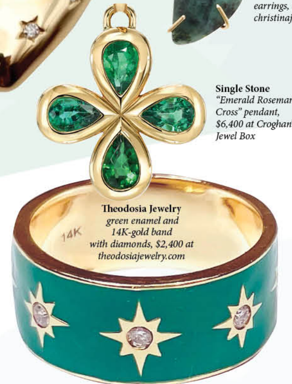
Theodosia Jewelry green enamel and 14K-gold band with diamonds, $2,400 at theodosiajewelry.com