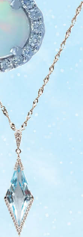
Blue topaz kite pendant with pavé diamonds, $1,800 at Sandler's Diamonds & Time