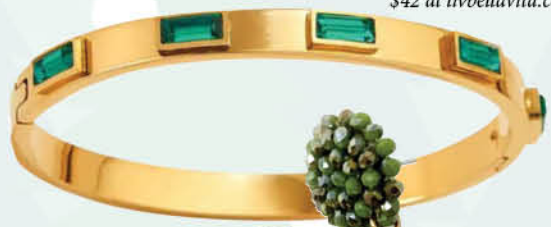
Liv Bella Vita "Seraphire" bangle, $42 at livbellavita.com