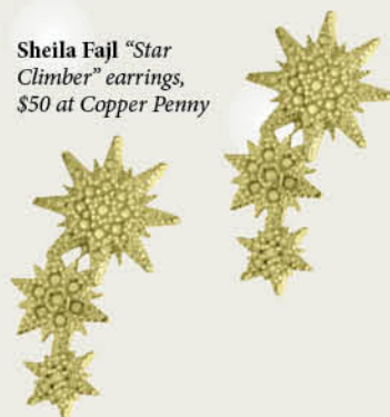
Sheila Fajl "Star Climber" earrings, $50 at Copper Penny