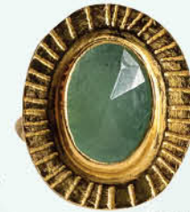
Heart of Gold "Amazon" cocktail ring with green aventurine, $120 at shopholycityheartofgold.com