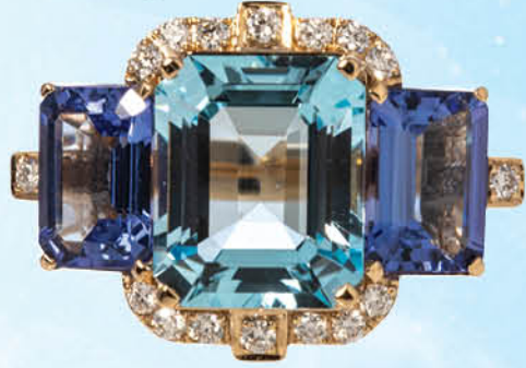
Goshwara "Gossip" blue topaz, tanzanite, and diamond ring, $3,450 at Croghan's Jewel Box