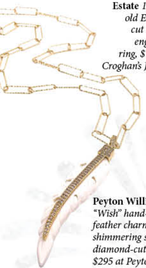
Peyton William "Wish" hand-carved feather charm with shimmering stones and diamond-cut chain, $295 at Peyton William