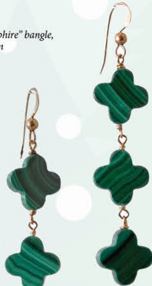
Hermosa Jewelry malachite quatrefoil earrings, $50 at Hermosa Jewelry