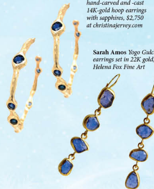
Christina Jervey hand-carved and -cast 14K-gold hoop earrings with sapphires, $2,750 at christinajervey.com