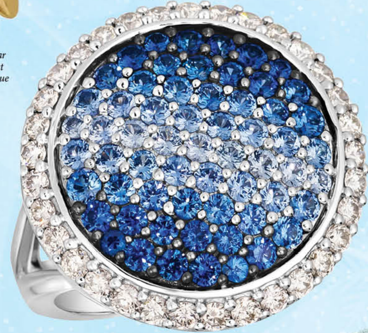
Le Vian "Denim Ombre" sapphire and diamond ring, $4,200 at reeds.com