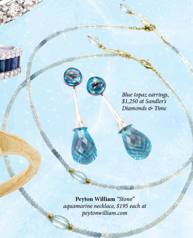
Peyton William "Stono" aquamarine necklace, $195 each at peytonwilliam.com