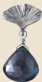
Hermosa "Ginkgo" earrings with London blue topaz, $88 at Hermosa Jewelry