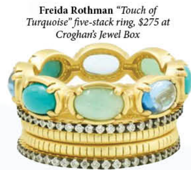
Freida Rothman "Touch of Turquoise" five-stack ring, $275 at Croghan's Jewel Box