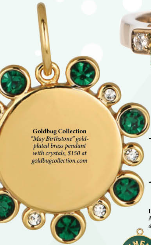
Goldbug Collection "May Birthstone" gold-plated brass pendant with crystals, $150 at goldbugcollection.com