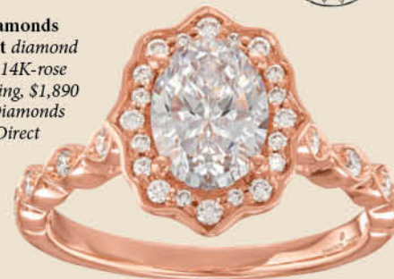
Diamonds Direct diamond and 14K-rose gold ring, $1,890 at Diamonds Direct