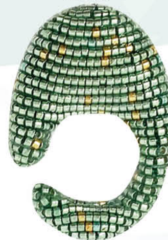
Handcrafted "Sura" beaded statement ring with gold accents, $165 at Ibu Movement