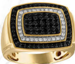
Reeds black-and-white diamond men's ring, $1,000 at reeds.com