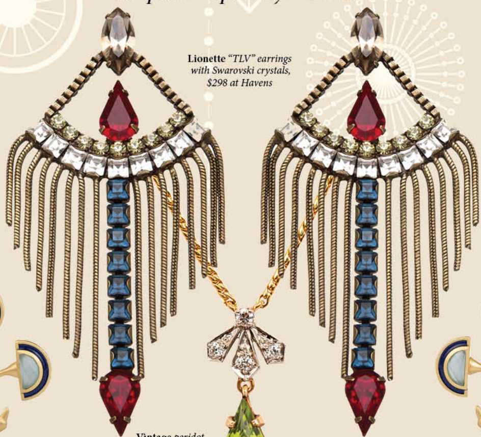
Lionette "TLV" earrings with Swarovski crystals, $298 at Havens