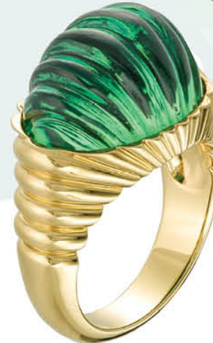
Classique Creations green quartz dome ring, $2,400 at Diamonds Direct