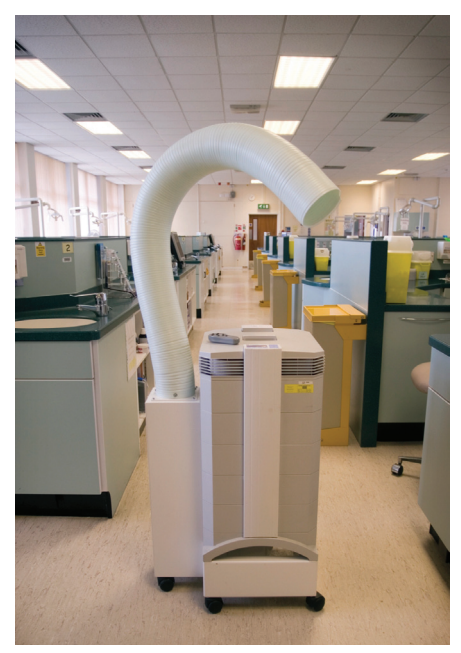
Fig. 1 The IQAir: FlexVac<sup>™</sup> air cleaning system used in this study

IQAir: FlexVac<sup>™</sup> equipment. The IQAir system (Fig. 1) comprises a 1,500 mm long flexible polypropylene plastic suction duct (125 mm diameter) that firstly directs air through a combination of High Efficiency Particulate Air (HEPA) pre-filters which retain particles less than 0.3 µm in size (which includes bacteria and many types of virus). A second filtration stage involves four cylinder gas filter cartridges, which remove mercury vapour, formaldehyde, glutaraldehyde and odours. The final filtration stage comprises of an electrostatically charged post-filter.