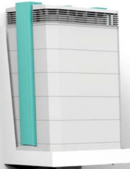
VM FlexVac™ wall-mounted source capture kit