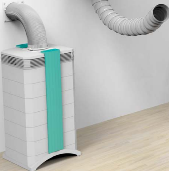
OutFlow™ ducting adaptor