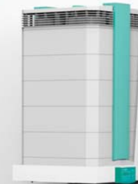
SMC* side-mounted control panel and VMF wall-mount bracket