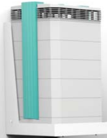
VMF wall-mounted bracket