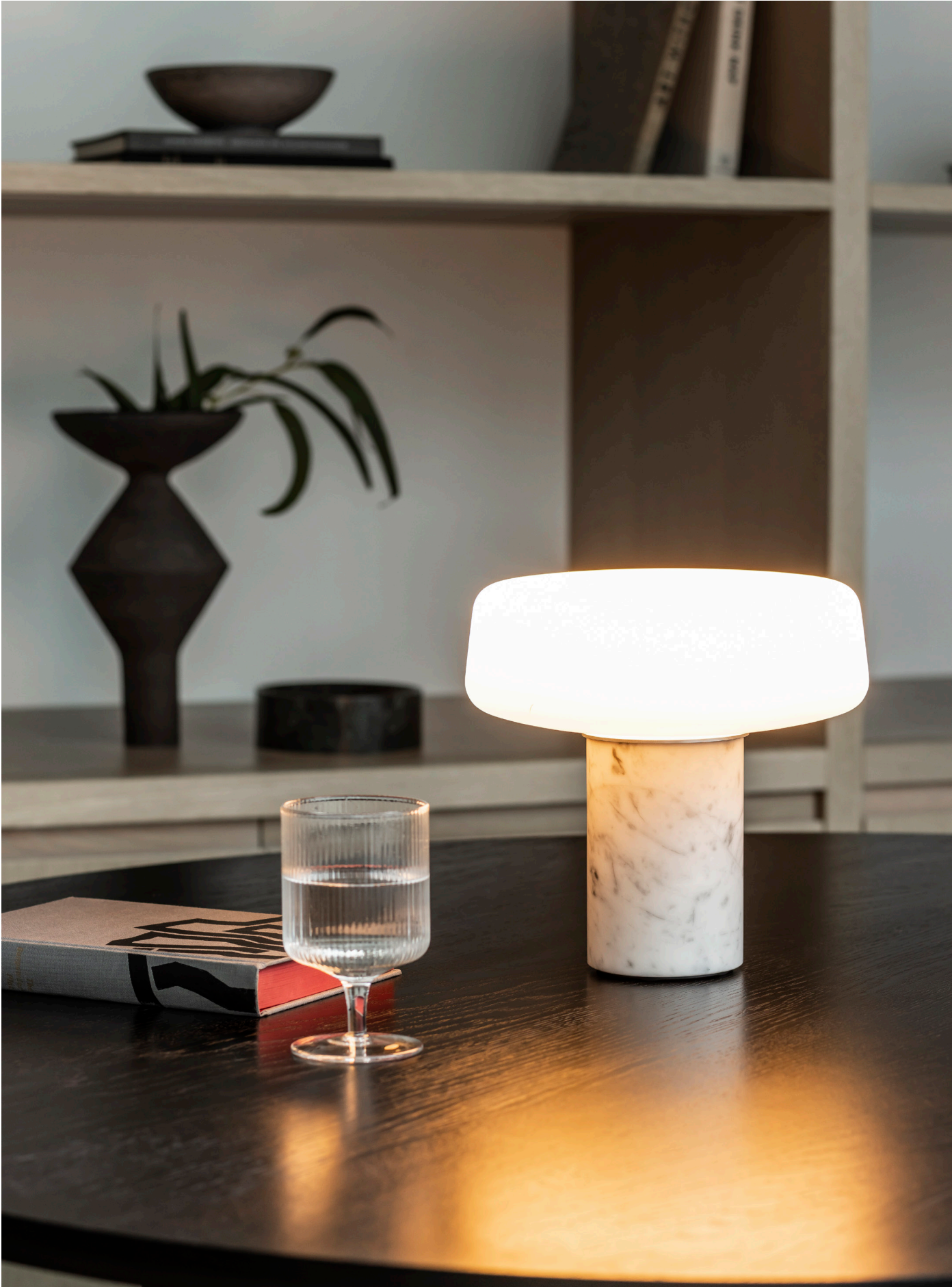
Solid Rechargeable Light by Terence Woodgate