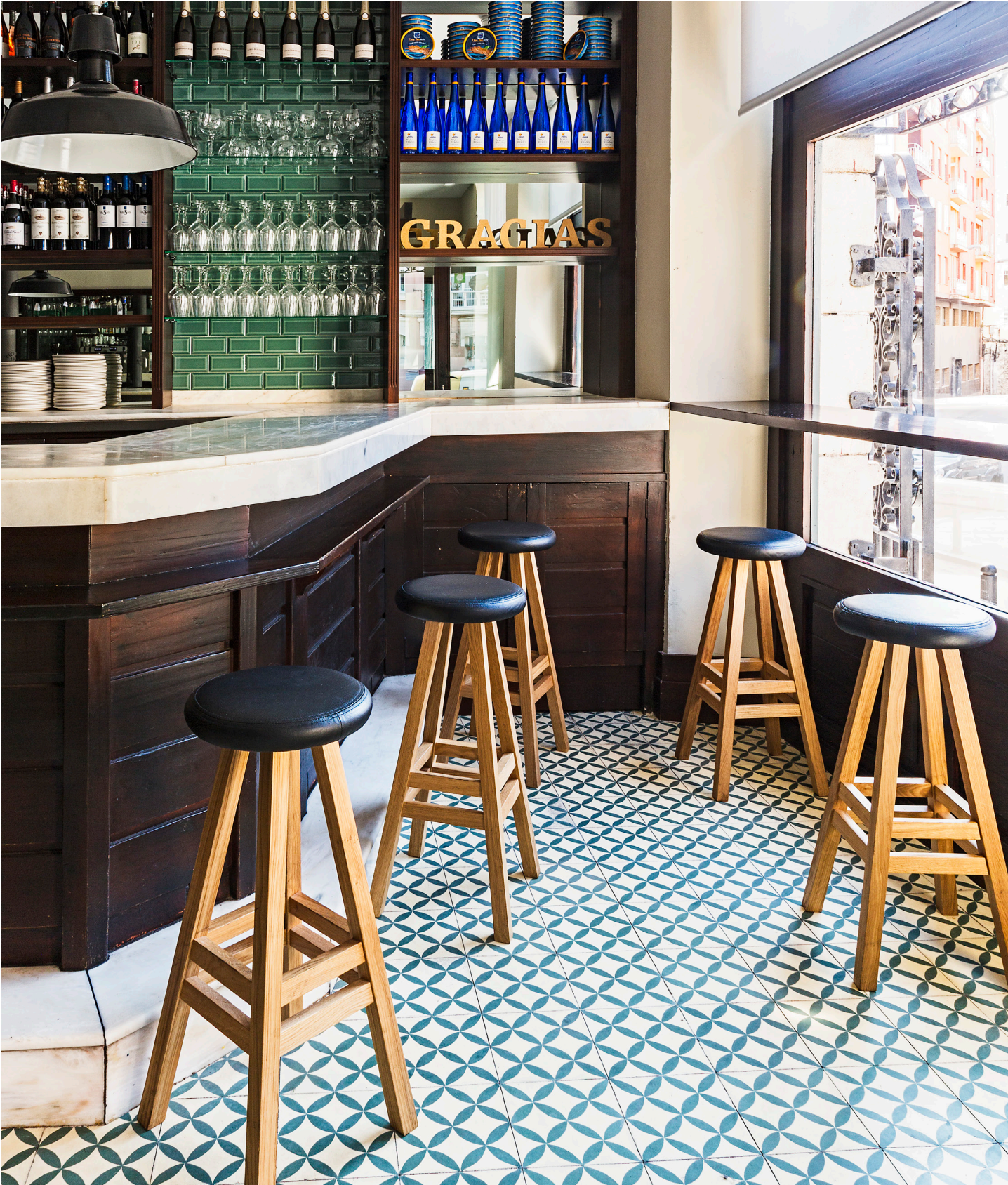
Oki-Nami Stool by Nazanin Kamali