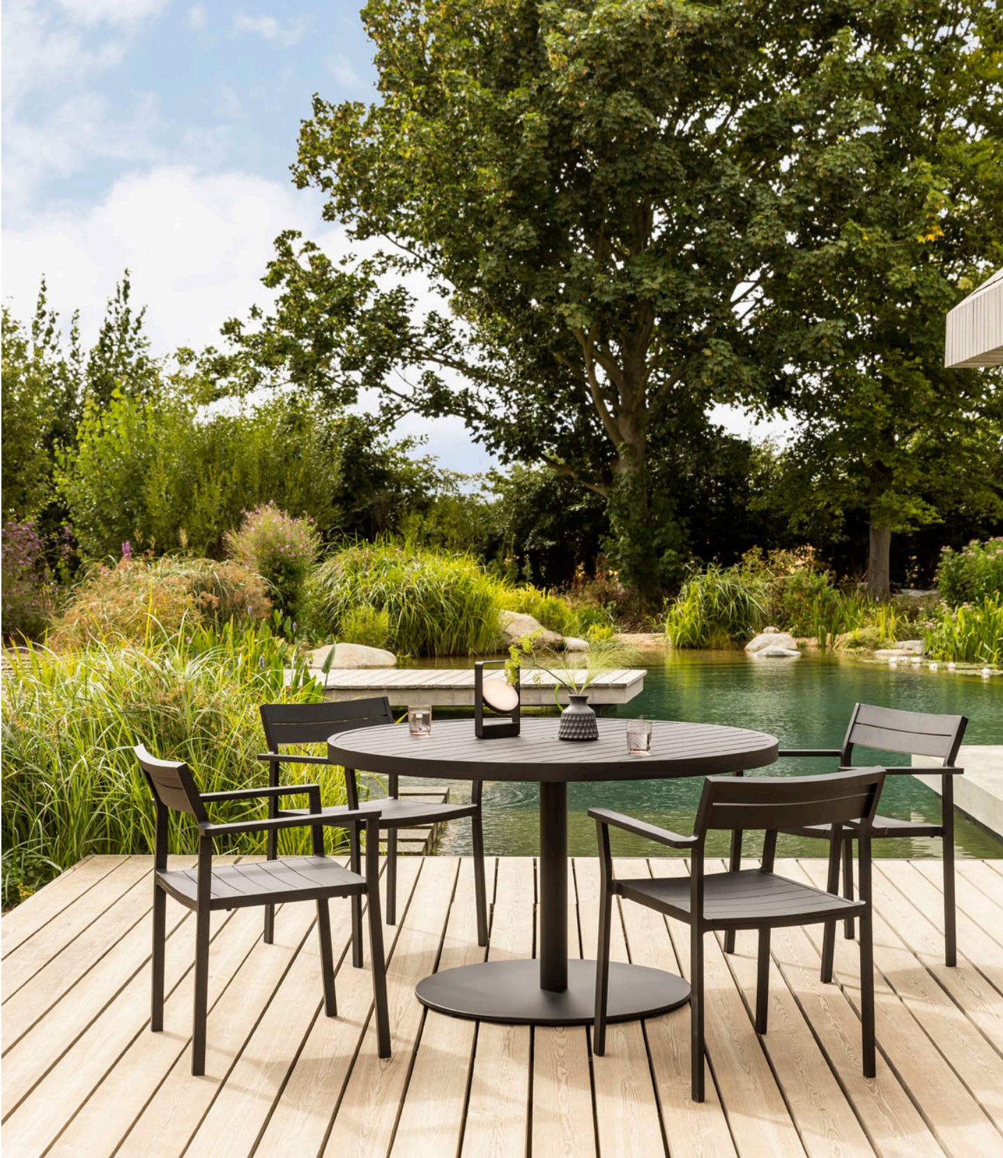
Eos Round Table by Matthew Hilton