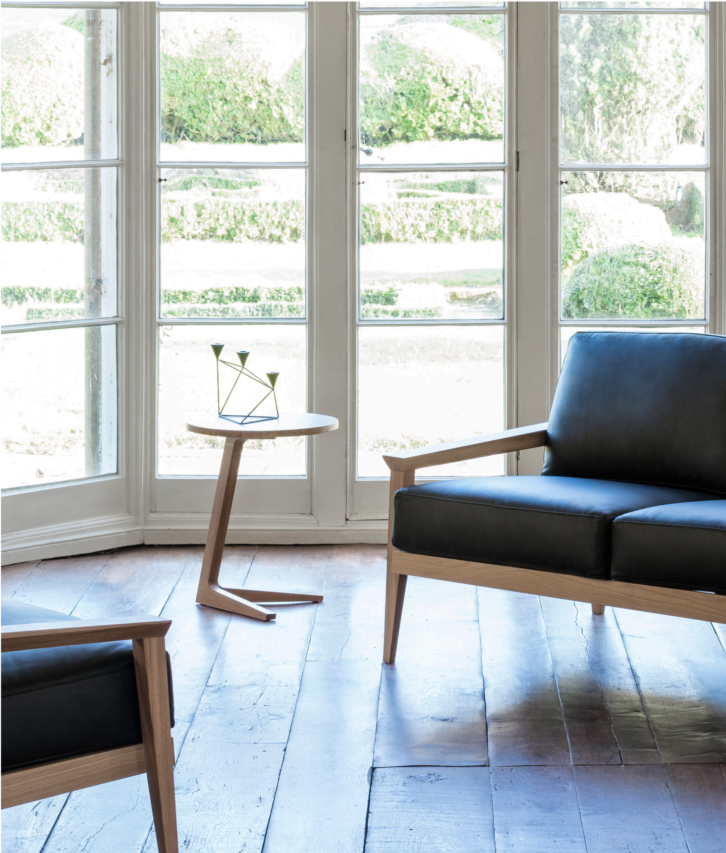
Cross Side Table by Matthew Hilton