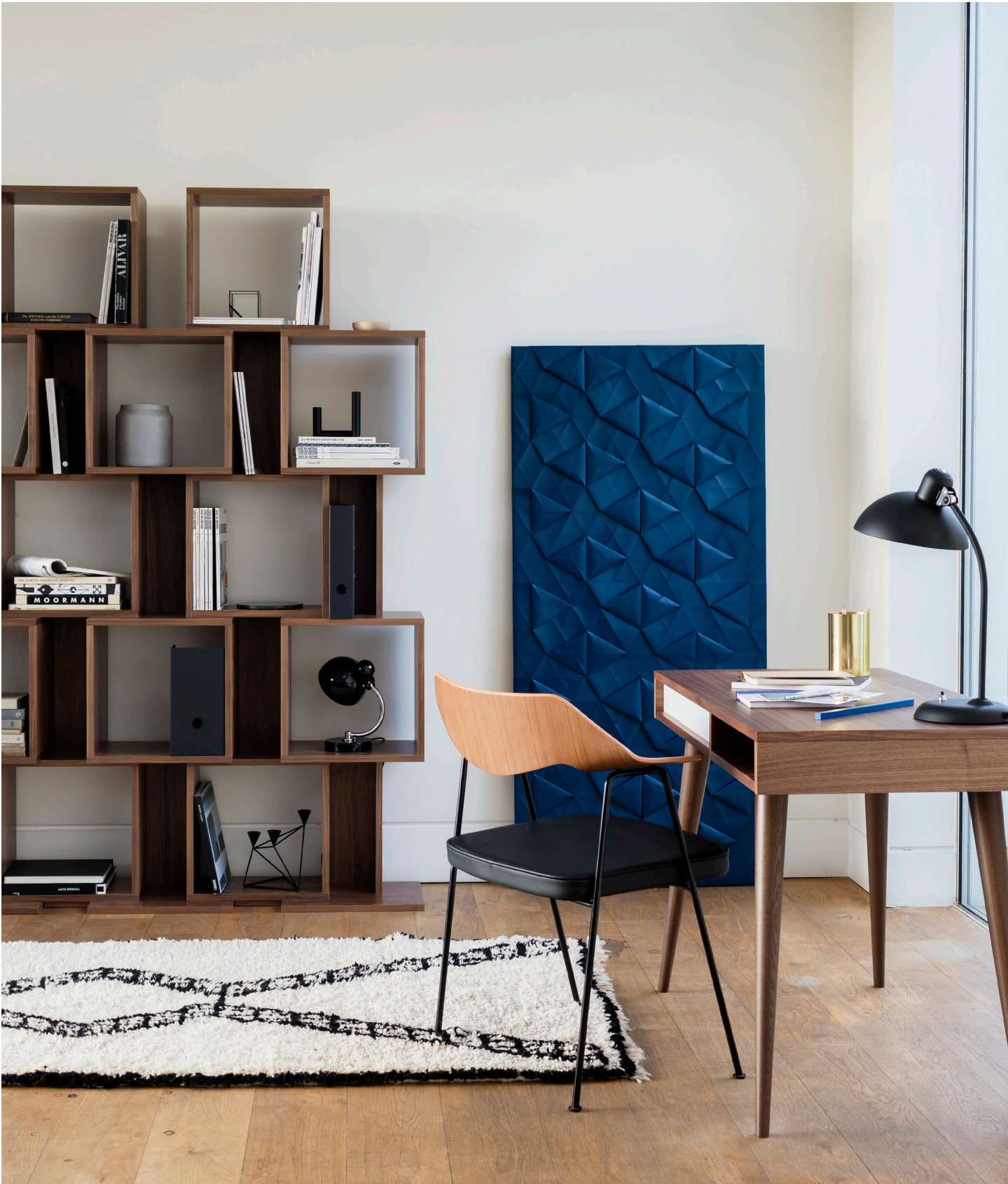
675 Chair by Robin Day