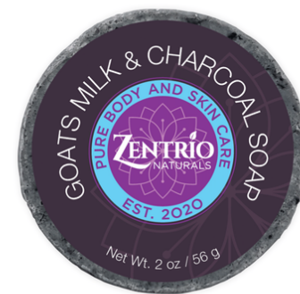
Goat's Milk And Charcoal - Face Soap