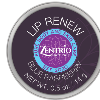
Lip Renew - Lip Balm