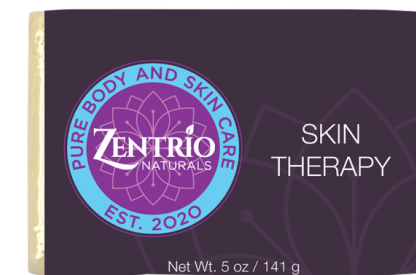
Skin Therapy - Scalp & Body Soap