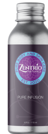
Pure Infusion - Anti-Dry Scalp Oil