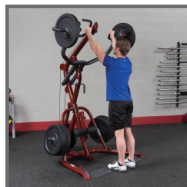
Standing Shoulder Press