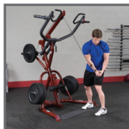
Cross Body Chop