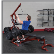
Lat Pull Downs