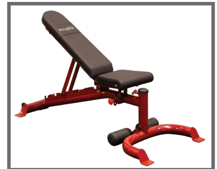
GFID100 Heavy Duty Flat Incline Decline Bench