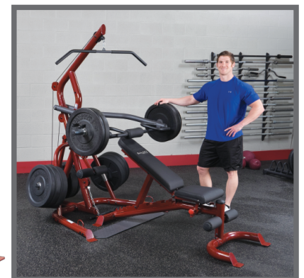
GLGS100 with GFID100 and Bumper Plates Bench, Plates and Collars sold separately