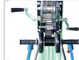
CS - series Manual Operation