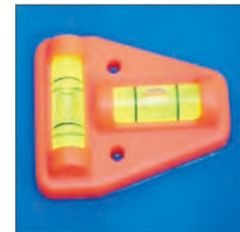
Equipped with level to help operator ensure safe setup.