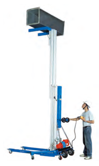
◆ ES-700 with optional pipe forks. ◆ ES-700 with standard forks