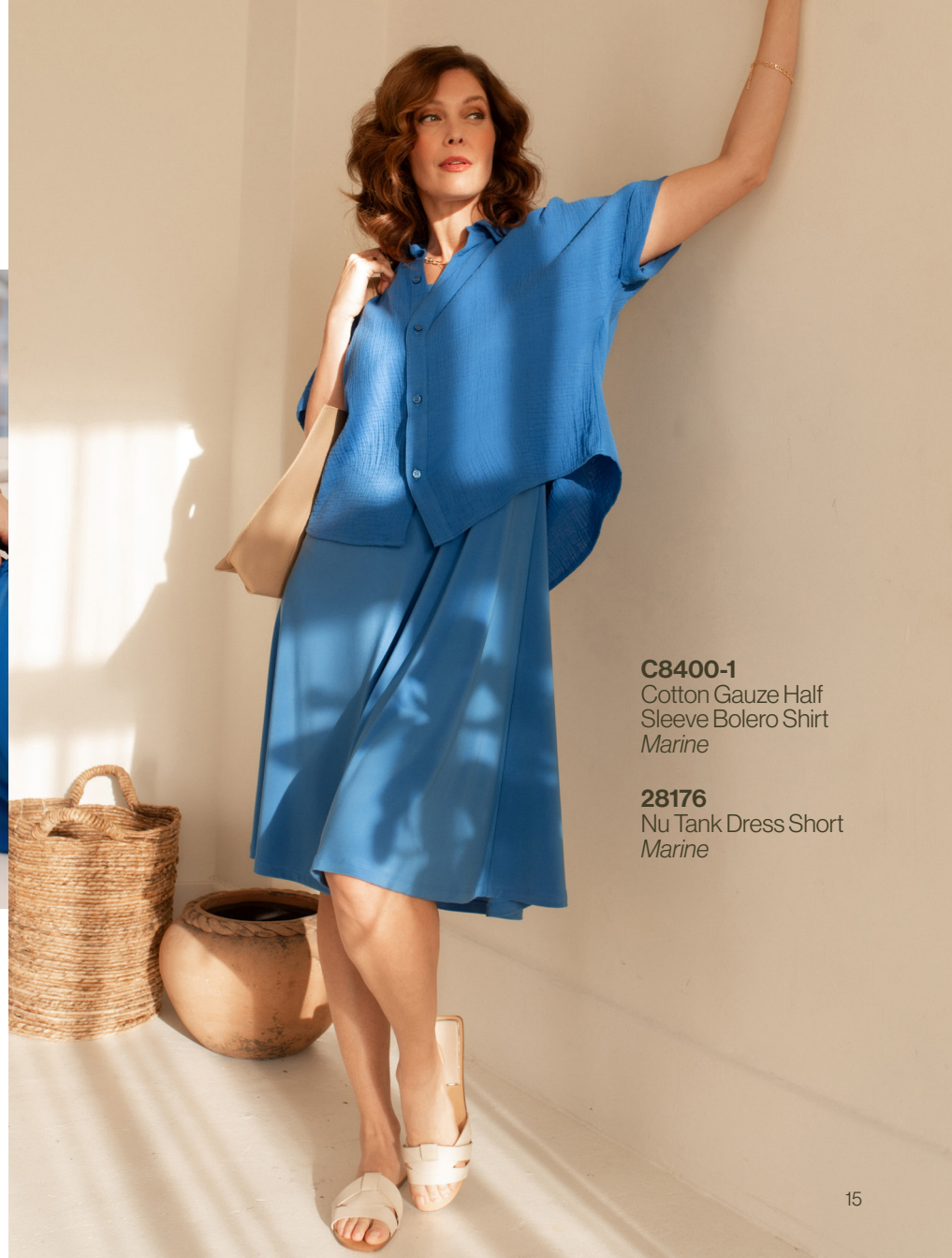
C8400-1 Cotton Gauze Half Sleeve Bolero Shirt Marine