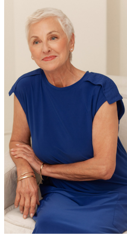
28171-0 Convoy Patched Sheath Twilight