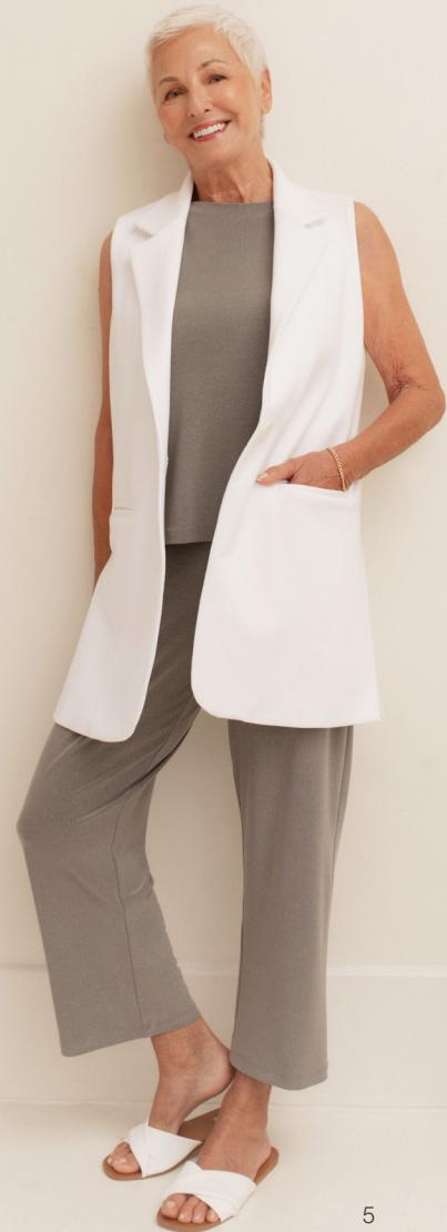
27272C Nu Straight Leg Crop Melange Sand

High quality pieces proudly made in Canada.