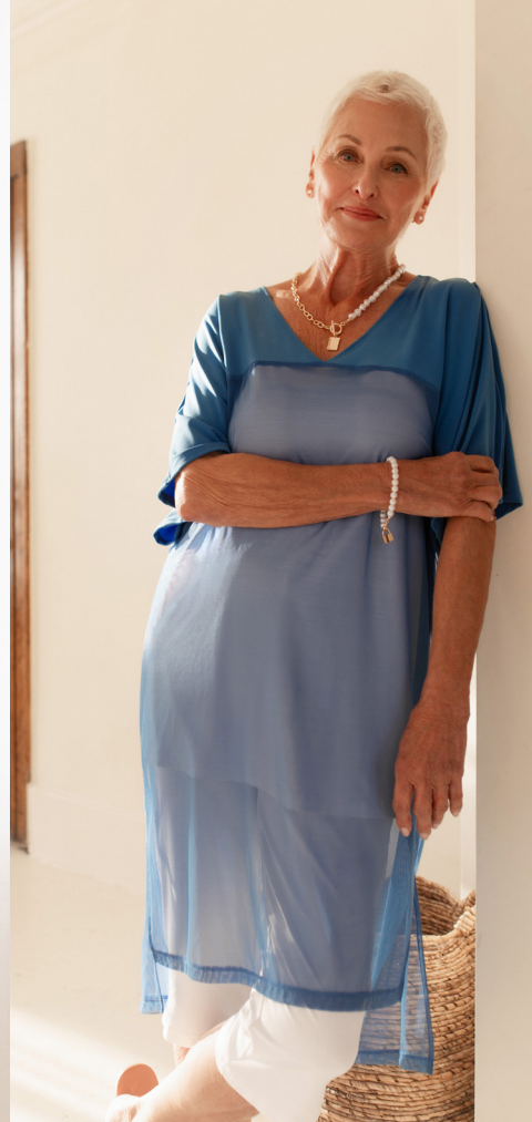
3329 Mesh Cover Up Marine