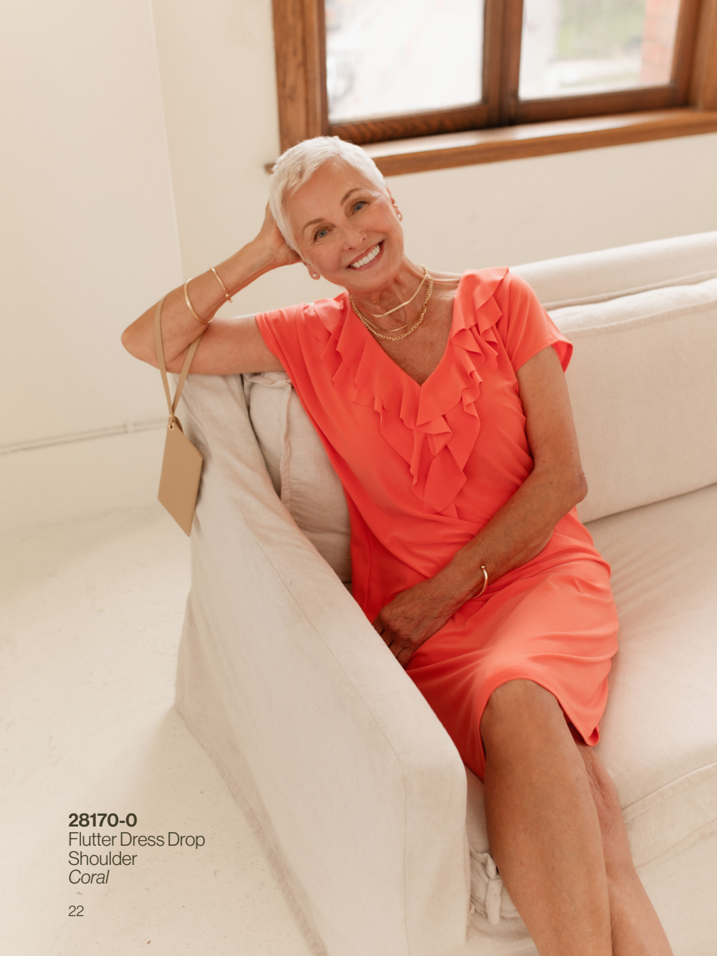
28170-0 Flutter Dress Drop Shoulder Coral