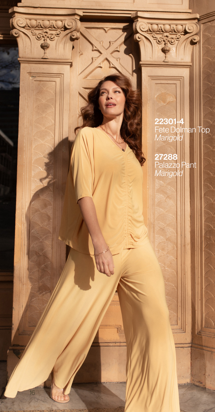
22301-4 Fete Dolman Top Marigold