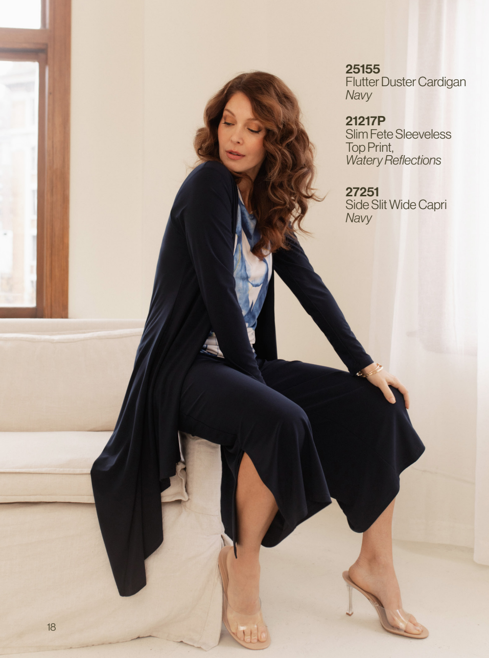
25155 Flutter Duster Cardigan Navy