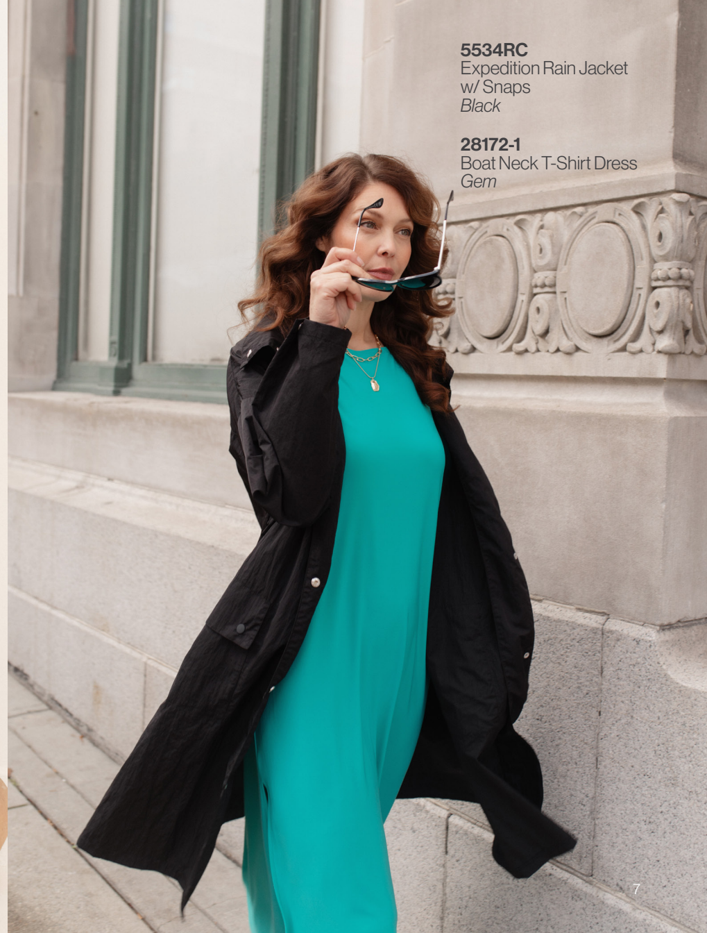
5534RC Expedition Rain Jacket w/ Snaps Black