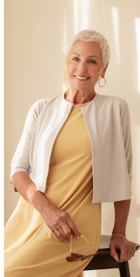
25156-4 Classic Bolero Cardigan Cashew