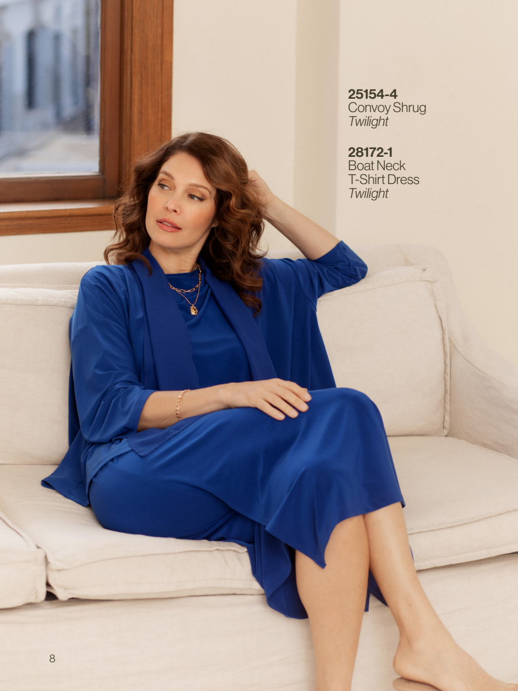
25154-4 Convoy Shrug Twilight