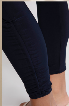
27283 Revelry Ruched Legging Navy