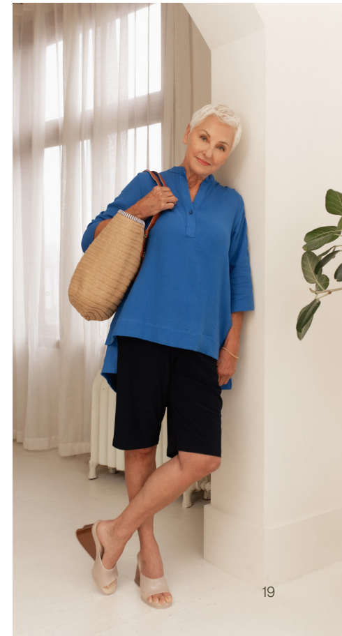
C8301-2 Cotton Gauze Overshirt, 3/4 Sleeve Marine