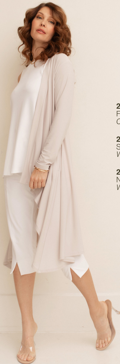
25155 Flutter Duster Cardigan Cashew