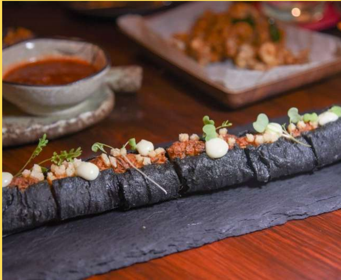
STUFFED YOU TIAO, OTAH AND KAFFIR LIME MAYO