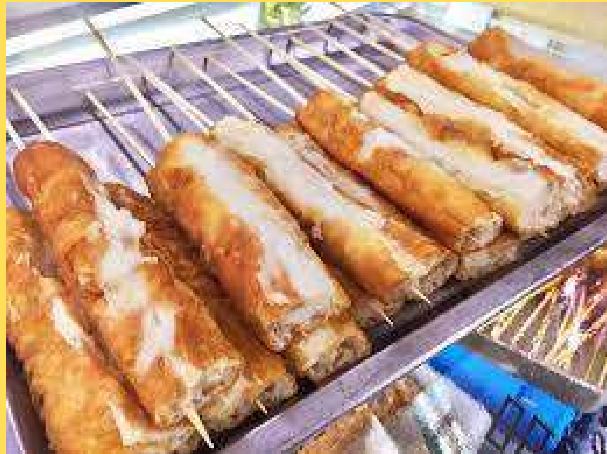
SOTONG YOU TIAO 苏东油条串 (DLLM Lok Lok)