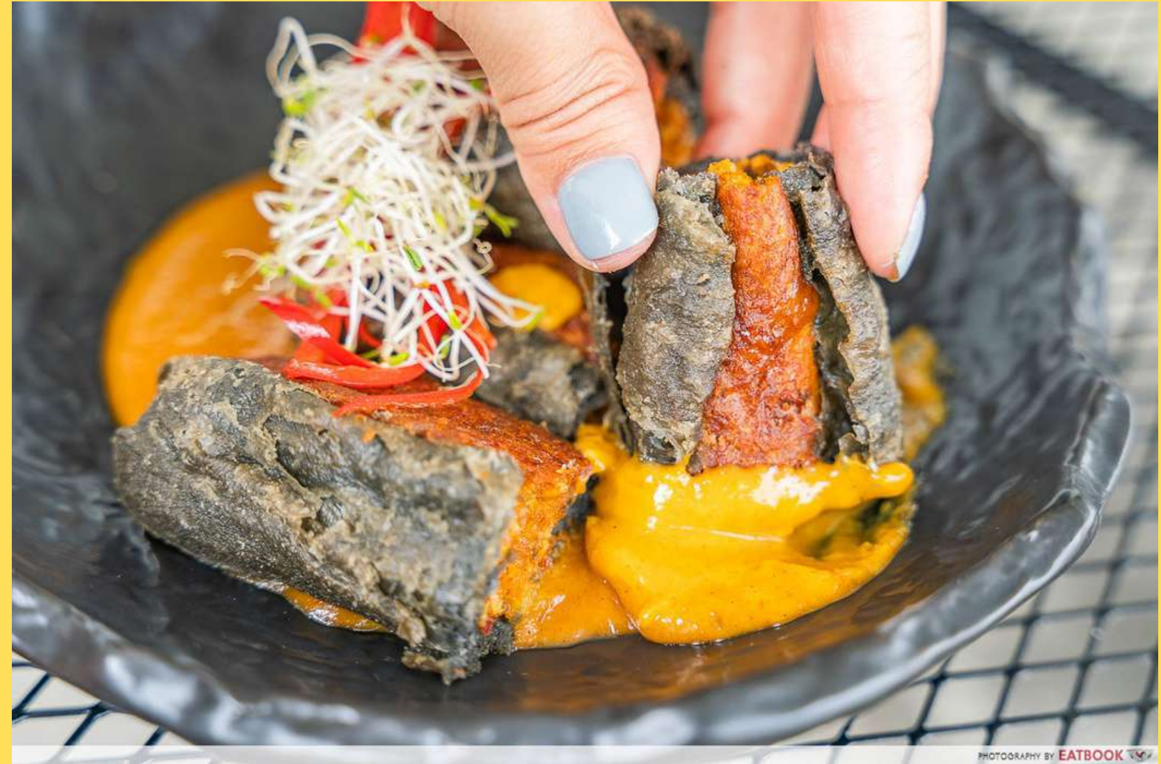
OTAH YOU TIAO