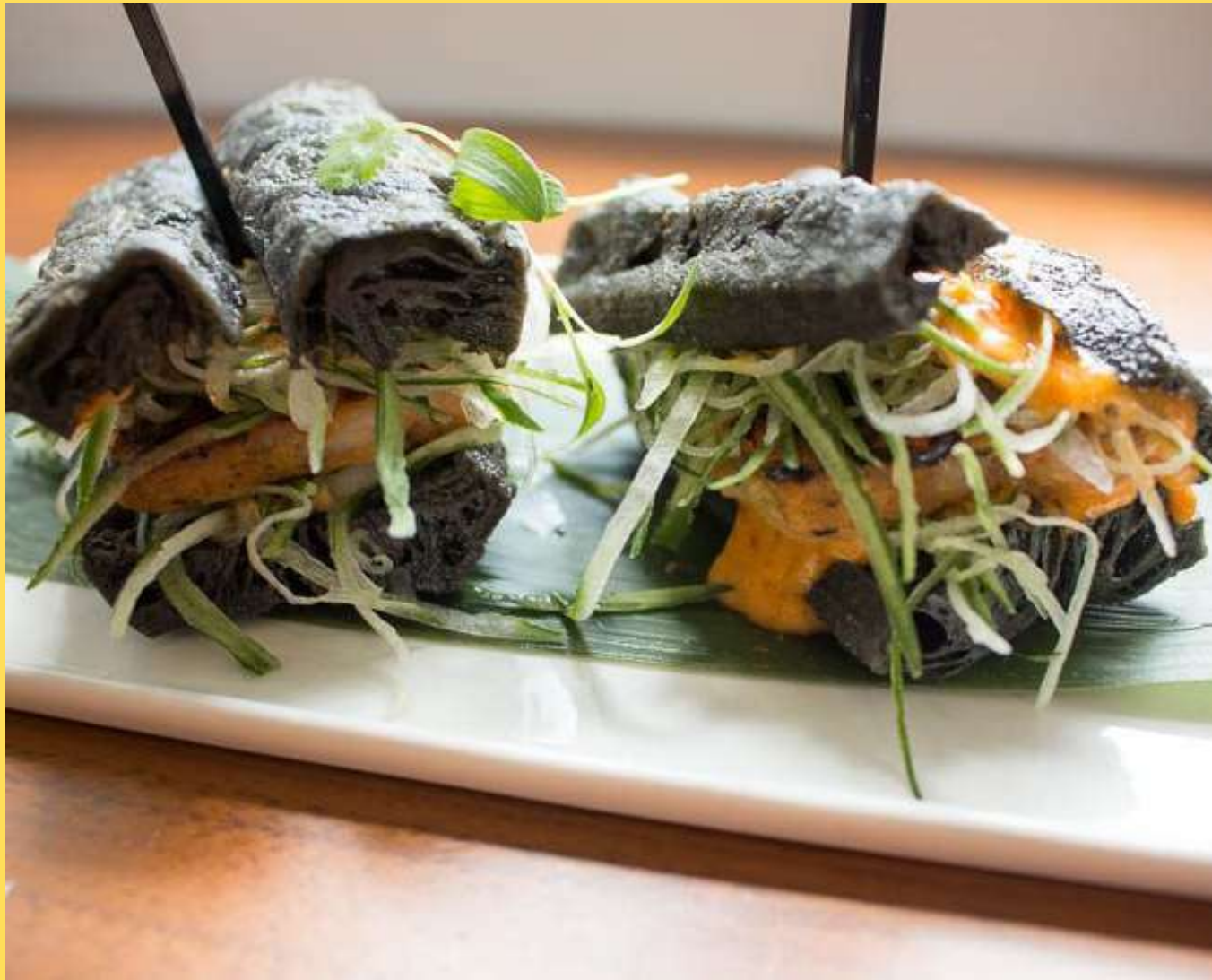
OTAH YOU TIAO SANDWICH 乌达竹炭三文治 (Baba Chew)