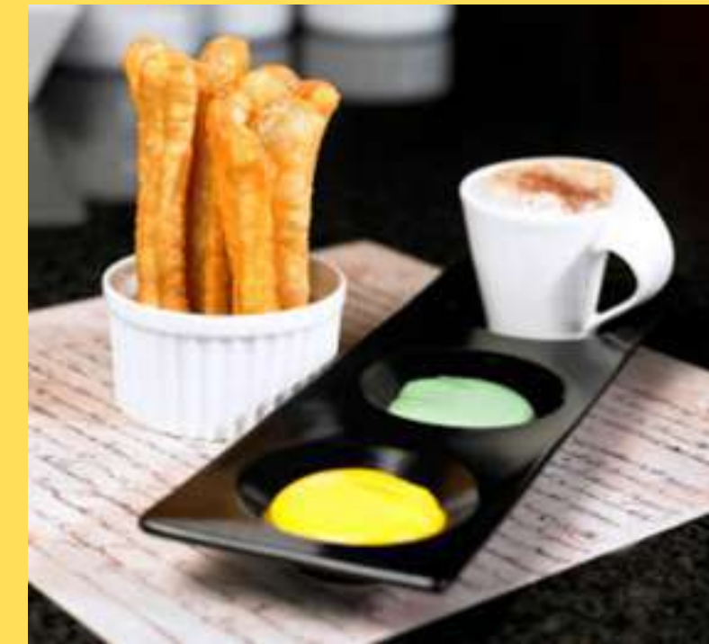
YOU TIAO W/ KAYA MOOSE