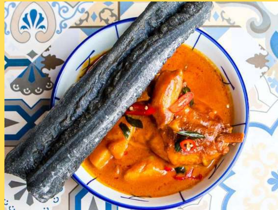
YOU TIAO WITH CHICKEN CURRY