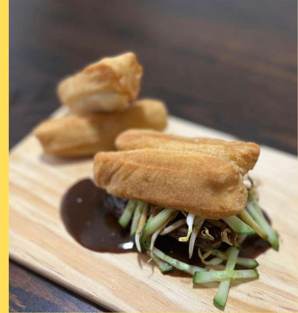
ROJAK SUBMARINE 罗惹油条三文治 (Superfish)