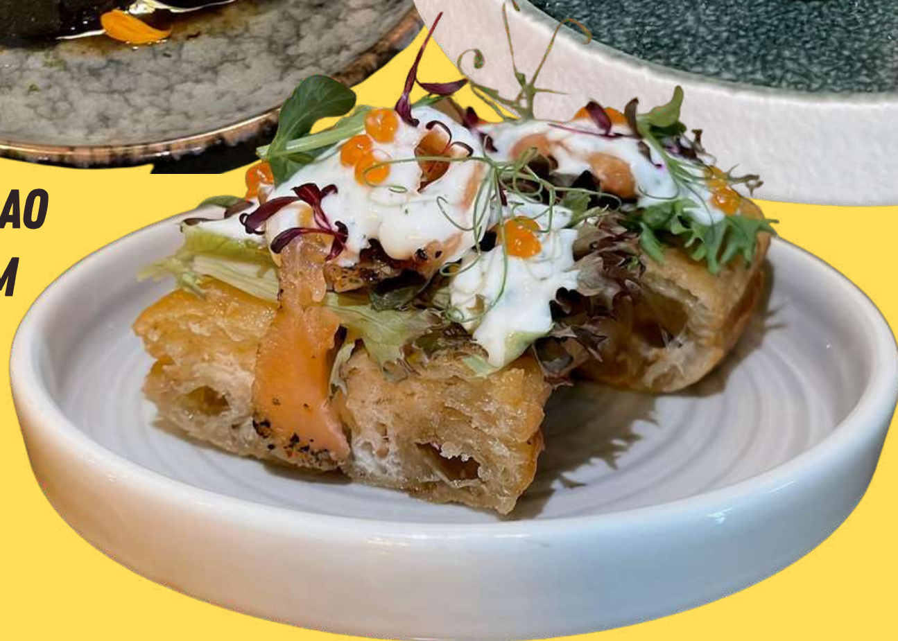
SMOKED SALMON YOU TIAO SLIDER 传统油条加 烟熏三文鱼