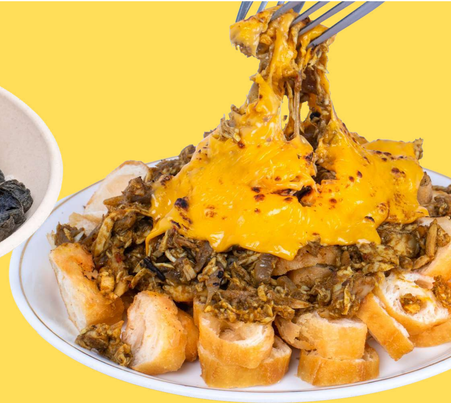
CHEESY CHICKEN RENDANG NACHO W/ YOU TIAO CHIPS