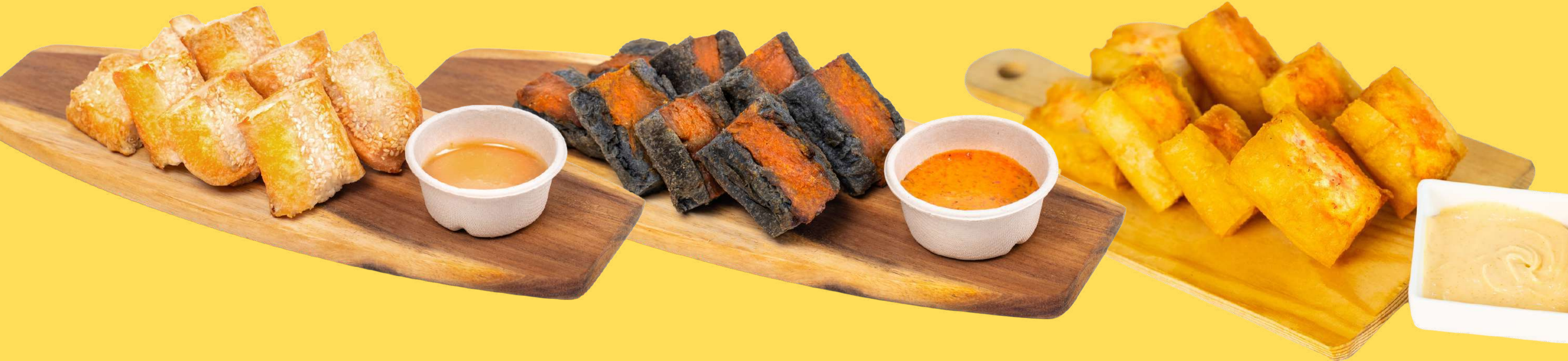
SOTONG YOU TIAO