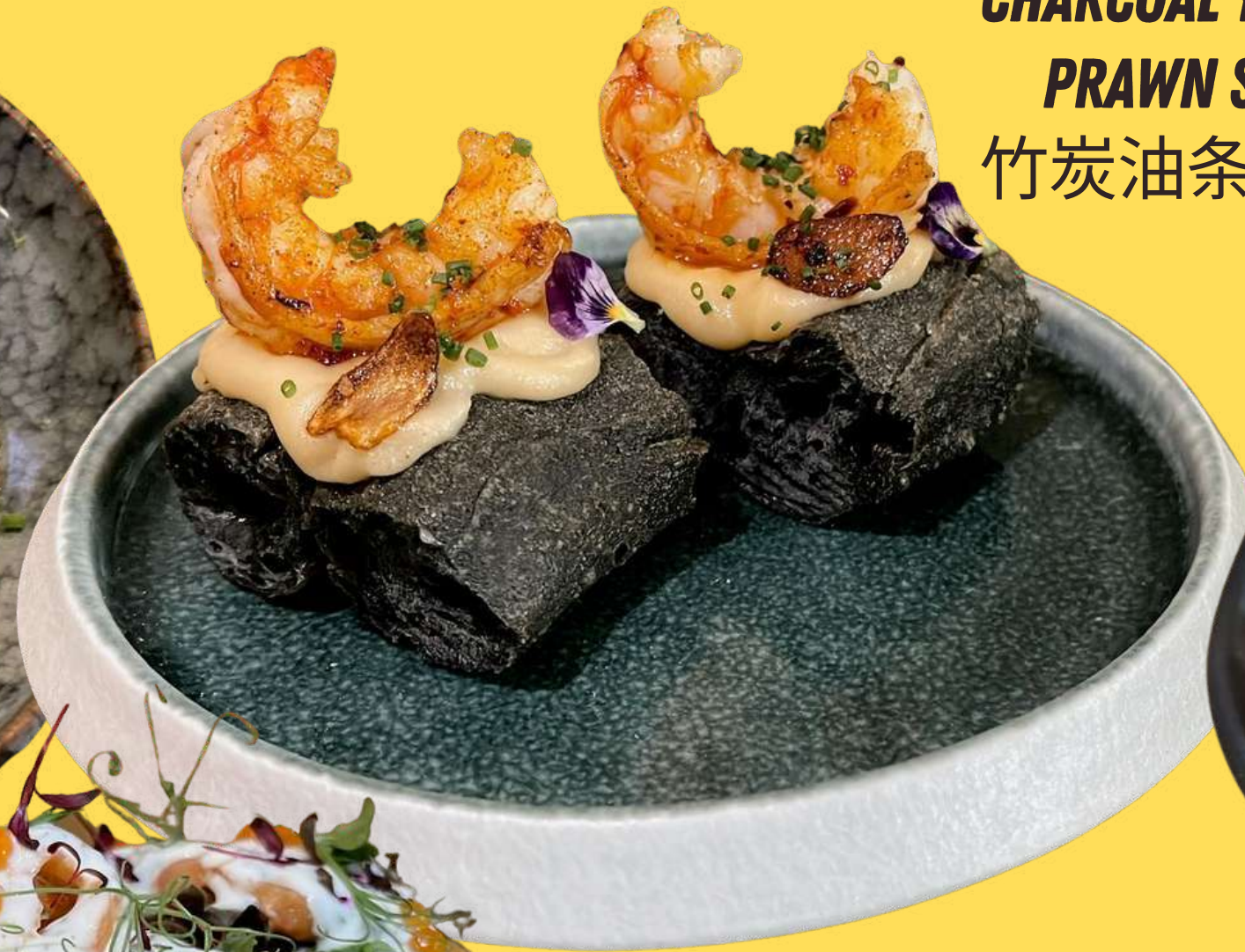
CHARCOAL YOU TIAO PRAWN SLIDER 竹炭油条加烤虾