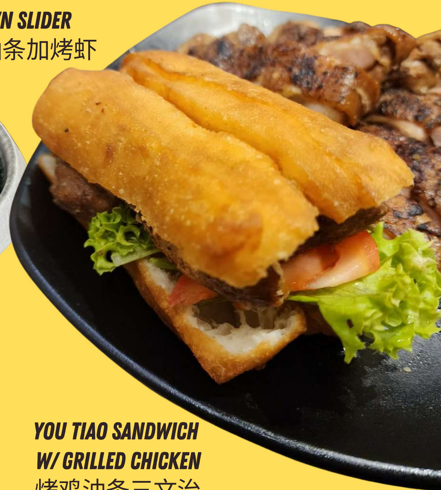
YOU TIAO SANDWICH W/ GRILLED CHICKEN 烤鸡油条三文治