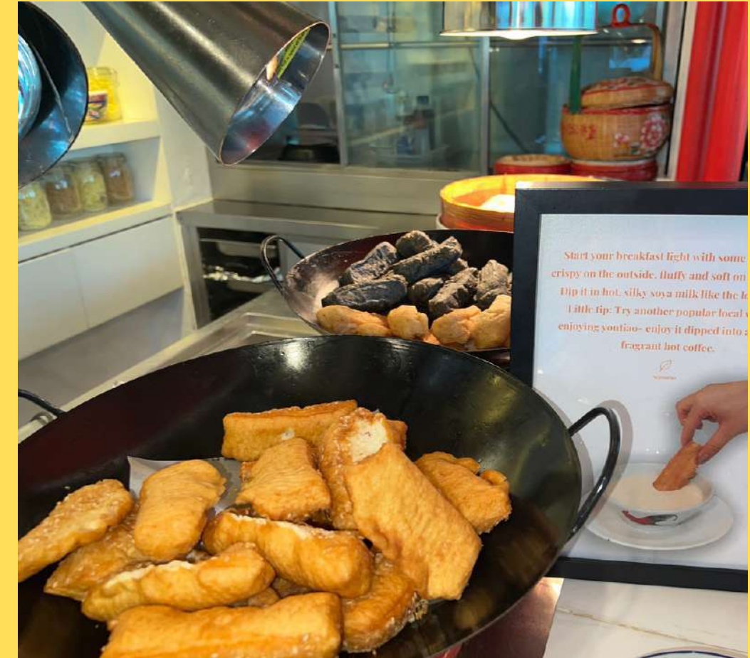
YOU TIAO IN BREAKFAST BUFFET 油条在自助早餐 (Shangri La Hotel)