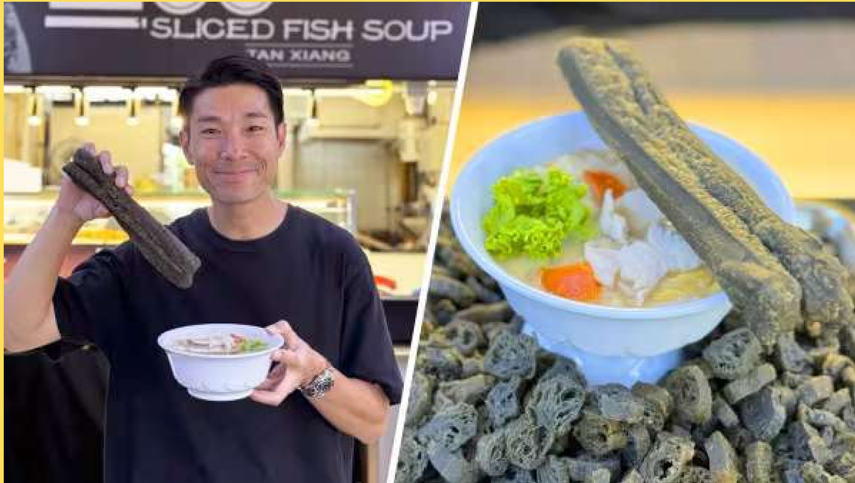
CHARCOAL YOU TIAO WITH FISH SOUP 竹炭油条加鱼汤 (Tan Xiang)