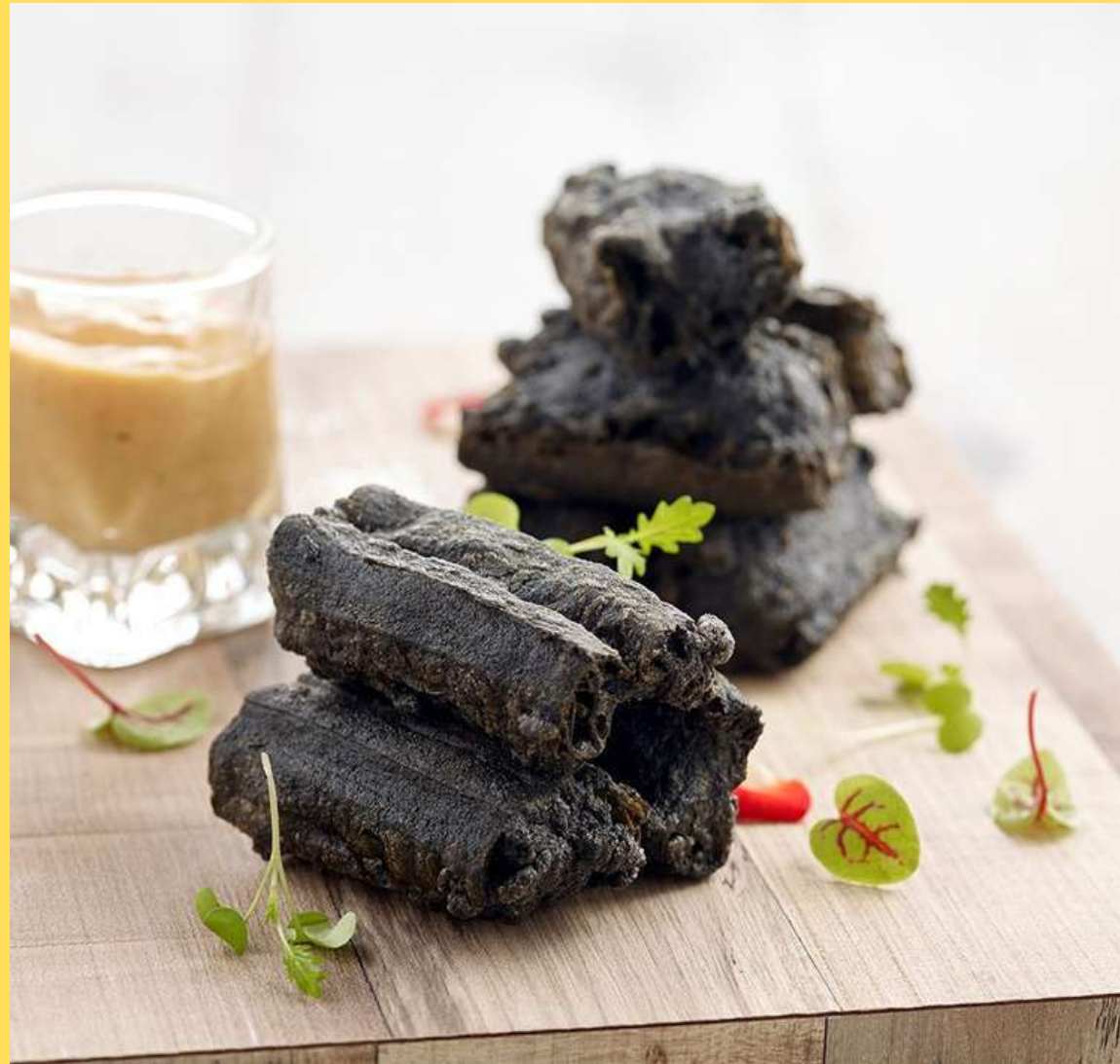
CHARCOAL YOU TIAO STUFFED W/ SQUID 竹炭油条塞墨鱼 (Crystal Jade)