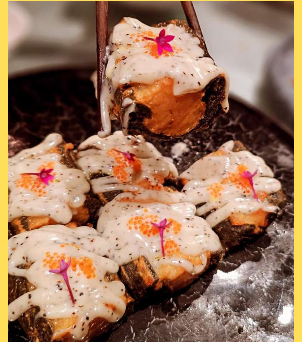
CHARCOAL SHRIMP BITES 虾滑鱼籽竹炭油条 (炭香YUÁN)