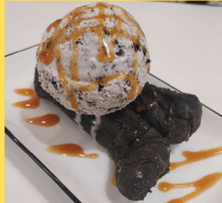
YOU TIAO W/ ICE CREAM