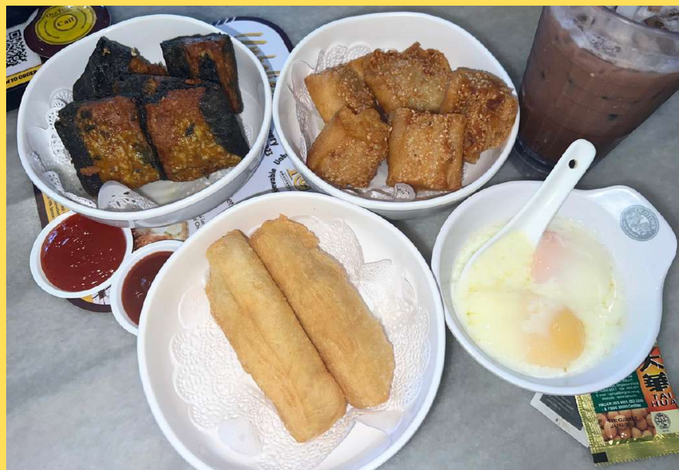
YOU TIAO W/ KAYA 油条早餐套餐 (Old Town Coffee)