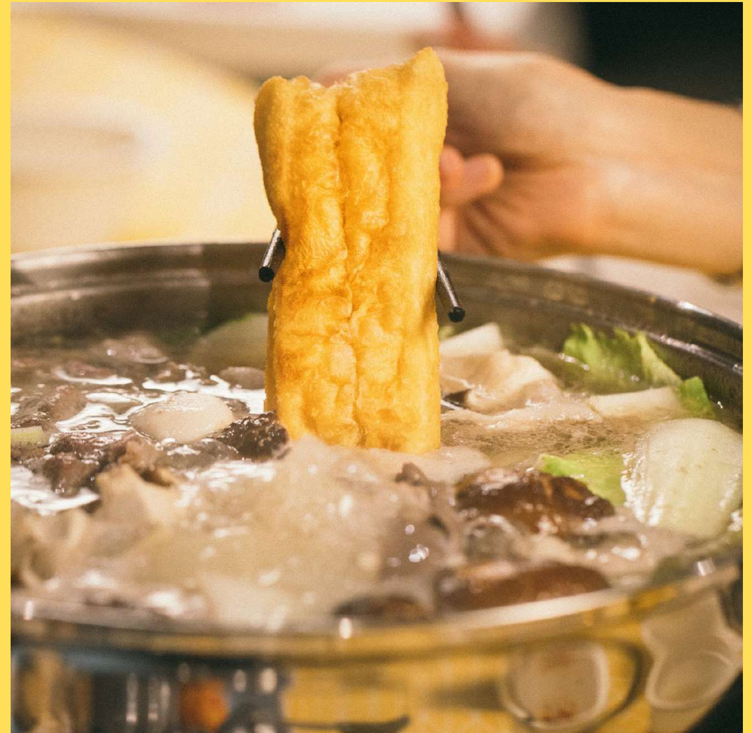
YOU TIAO IN HOTPOT 油条刷火锅 (Shi Li Fang)