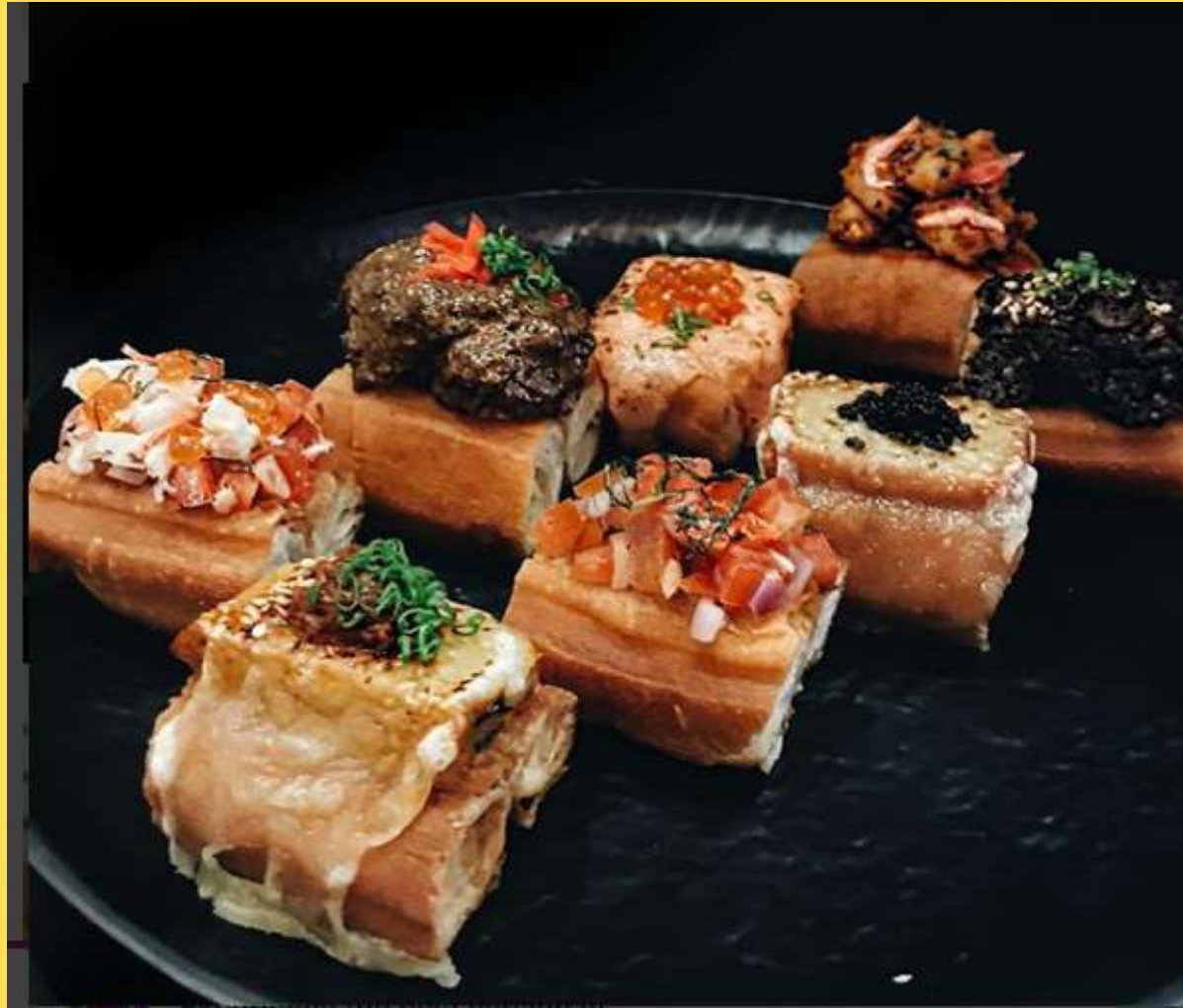
YOU TIAO SUSHI SET 油条寿司