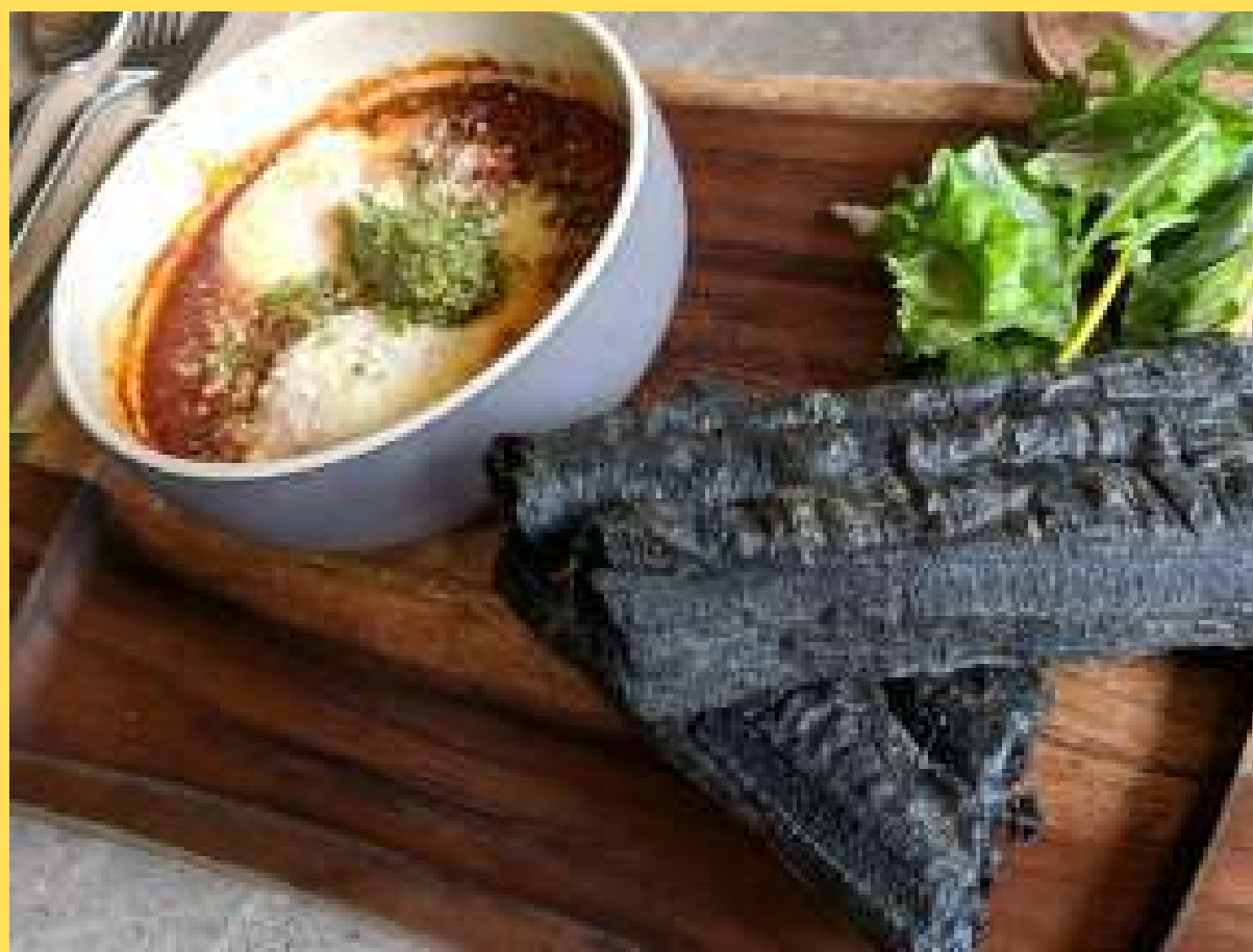
CHARCOAL YOU TIAO W/ BOLOGNESE BAKED EGGS 肉酱烤鸡蛋加竹炭油条 (Open Farm Community)