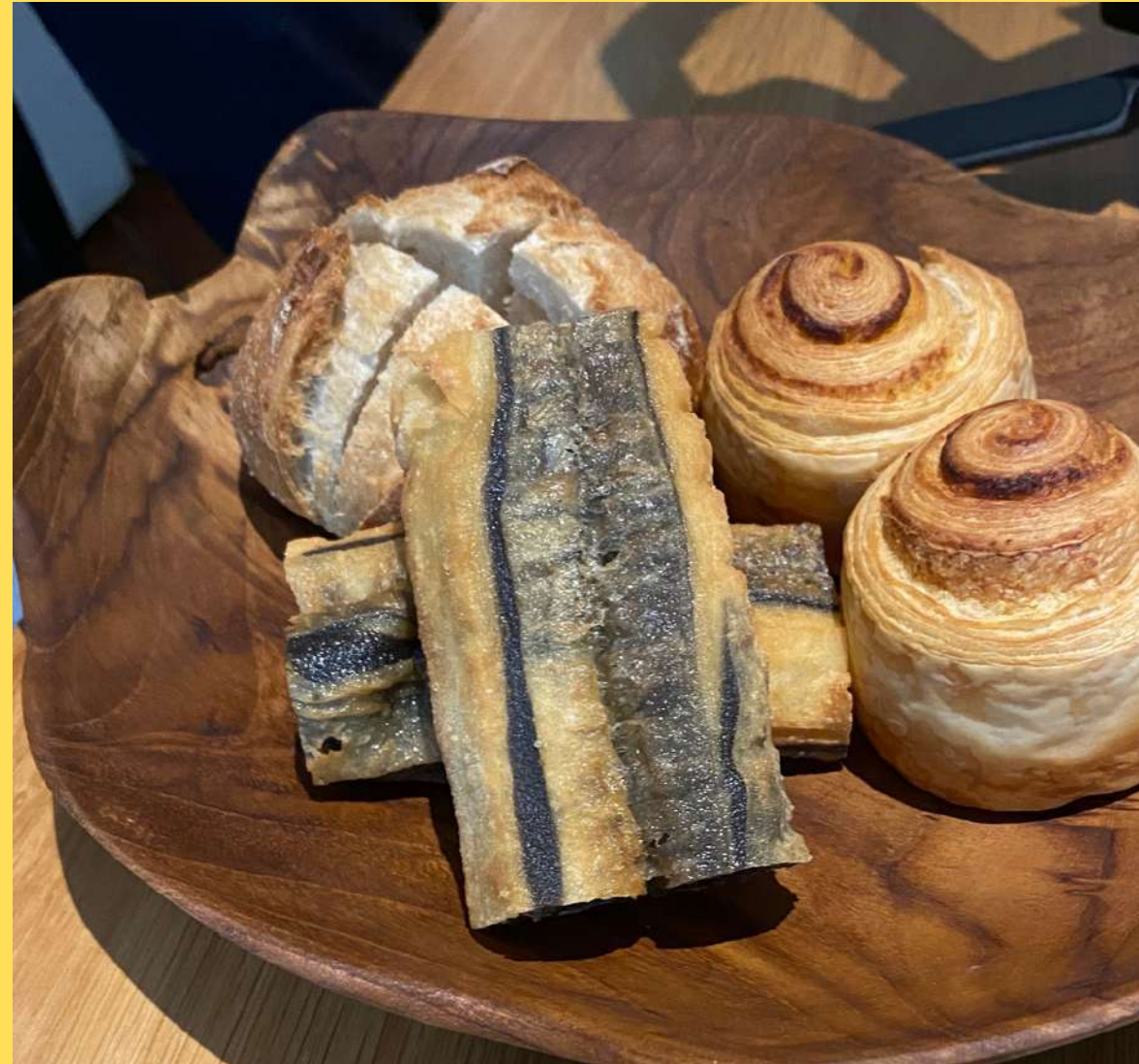
SQUID INK YOU TIAO IN BREAD BASKET