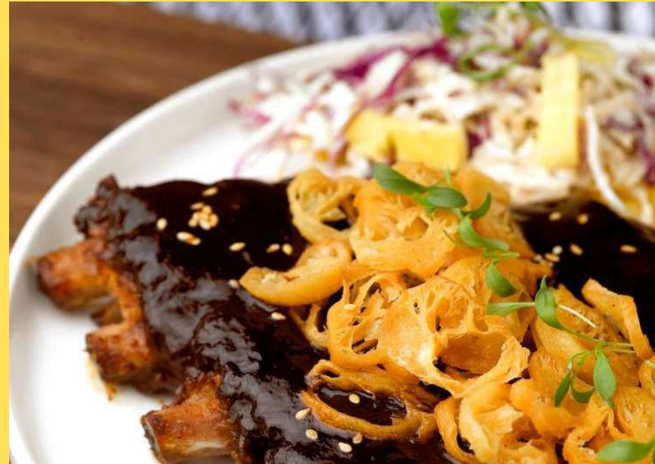
KOPI C FLAVOURED BBQ PORK SPARERIBS