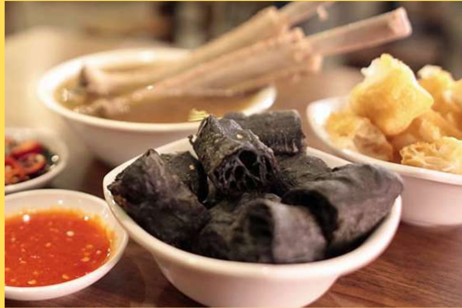
BAK KUT TEH W/ YOU TIAO 油条加肉骨茶 (Founder Bak Kut Teh)