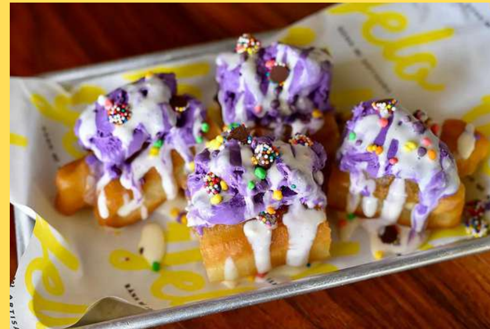
CHEESE FOAM UBE YOU TIAO