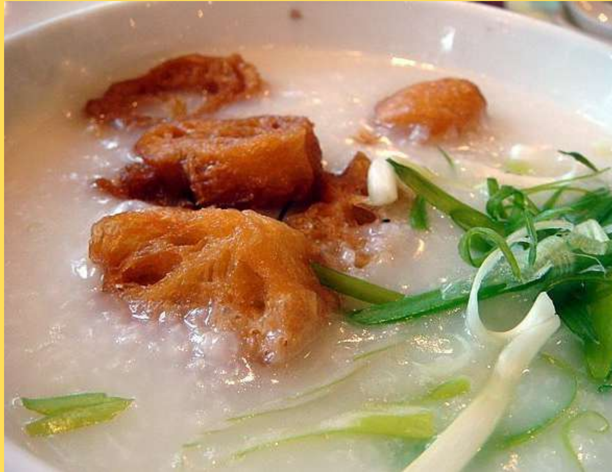
YOU TIAO IN PORRIDGE 油条香脆片粥 (Crystal Jade)