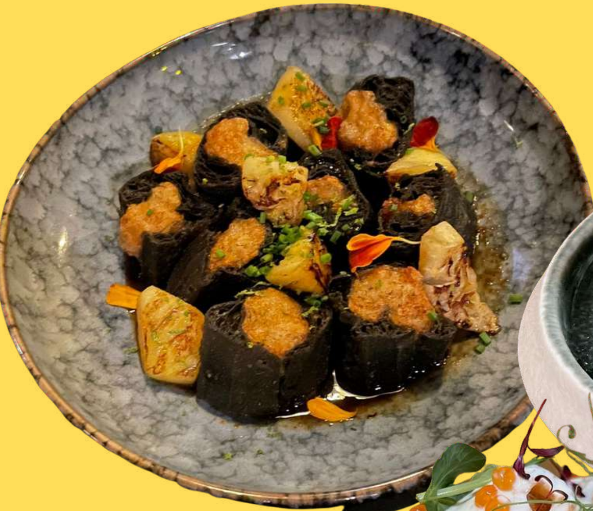
CHARCOAL YOU TIAO W/ ROJAK FOAM 竹炭油条加 罗惹泡沫