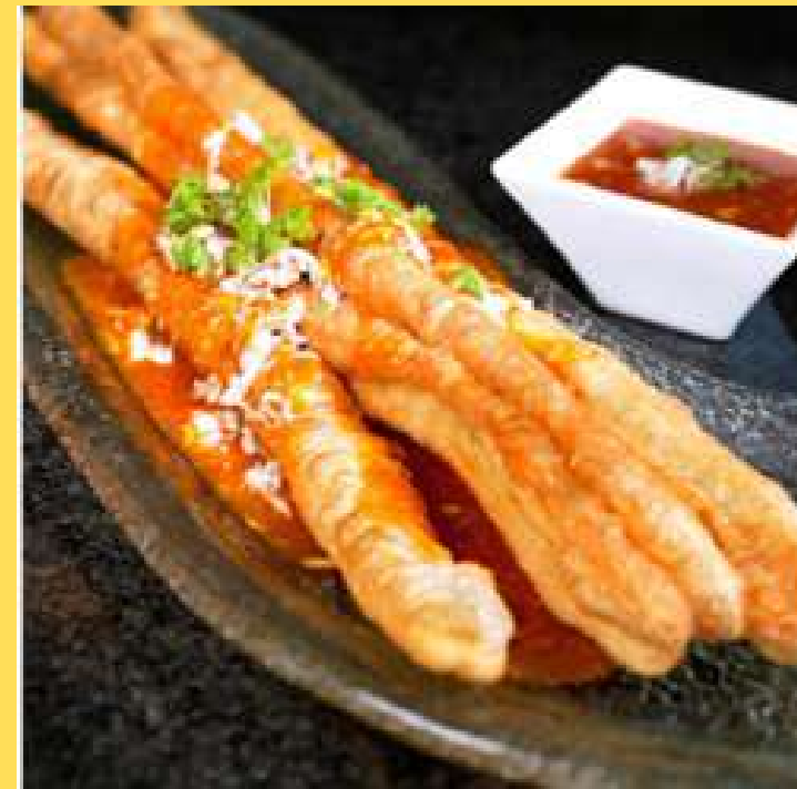
YOU TIAO W/ CHILLI CRAB SAUCE