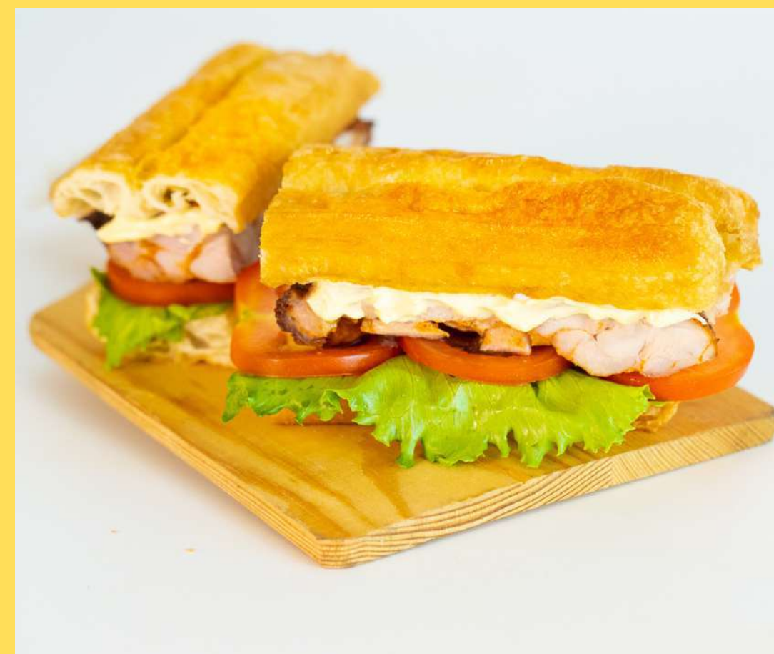
YOU TIAO SANDWICH W/ GRILLED CHICKEN 烤鸡油条三文治