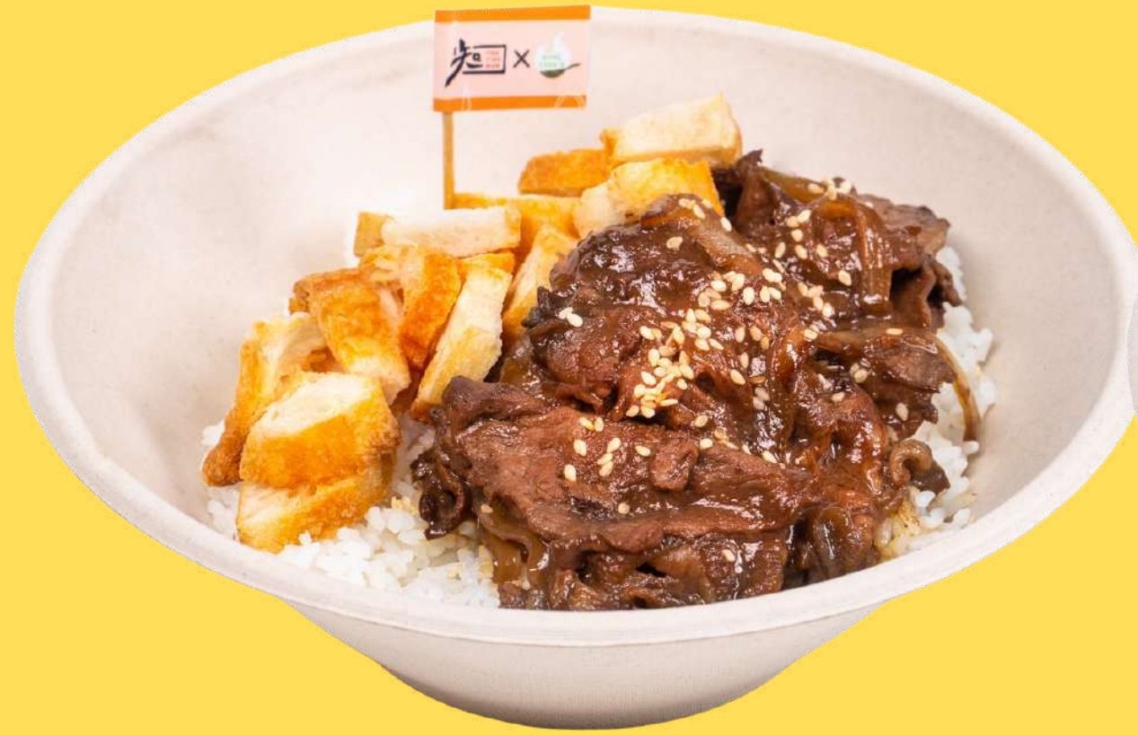
KOPI-C ANGUS BEEF RICE BOWL W/ YOU TIAO CHIPS