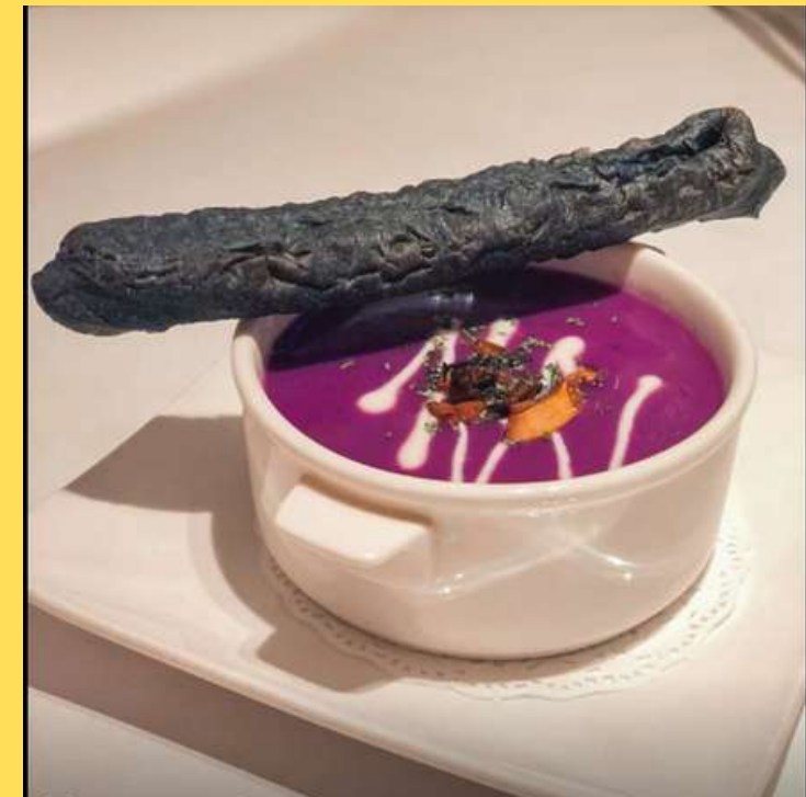
YOU TIAO W/ SWEET POTATO SOUP