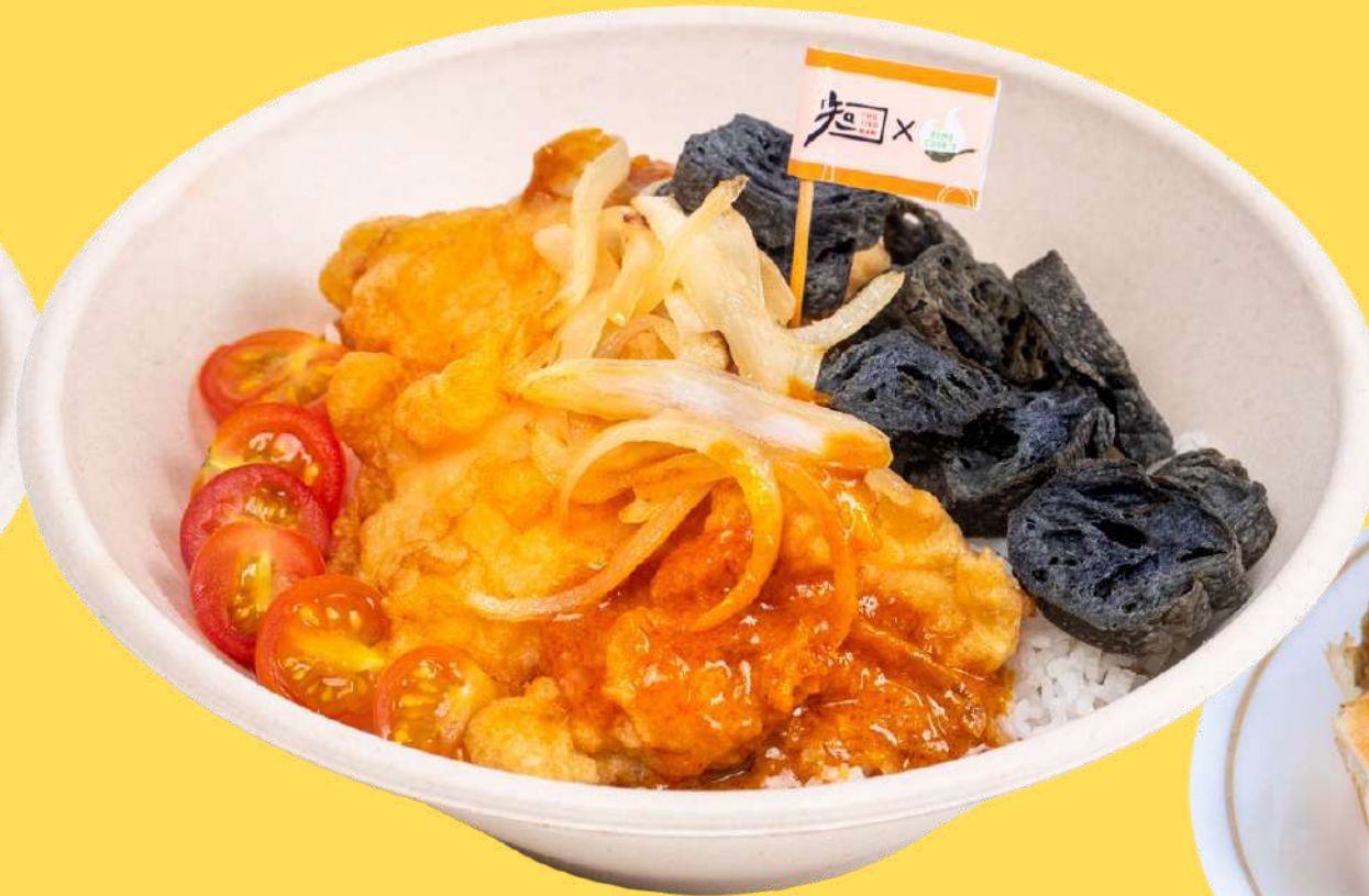
ASSAM CURRY FISH RICE BOWL W/ YOU TIAO CHIPS