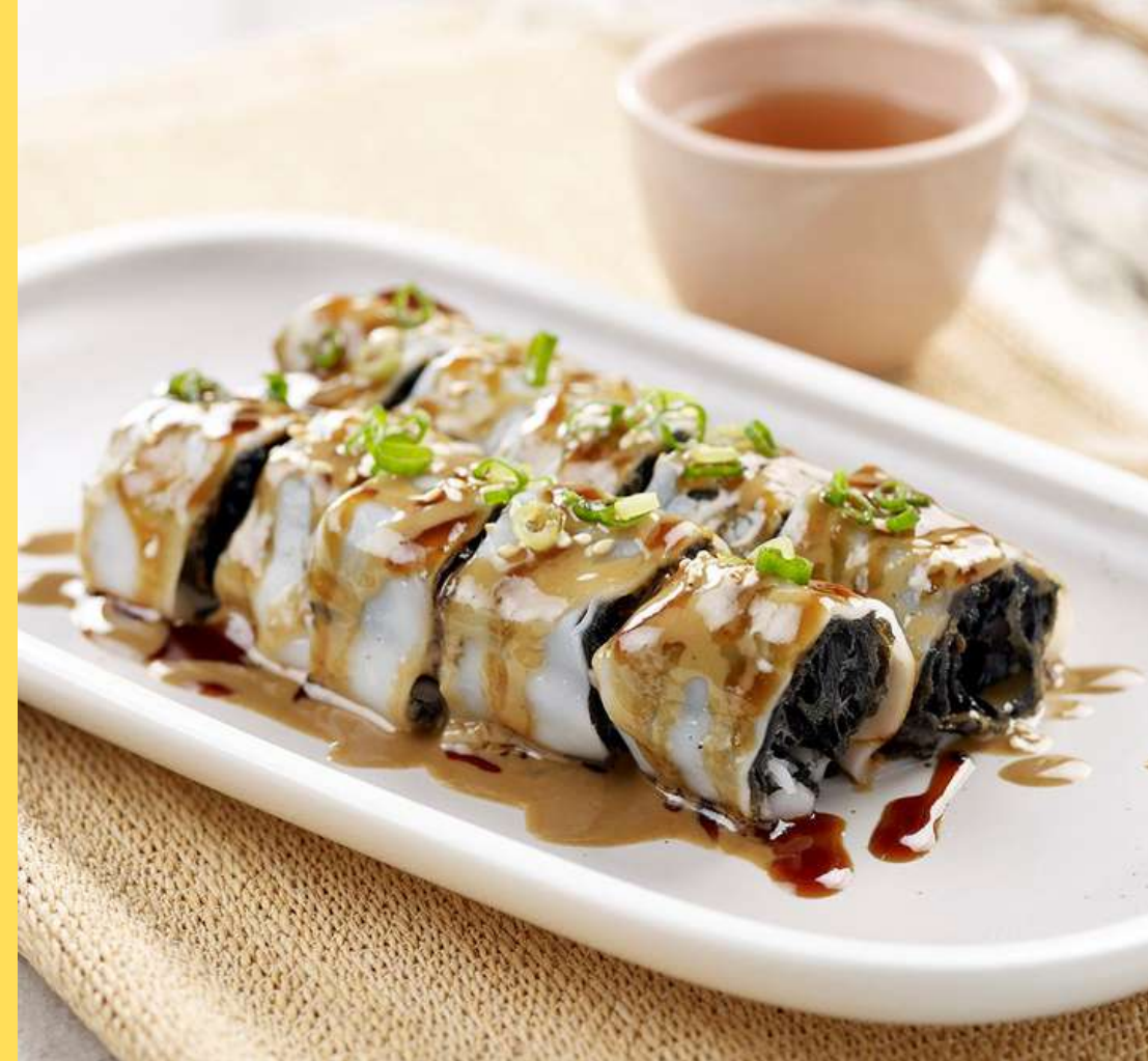
YOU TIAO RICE ROLL 春卷包油条/炸腸 (Crystal Jade)