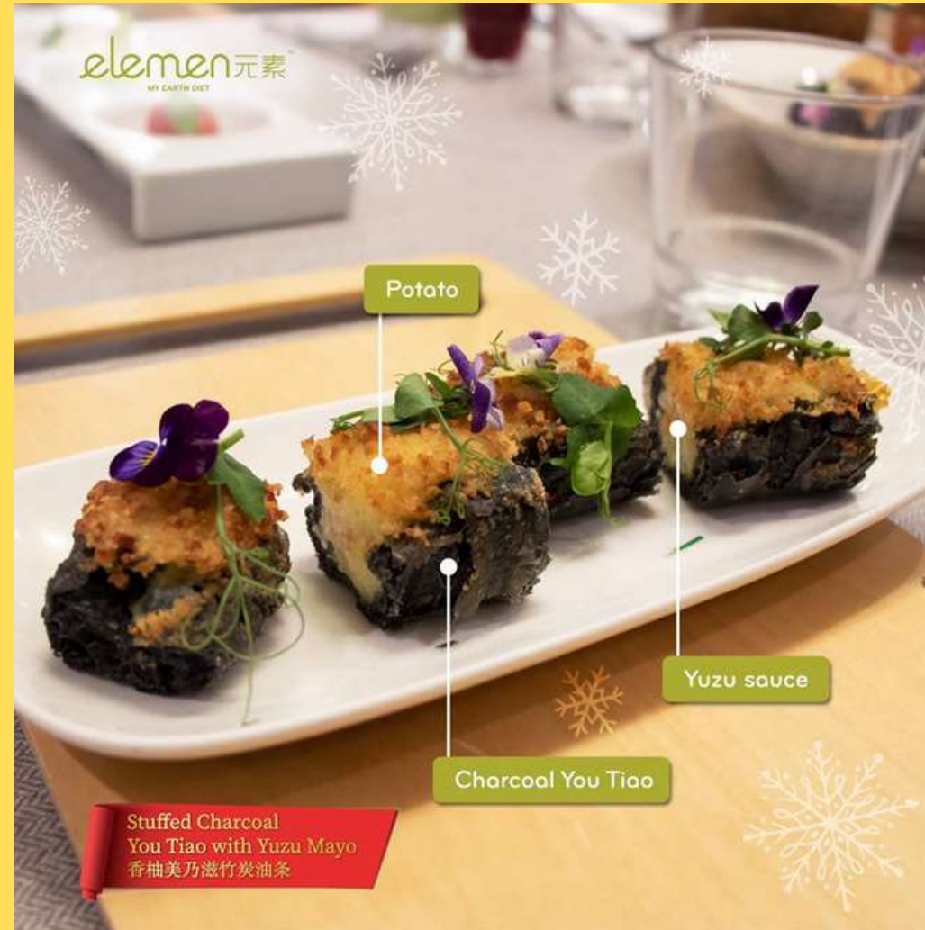
STUFFED CHARCOAL YOU TIAO W/ YUZU MAYO 土豆竹炭油条 (Elemen)