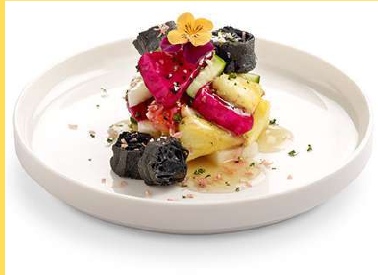
FRUIT ROJAK 水果罗惹 (Elemen)