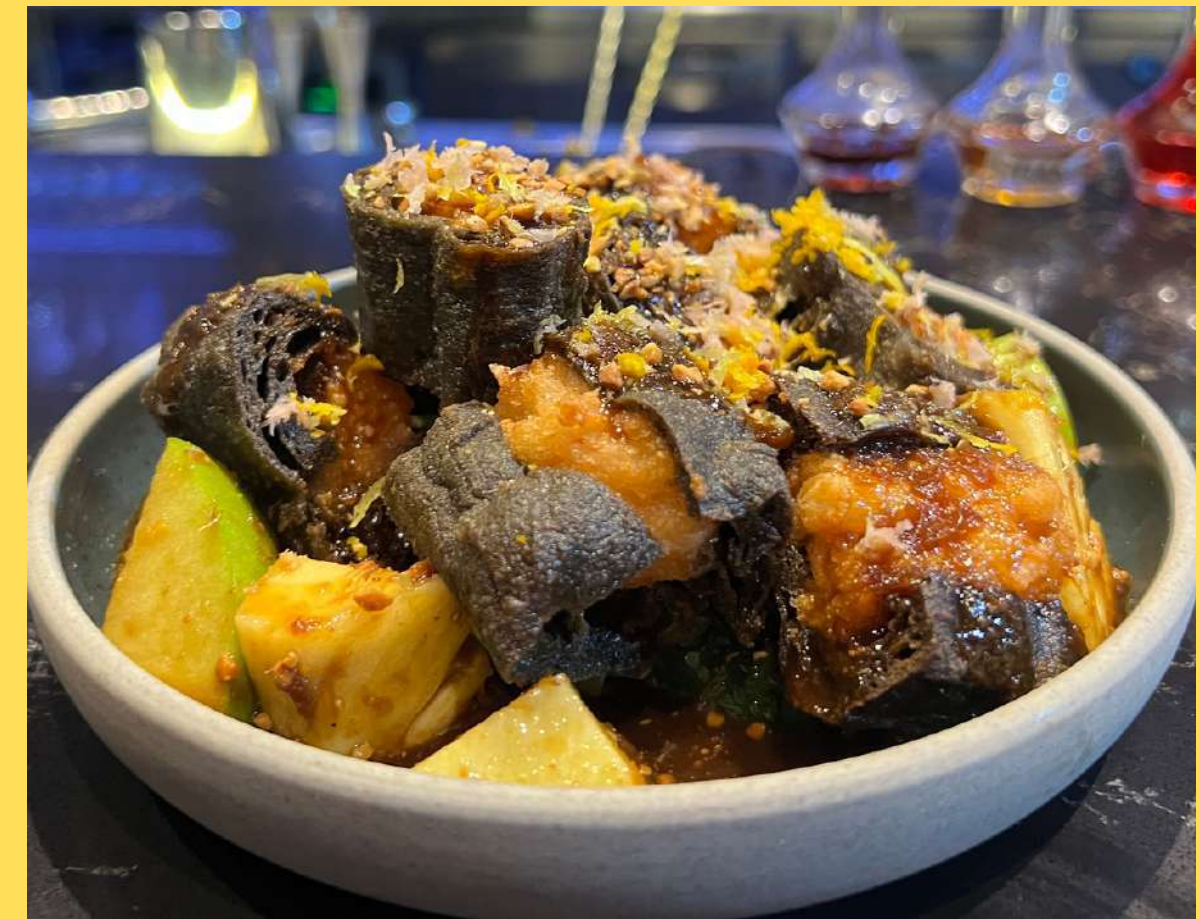
"XIA HUA" CHARCOAL YOU TIAO