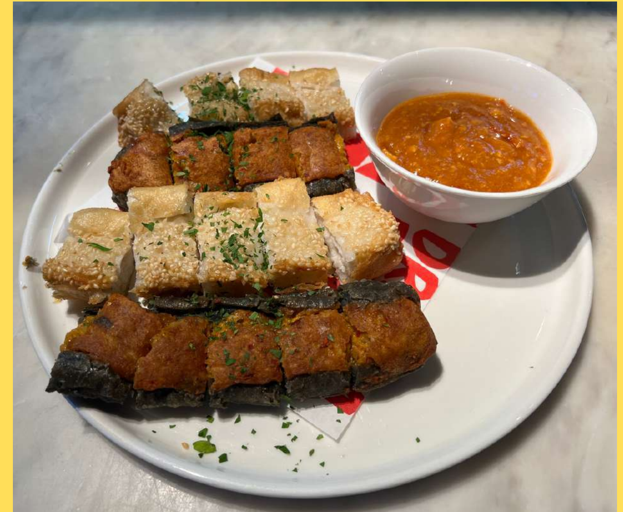
SEAFOOD PLATTER W/ CHILLI CRAB 海鲜油条拼盘 和辣椒螃蟹酱 (Red Tail by Zouk)