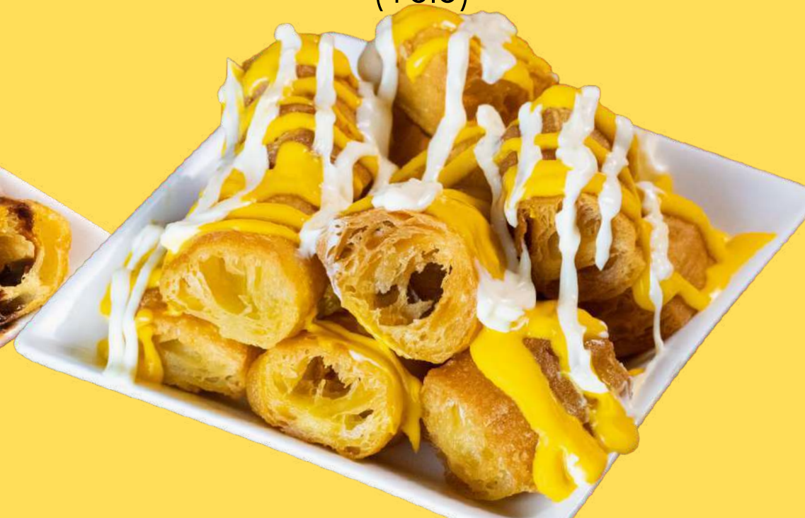
YOU TIAO CHEESE AND MAYO