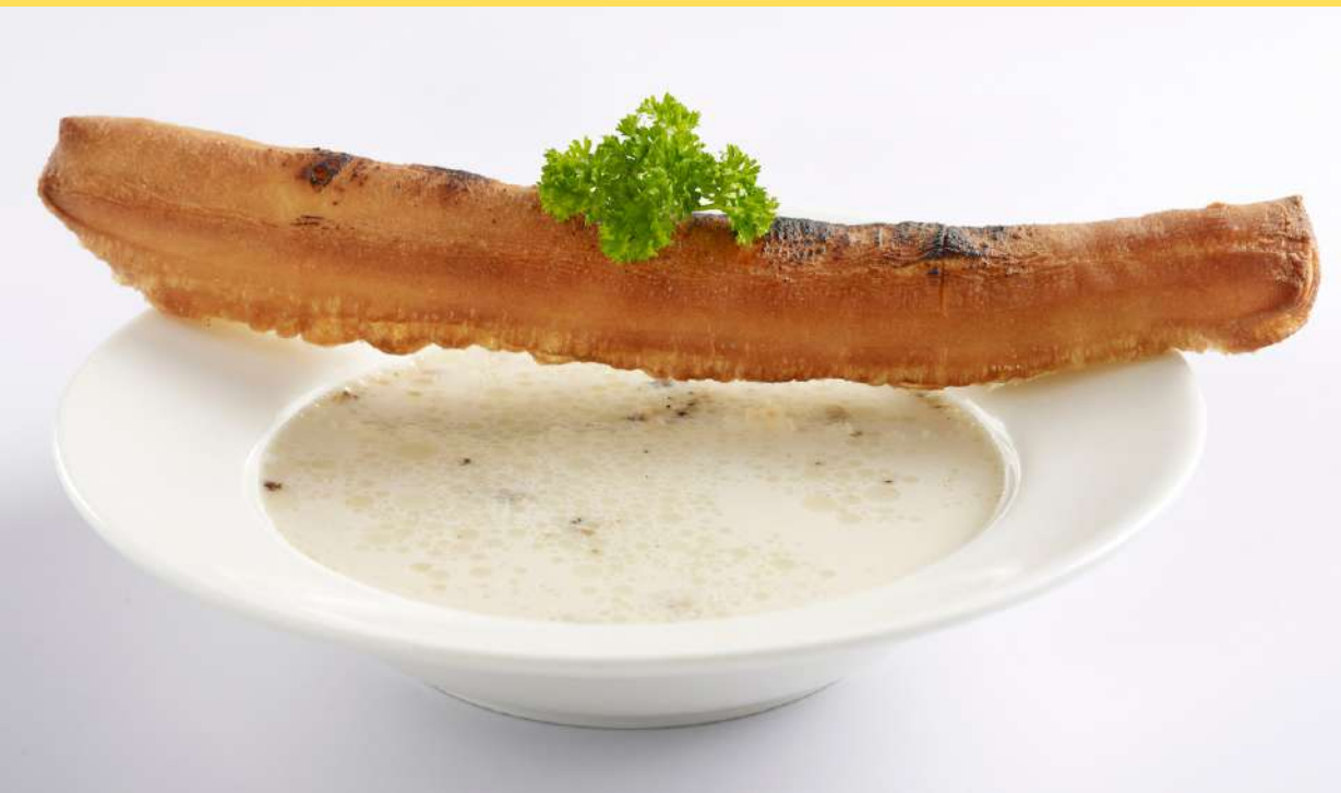
WILD MUSHROOM CREAM SOUP W/ TRUFFLE OIL