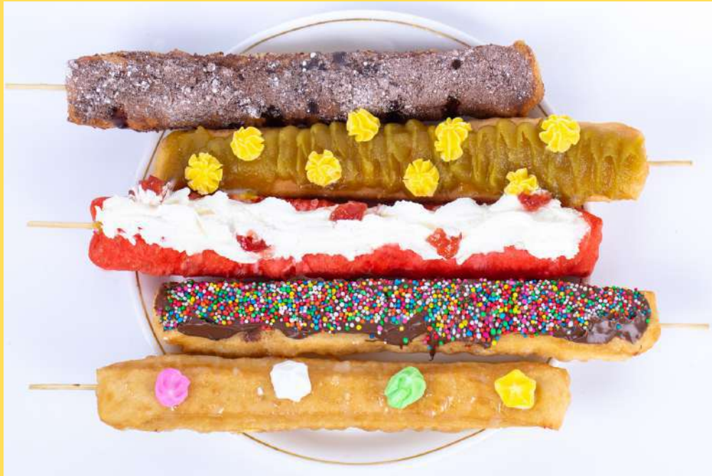
YOU TIAO W/ TOPPINGS