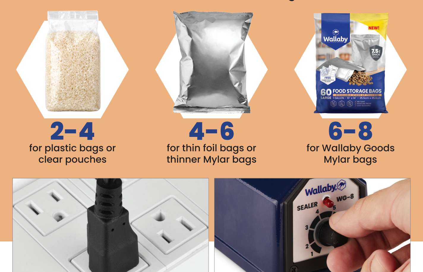
Step 1: Place sealer on a steady surface and plug cord into an outlet.

Set the right temperature according to the thickness of the selected bags