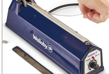
Step 2: Replace a new heat seal strip and heating element