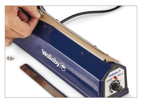
Step 1: Use tools to loosen the screws and remove the cover and cloth