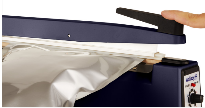
Step 2: Set your dial. The numbers on the dial correlate with the thickness of the material.

Step 4: Once the bag is in the correct position, press the handle down firmly. The light will stay on for a few seconds. Keep holding down until the light goes off.