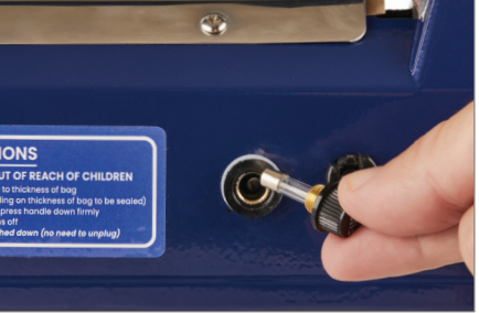
Step 2: Pull out the blown fuse