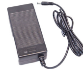
F ZAEL 21V/2.5A Charger