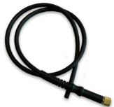
X CRAGZ 5' Reinforced Black Hose