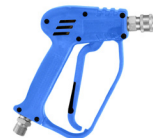
X CRAGY Stainless-Steel Spray Gun