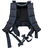
F ZAAGE ComfortStraps™