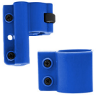
X CRAHA Top & Bottom Holster