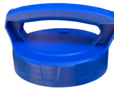
X CRAGV Tank Lid