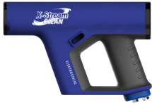
XCAAHT Electrostatic Spray Gun