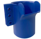
XCRALP Gun Holster Kit