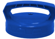
XCRAJL Tank Lid