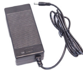
FZAAEL 21V/2.5Ah Battery Charger