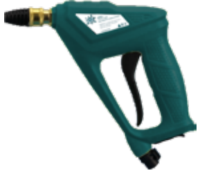
1. SMRACY 3.6V/2.6A Spray Gun

Visit buyspraymate.com to view and purchase parts.