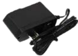
4. FZRABJ 3.6V/1A Charger