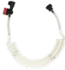
2. FZRABE 6-Foot Coiled Hose