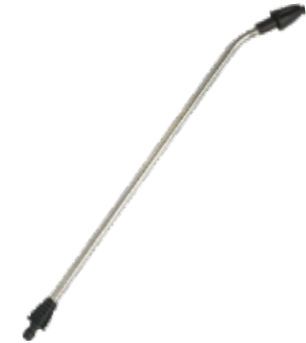
6. FZRABS 18-Inch Stainless Steel Extension Wand