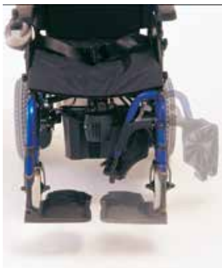
The swing in / out legrests ease transfers in and out of the chair.