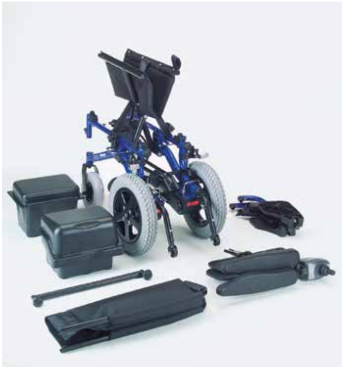
The Mirage fits into a car boot when folded for transport.