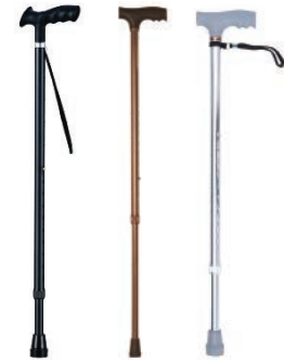
Walking Stick (Adjustable)

EF-5048 Blue EF-5050 Brown EF-5134 Silver