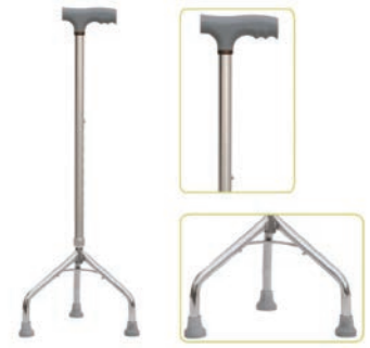
WALKING STICK 3 LEGS 926