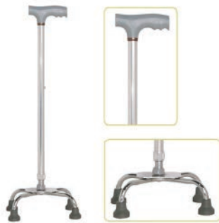
WALKING STICK 3 LEGS 924