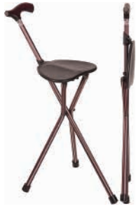
Walking Stick w/ Seat 9402