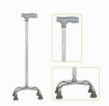
WALKING STICK 3 LEGS 924