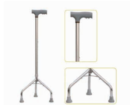
WALKING STICK 3 LEGS 926