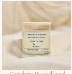
Sombre Woodland White Cedar | Pine | Lemon Rind