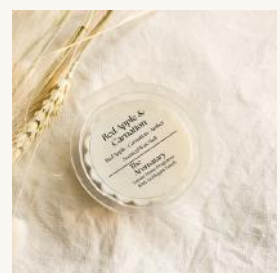
Red Apple & Carnation Red Apple | Carnation | Amber