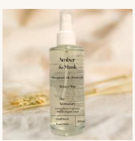
Amber & Musk Bergamot | Lily | Patchouli