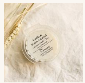
Vanilla & Warm Caramel Caramel | Clove | Vanilla