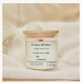
Pomme d'Ambre Nutmeg | Ylang | Woods