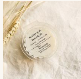
Sea Spray & Botanicals Rosemary | Geranium | Cedar