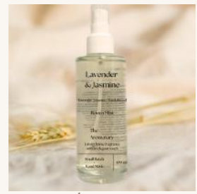
Lavender & Jasmine Lavender | Jasmine | Sandalwood