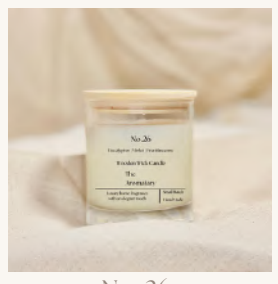
No. 26 Eucalyptus | Sandalwood | Frankincense