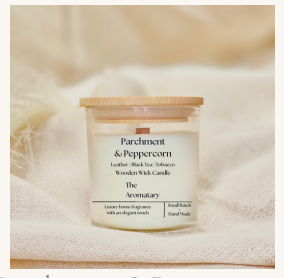
Parchment & Peppercorn Leather | Black Tea | Tobacco