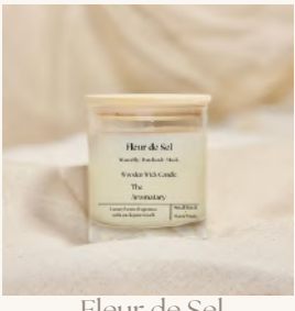
Fleur de Sel Waterlily | Patchouli | Musk