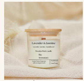
Lavender & Jasmine Lavender | Jasmine | Sandalwood