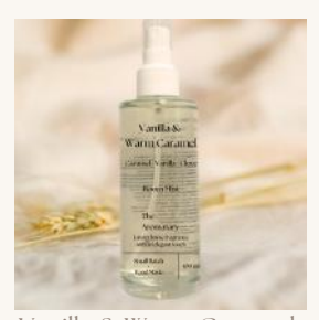
Vanilla & Warm Caramel Caramel | Clove | Vanilla