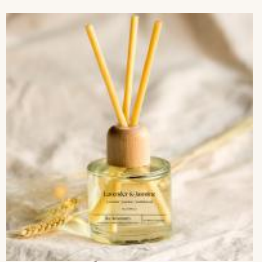
Lavender & Jasmine Lavender | Jasmine | Sandalwood | Eucalyptus | Sandalwood |