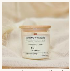
Sombre Woodland White Cedar | Pine | Lemon Rind