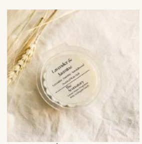
Lavender & Jasmine Lavender | Jasmine | Sandalwood