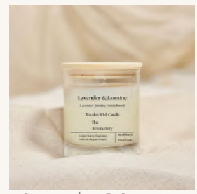
Lavender & Jasmine Lavender | Jasmine | Sandalwood