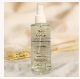
Soft Cotton Musk | Eucalyptus | Jasmine