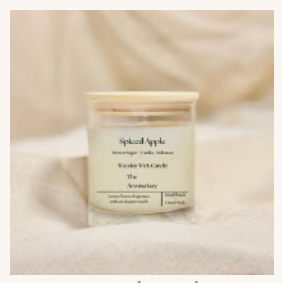
Spiced Apple Brown Sugar | Vanilla | Sultanas