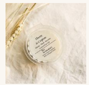
Ebony & Cognac Ebony | Musk | Incense