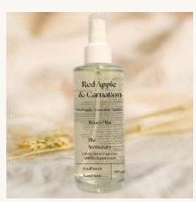
Red Apple & Carnation Red Apple | Carnation | Amber