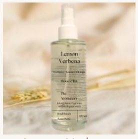
Lemon Verbena Verbena | Lemon | Orange