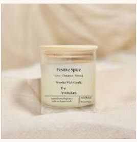
Festive Spice Clove | Cinnamon | Nutmeg