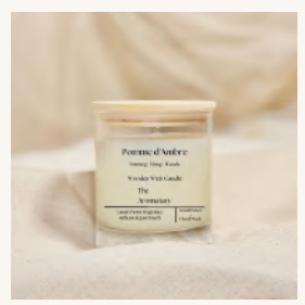
Pomme d'Ambre Nutmeg | Ylang | Woods