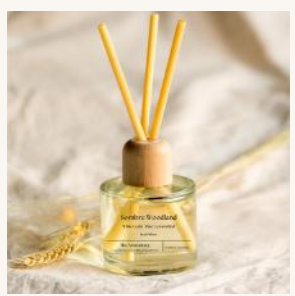
Sombre Woodland White Cedar | Pine | Lemon Rind