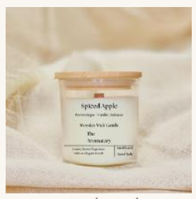
Spiced Apple Brown Sugar | Vanilla | Sultanas