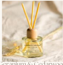
Geranium & Cedarwood Jasmine | Geranium | Cedar