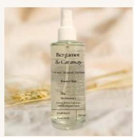
Bergamot & Caraway Caraway | Bergamot | Patchouli