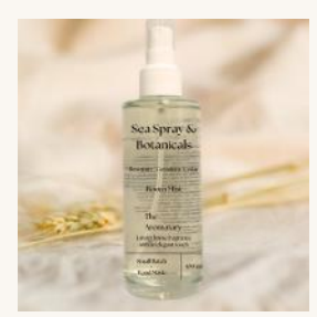
Sea Spray & Botanicals Rosemary | Geranium | Cedar