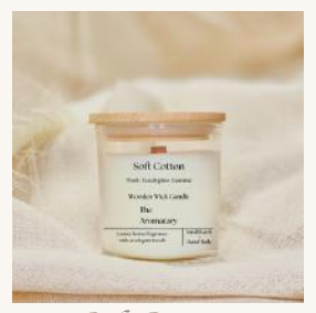
Soft Cotton Musk | Eucalyptus | Jasmine