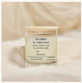
Geranium & Cedarwood Jasmine | Geranium | Cedar