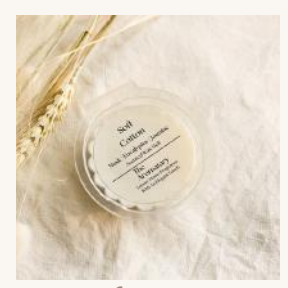
Soft Cotton Musk | Eucalyptus | Jasmine