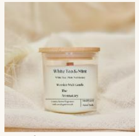
White Tea & Mint White Tea | Mint | Vervienne