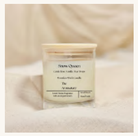
Snow Queen Candy Floss | Vanilla | Pear Drops