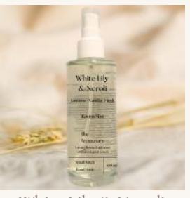
White Lily & Neroli Jasmine | Vanilla | Musk