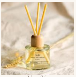
No. 26 Frankincense