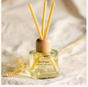
Spiced Apple Brown Sugar | Vanilla | Sultanas