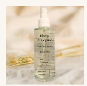
Ebony & Cognac Ebony | Musk | Incense