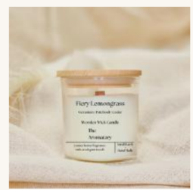
Fiery Lemongrass Geranium | Patchouli | Cedar