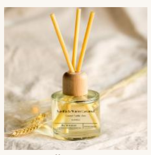
Vanilla & Warm Caramel Caramel | Clove | Vanilla