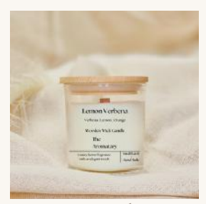
Lemon Verbena Verbena | Lemon | Orange