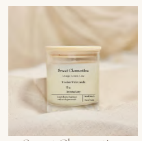
Sweet Clementine Orange | Lemon | Lime