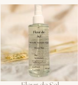
Fleur de Sel Waterlily | Patchouli | Musk