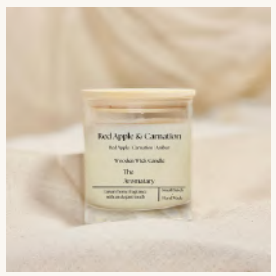
Red Apple & Carnation Red Apple | Carnation | Amber