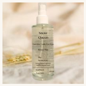
Snow Queen Candy Floss | Vanilla | Pear Drops