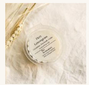
Fiery Lemongrass Geranium | Patchouli | Cedar