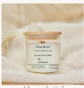
Fleur de Sel Waterlily | Patchouli | Musk