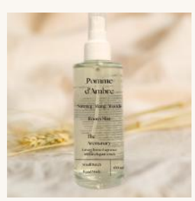
Pomme d'Ambre Nutmeg | Ylang | Woods