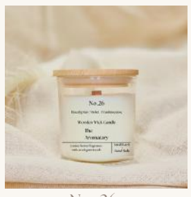
No. 26 Eucalyptus | Sandalwood | Frankincense