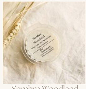
Sombre Woodland White Cedar | Pine | Lemon Rind