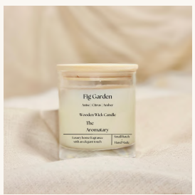
Fig Garden Anise | Citrus | Amber