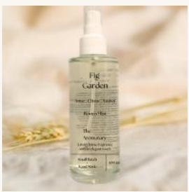
Fig Garden Anise | Citrus | Amber