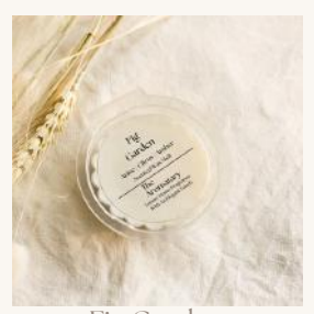
Fig Garden Anise | Citrus | Amber