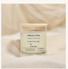
Amber & Musk Bergamot | Lily | Patchouli