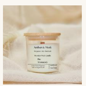
Amber & Musk Bergamot | Lily | Patchouli