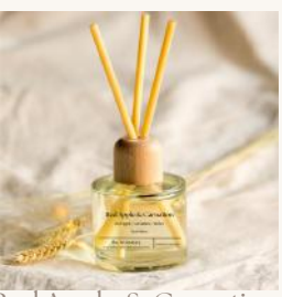
Red Apple & Carnation Red Apple | Carnation | Amber