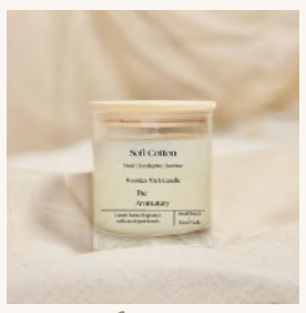
Soft Cotton Musk | Eucalyptus | Jasmine