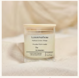
Lemon Verbena Verbena | Lemon | Orange