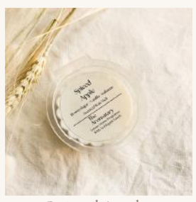
Spiced Apple Brown Sugar | Vanilla | Sultanas