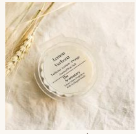
Lemon Verbena Verbena | Lemon | Orange