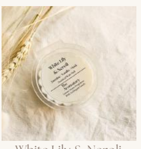
White Lily & Neroli Jasmine | Vanilla | Musk