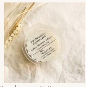
Parchment & Peppercorn Leather | Black Tea | Tobacco