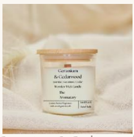
Geranium & Cedarwood Jasmine | Geranium | Cedar