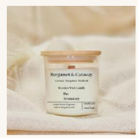
Bergamot & Caraway Caraway | Bergamot | Patchouli