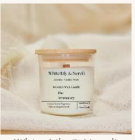
White Lily & Neroli Jasmine | Vanilla | Musk