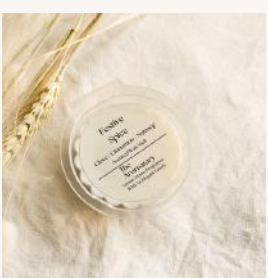
Festive Spice Clove | Cinnamon | Nutmeg