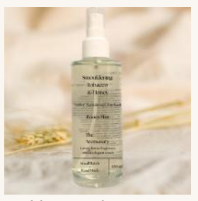
Smouldering Tobacco & Honey Amber | Sandalwood | Patchouli