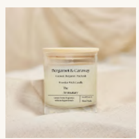
Bergamot & Caraway Caraway | Bergamot | Patchouli