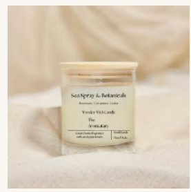
Sea Spray & Botanicals Rosemary | Geranium | Cedar