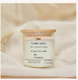
Festive Spice Clove | Cinnamon | Nutmeg