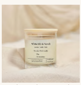
White Lily & Neroli Jasmine | Vanilla | Musk