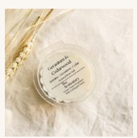
Geranium & Cedarwood Jasmine | Geranium | Cedar