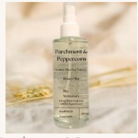
Parchment & Peppercorn Leather | Black Tea | Tobacco