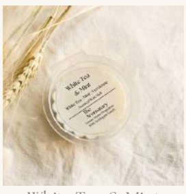
White Tea & Mint White Tea | Mint | Vervienne