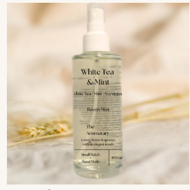
White Tea & Mint White Tea | Mint | Vervienne