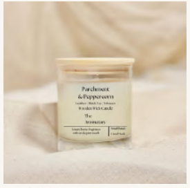
Parchment & Peppercorn Leather | Black Tea | Tobacco