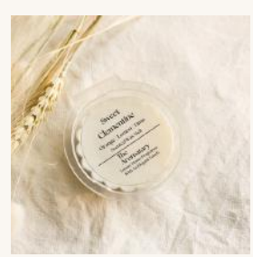
Sweet Clementine Orange | Lemon | Lime