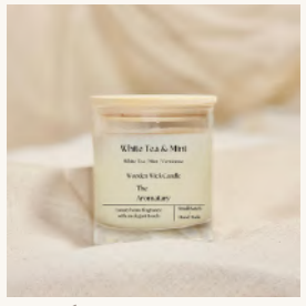
White Tea & Mint White Tea | Mint | Vervienne