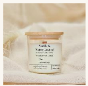
Vanilla & Warm Caramel Caramel | Clove | Vanilla