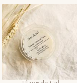
Fleur de Sel Waterlily | Patchouli | Musk