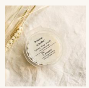
Pomme d'Ambre Nutmeg | Ylang | Woods