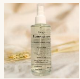
Fiery Lemongrass Geranium | Patchouli | Cedar