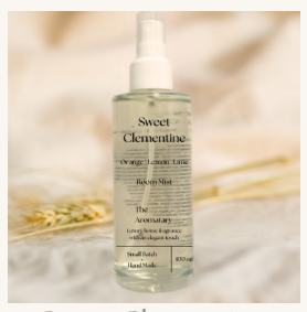
Sweet Clementine Orange | Lemon | Lime