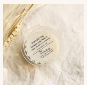
Smouldering Tobacco & Honey Amber | Sandalwood | Patchouli