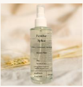
Festive Spice Clove | Cinnamon | Nutmeg