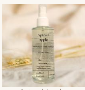
Spiced Apple Brown Sugar | Vanilla | Sultanas