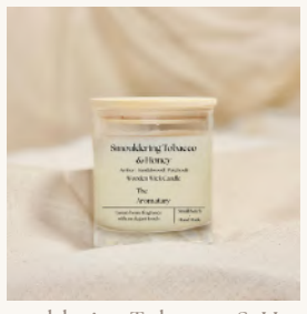
Smouldering Tobacco & Honey Amber | Sandalwood | Patchouli