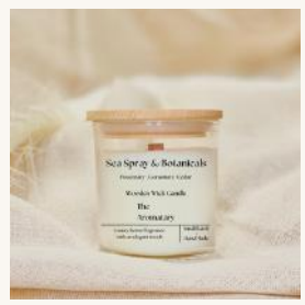
Red Apple & Carnation Red Apple | Carnation | Amber