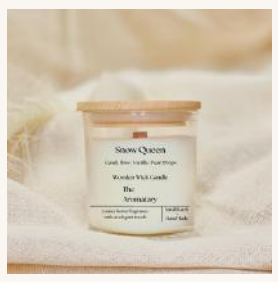
Snow Queen Candy Floss | Vanilla | Pear Drops