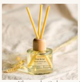
Fleur de Sel Waterlily | Patchouli | Musk