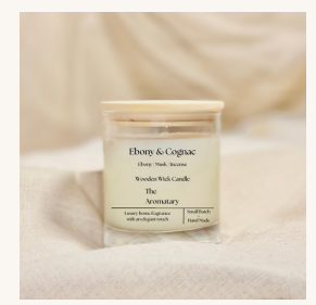
Ebony & Cognac Ebony | Musk | Incense