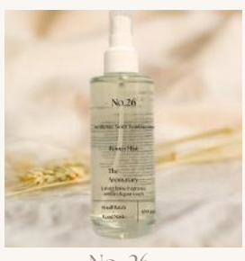
No. 26 Eucalyptus | Sandalwood | Frankincense