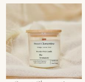
Sweet Clementine Orange | Lemon | Lime