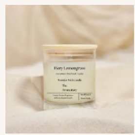
Fiery Lemongrass Geranium | Patchouli | Cedar