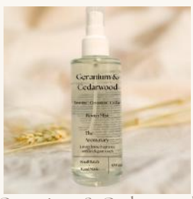
Geranium & Cedarwood Jasmine | Geranium | Cedar