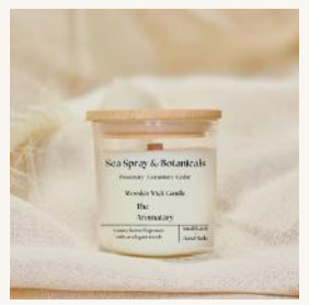
Sea Spray & Botanicals Rosemary | Geranium | Cedar