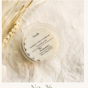
No. 26 Eucalyptus | Sandalwood | Frankincense