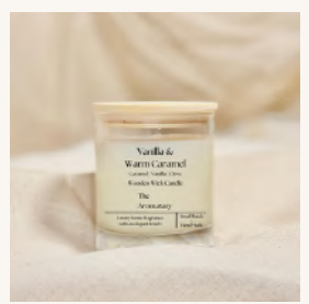
Vanilla & Warm Caramel Caramel | Clove | Vanilla