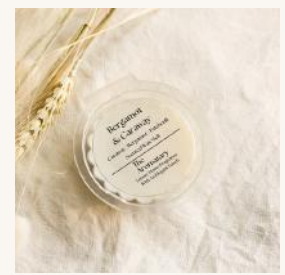
Bergamot & Caraway Caraway | Bergamot | Patchouli