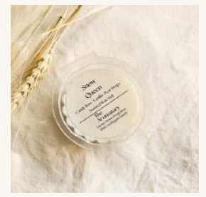
Snow Queen Candy Floss | Vanilla | Pear Drops