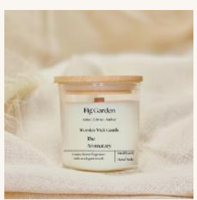
Fig Garden Anise | Citrus | Amber