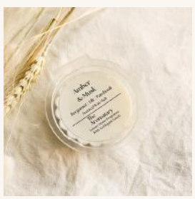
Amber & Musk Bergamot | Lily | Patchouli