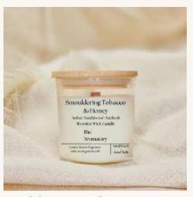
Smouldering Tobacco & Honey Amber | Sandalwood | Patchouli