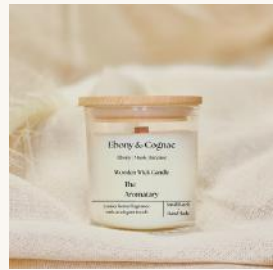
Ebony & Cognac Ebony | Musk | Incense