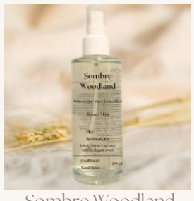
Sombre Woodland White Cedar | Pine | Lemon Rind