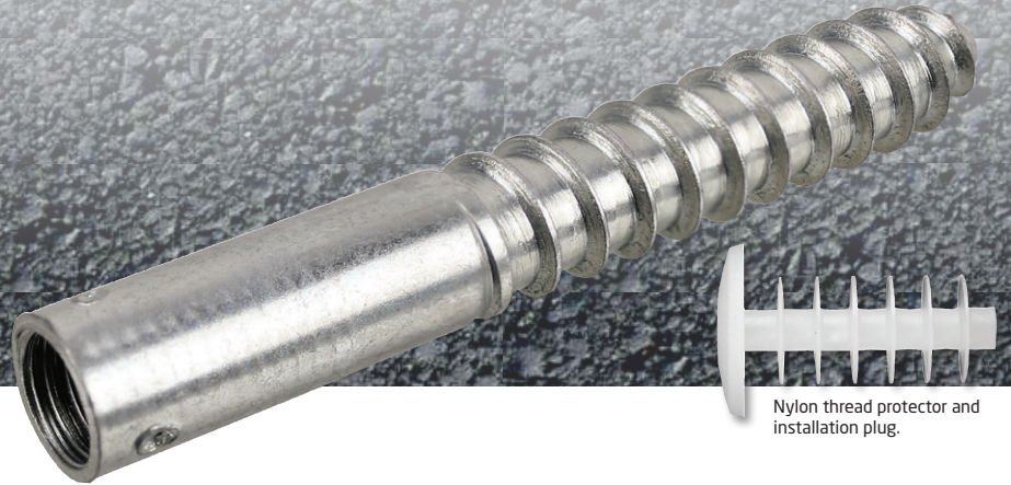
Nylon thread protector and installation plug.

ICCONS® Chembolt™ Asphalt Fixing is an intuitive system for creating a removable or permanent fixing. Primarily designed for tarmac and asphalts, Chembolt™ is also suitable for solid concrete substrates. Chembolt™ does not impart stress forces to its surroundings during installation therefore is totally durable as the integrity of the substrate is left intact.