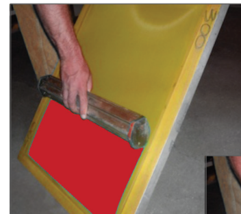
Step 1. Print Side

Note: Above times are based on using a screen coated 2/2.