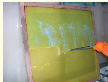
Step 3. High pressure rinse - starting at bottom.