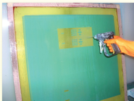
Step 1. After removal of ink, block-out, and tape, apply ER/35® to a wet screen(both sides).

ER/35® can be used in concentrated form, or it can be diluted up to 1 to 4 parts of water. ER/35® can be applied by a sponge, pad, spray bottle, or pneumatic pump systems.