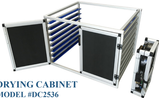
DRYING CABINET MODEL #DC2536