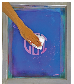
Step 3. Wipe away remaining residue with paper towel