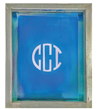
Step 4. End Result