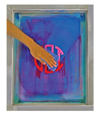
Step 2. Apply envirowipes to both side of screen