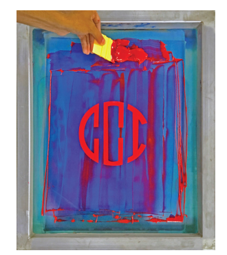
Step 1. Card excess ink from screen