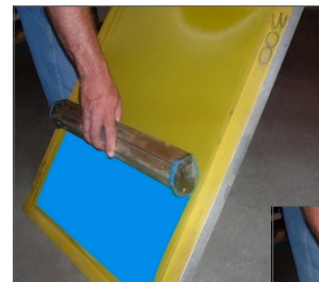
Step 1. Print Side

Note: Above times are based on using a 5KW Metal Halide Lamp.