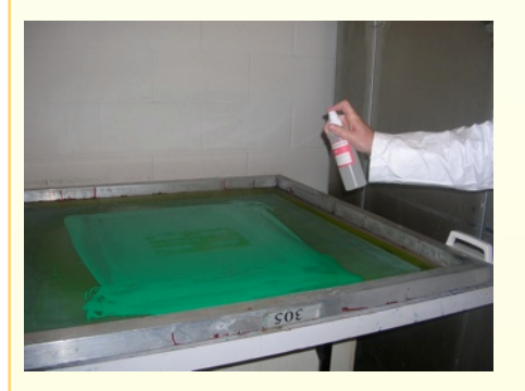
Step 1 . Spray VW INK WASH on squeegee side of screen.

VW INK WASH can be applied manually with a rag, spray bottle, or pneumatic pump systems.