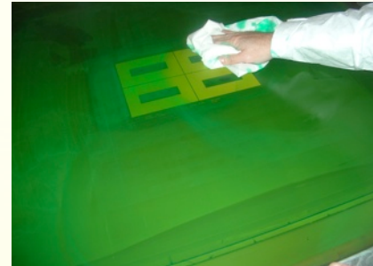
Step 3 . Use rags or towels to wipe up ink residue. Re-apply to clean up ink residue in image area.