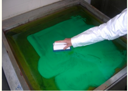
Step 2 . Scrub ink with a non-absorbent pad until liquified.