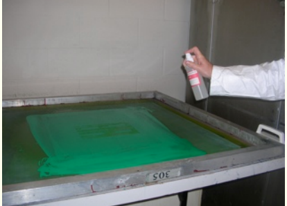
Step 1 . Spray Screen Wash #147 on the squeegee side of screen.

To cut down on the number or rags it takes to clean a screen, use a non absorbent scrub pad to liquify the ink and a squeegee to pull all the ink to one end of the screen and wipe up with one or two rags.