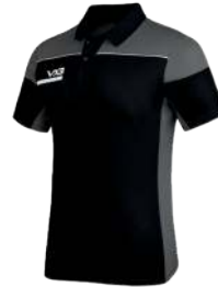
Black/Grey/White Adult: PUSP01

A traditional polo in an up to date design. The Opus Polo combines the classic polo shirt with high performance fabric. The soft handle 100% Polyester fabric offers supreme wicking properties and the breathable anti-cling Poly Pique knit ensures it keeps you cool. The subtle high-performance silicone detailing and branding combined with a contoured fit provides the ideal option for any occasion.