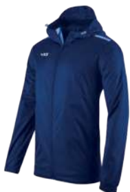
Navy/Sky Youth: 302448 Adult: 302447