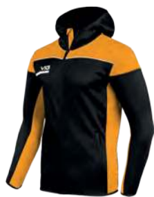
Black/Amber/White Youth: PUSZ13 Adult: PUSZ03