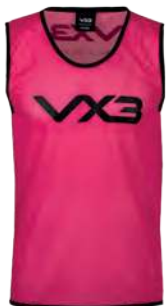
Training Bib Pink Code: TRAN04

Perfect for the training ground - The lightweight mesh design of our bibs ensure a comfortable fit, whilst the bright colours means that teams can easily be recognised whilst taking part in group sessions.