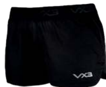
Clarus Ladies Running Short Black Ladies: CLAR03