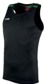
Black/Emerald Adult: 302416