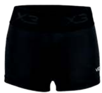
Shorties Black Youth: 48643 Adult: 91422