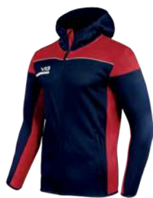
Navy/Red/White Youth: PUSZ20 Adult: PUSZ10