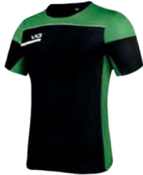
Black/Emerald/White Youth: PUST12 Adult: PUST02