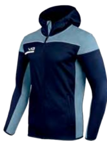
Navy/Sky/White Youth: PUSZ19 Adult: PUSZ09