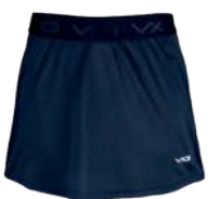
Skort Navy Youth: 48642 Adult: 91421