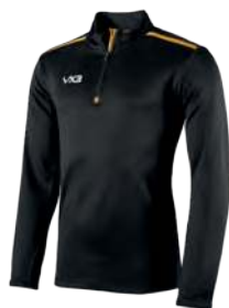
Black/Amber Youth: 302392 Adult: 302391