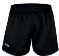
Core Rugby Shorts Black Youth: 91427 Adult: 91428