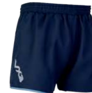
Navy/Sky Youth: 48645 Adult: 91424