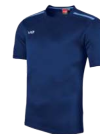
Navy/Sky Youth: 302458 Adult: 302457