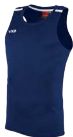
Navy/White Adult: 302474