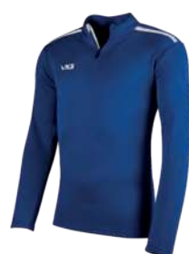
Navy/White Youth: 302465 Adult: 302464