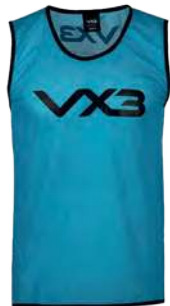
Training Bib Cyan Code: TRAN03