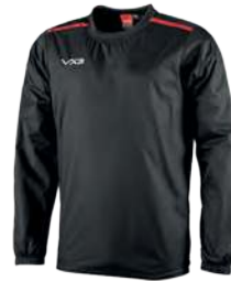
Black/Red Youth: 303499 Adult: 303490

Engineered for training in all weather conditions. The Fortis Smock has been produced with no zips or pockets to ensure safety when training for all sports including full contact activities. The soft handle rip-stop outer shell is tough and lightweight with a windproof, shower resistant finish to keep you warm and dry. The knitted ribbed collar, and warm mesh liner add extra comfort whilst the adjustable hem and elasticated cuff keeps the cold out and ensures the perfect fit. The subtle high-performance silicone detailing and branding combined with a contoured performance fit ensures the principal choice for training in all conditions.