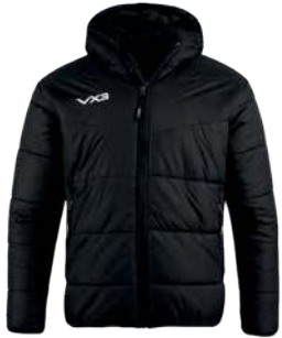
Mens Black Code: LRCA01

The Lorica quilted jacket is our cold weather jacket designed to protect against the elements; keeping you warm and dry. It's modern design stitching with insulating fibres allows it to trap heat close to the body to maintain a comfortable temperature in cold conditions.