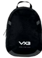
Bootbag Black Code: P1128

With several zipped compartments for organising your belongings our backpacks and kitbags are the perfect items to use to carry your kit or essentials. Made from 100% polyester material, VX3 element proof technology ensures the fabric is water resistant so you can keep the contents inside dry. The adjustable shoulder straps allow for carrying of heavier loads and come with padding to keep the wearer comfortable without overheating. Mesh pockets and sleeves allow for storing of various items.