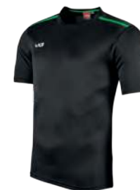
Black/Emerald Youth: 302415 Adult: 302414