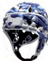
Navy/Sky/White Adult: AIRF001