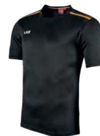
Black/Amber Youth: 302400 Adult: 302399