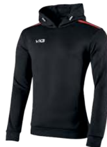
Black/Red Youth: 302420 Adult: 302419

An updated wardrobe staple. The Fortis Hoodie offers a modern take on the classic overhead layer. The super soft brushed back 100% Polyester fleece fabric offers warmth and comfort and ensures wicking. Features include a pouch pocket, adjustable hood with stretch drawcord and sports toggles for safety. The subtle high-performance silicone detailing and branding combined with a contoured performance fit offers a practical and versatile training favourite.