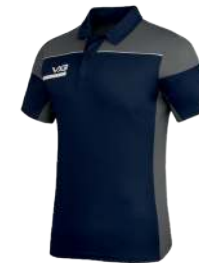
Navy/Grey/White Adult: PUSP08