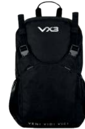
Elite Backpack Black Code: P1125