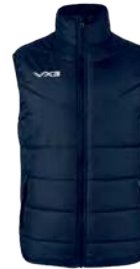
Navy Adult: VENT02