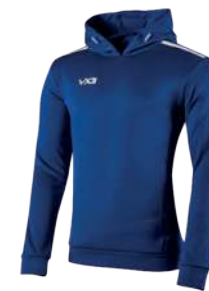
Navy/White Youth: 302463 Adult: 302462