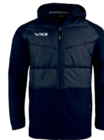
Navy Adult: TEMP02