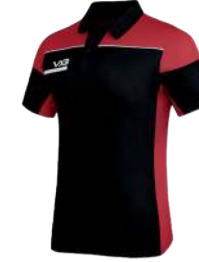
Black/Red/White Adult: PUSP04