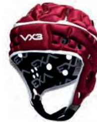
Maroon/White/Black Adult: AIRF005