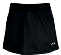
Skort Black Youth: 48644 Adult: 91423

Youth SY | MY | LY | XLY Adult XS | S | M | L | 2XL | 3XL | 4XL