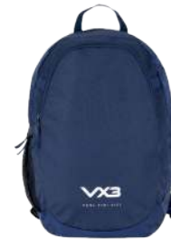
Backpack Navy Code: P1127