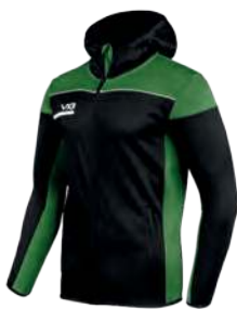
Black/Emerald/White Youth: PUSZ12 Adult: PUSZ02