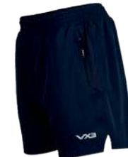
Majester Coaches Shorts Navy Adult: MAJE02