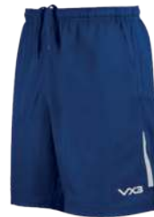
Navy/White Youth: 302471 Adult: 302470