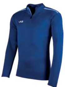
Navy/Sky Youth: 302452 Adult: 302451