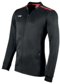
Black/Red Youth: 302426 Adult: 302425

An essential full zip design and modern track top alternative. The Fortis Presentation Jacket has been engineered in a super soft 100% Polyester durable brushed back fleece for ultimate insulation and offers a smart, clean, high quality finish. A neat self-fabric anti pill collar, cuff and open hem combined with the subtle high-performance silicone detailing and branding and contoured performance fit guarantees a professional look both on and off the field.