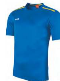
Royal/Yellow Youth: 302512 Adult: 302511