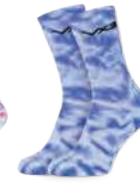
Tie Dye Parma Violet Code: P1303