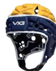
Navy/Yellow/White Adult: AIRF010