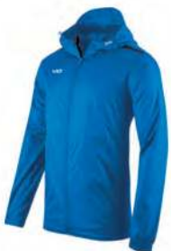
Royal/Navy Youth: 302489 Adult: 302488