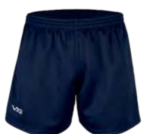
Core Rugby Shorts Navy Youth: 91429 Adult: 91430