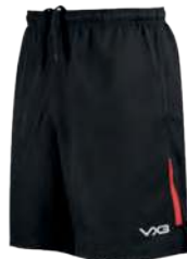
Black/Red Youth: 302428 Adult: 302427

Designed for comfort and unrestricted movement in a classic athletic design. The Fortis Short is available in a comprehensive range of club colours. The soft handle 100% Polyester fabric is incredibly quick drying and the breathable anti-cling woven fabric ensures it keeps you cool. The subtle high-performance silicone detailing and branding combined with a contoured fit ensures you look and feel your best for summer training and intense gym workouts.