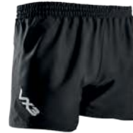
Black Youth: 48647 Adult: 91426

A modern match quality rugby short in a comprehensive range of club colours to compliment any playing kit. The Prima rugby short is produced in a high performance Poly Drill fabric that is durable enough for rigorous training sessions and robust enough to tackle the toughest game. The ergonomic fit, stretch elastane gusset and soft handle moisture wicking fabric ensures there is no compromise on comfort. Whilst the contrast panels, clean lines and high profile VX3 branding complete the professional aesthetic.