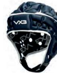
Navy/White/Black Adult: AIRF007