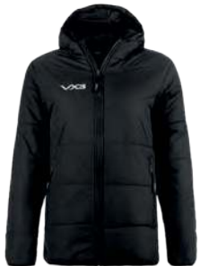
Youth Black Code: LRCA02