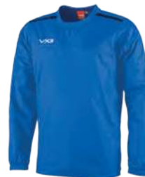
Royal/Navy Youth: 303504 Adult: 303495