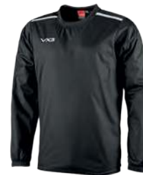
Black/White Youth: 303500 Adult: 303491