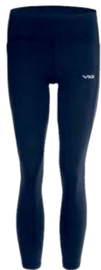
Motus Ladies Leggings Navy Code: MTUS30