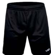
Adult Football Shorts Black Adult: 367714