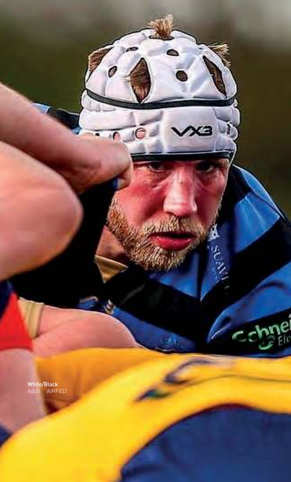
White/Black Adult: AIRF033