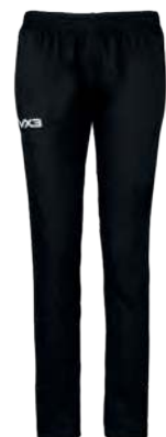
Solum Ladies Trackpants Black Code: SLUM01