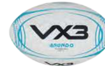
Arundo Ball Size 5 Code: ARUN03