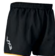
Black/Amber Youth: 48642 Adult: 91421