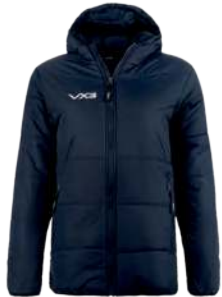
Youth Navy Code: LRCA06