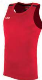
Red/Black Adult: 302487