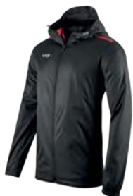
Black/Red Youth: 302418 Adult: 302417

A lightweight full zip jacket with durable rip-stop shell. The Fortis Rain Jacket ensures windproof and water resistant properties whilst remaining lightweight and breathable. The features include zipped secured pockets, a warm mesh lining which keeps you insulated and a dedicated fully functional hood for further protection. The subtle high-performance silicone detailing and branding combined with a contoured performance fit creates the perfect outer layer.