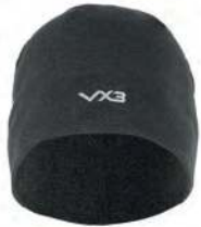
Tech Beanie Grey Code: TRUC01