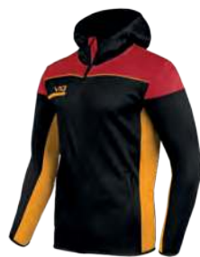
Black/Red/Amber Youth: PUSZ15 Adult: PUSZ05