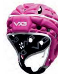
Pink/White/Black Adult: 66346