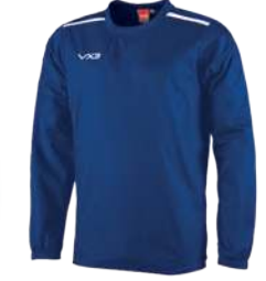
Navy/White Youth: 303502 Adult: 303493