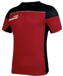
Red/Black/White Youth: PUST16 Adult: PUST06