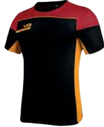
Black/Red/Amber Youth: PUST15 Adult: PUST05