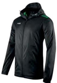
Black/Emerald Youth: 302403 Adult: 302402