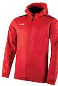
Red/Black Youth: 302476 Adult: 302475