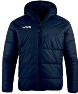
Mens Navy Code: LRCA04