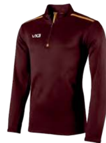
Maroon/Amber Adult: FRTS18