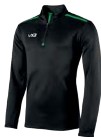
Black/Emerald Youth: 302407 Adult: 302406