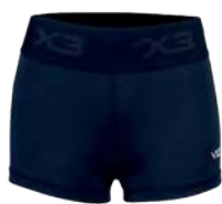
Shorties Navy Youth: 48645 Adult: 91424