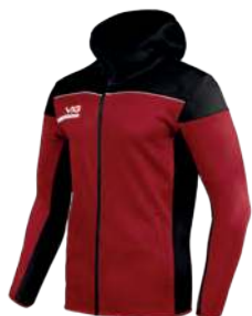
Red/Black/White Youth: PUSZ16 Adult: PUSZ06