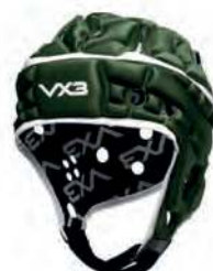
Bottle Green/White Adult: AIRF009