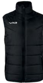
Black Adult: VENT01

The Ventus Gilet is our Spring/Autumn jacket designed to keep your core insulated when temperatures are slightly warmer. Using the same fabrics and fibres as our Lorica jacket, the Ventus gilet is the perfect product to layer alongside our long sleeve tee or hoody to maintain the perfect temperature. With an improved fit to our last seasons gilet design, this jacket has a more modern appearance with narrower shoulders for a sleek fit.