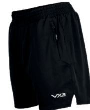
Majester Coaches Shorts Black Adult: MAJE02