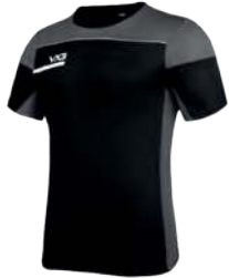
Black/Grey/White Youth: PUST11 Adult: PUST01

Produced in an updated drop shoulder design with contemporary styling. The Opus Tee offers clean lines with advanced details in multiple club colourways. The soft handle 100% Polyester fabric wicks moisture away from the skin whilst the breathable anti-cling Micro Dot knit ensures it keeps you cool. The subtle high-performance silicone detailing and branding combined with a contoured fit delivers optimum performance and comfort.