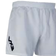
White Youth: 92520 Adult: 92519