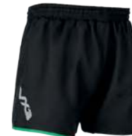
Black/Emerald Youth: 48643 Adult: 91422