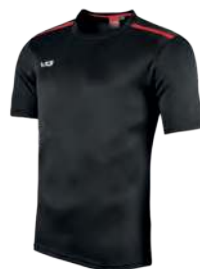
Black/Red Youth: 302430 Adult: 302429

Produced in an updated drop shoulder design with contemporary styling. The Fortis Tee offers clean lines with advanced details in multiple club colourways. The soft handle 100% Polyester fabric wicks moisture away from the skin whilst the breathable anti-cling Micro Dot knit ensures it keeps you cool. The subtle high-performance silicone detailing and branding combined with a contoured fit delivers optimum performance and comfort.