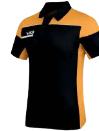
Black/Amber/White Adult: PUSP03