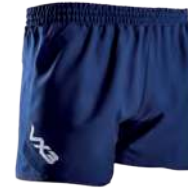
Navy Youth: 48646 Adult: 91425