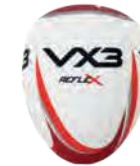
Reflex Rebounder Ball Code: REFL01-ONES