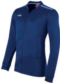
Navy/Sky Youth: 302456 Adult: 302455