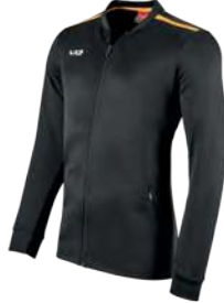
Black/Amber Youth: 302396 Adult: 302395