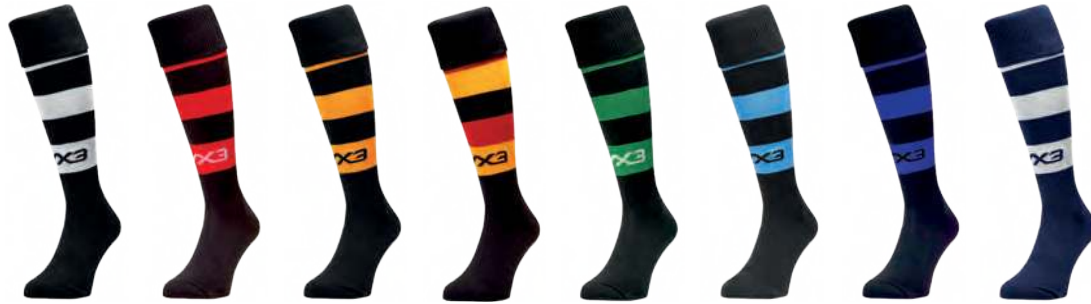
Black/White Youth: 92276 Adult: 92277 Black/Red Youth: 92278 Adult: 92279 Black/Amber Youth: 92280 Adult: 92281 Black/Red/Amber Youth: 92282 Adult: 92283 Black/Emerald Youth: 92284 Adult: 92285 Black/Sky Youth: 92286 Adult: 92287 Black/Royal Youth: 92300 Adult: 92301 Navy/White Youth: 92288 Adult: 92289

Be game ready and complete your kit with these Hooped Playing Socks. Coming in an array of colours, these socks not only look good but feel good with elastic sections around the arch of the foot and top of the ankle.