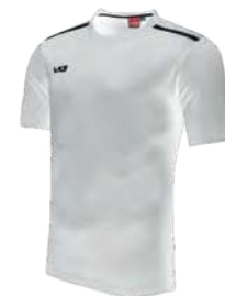
White/Black Youth: 302517 Adult: 302516