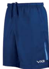
Navy/Sky Youth: 383595 Adult: 383594