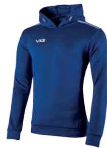
Navy/Sky Youth: 302450 Adult: 302449