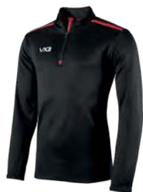
Black/Red Youth: 302422 Adult: 302421

The essential mid-layer garment for athletes from all sporting codes. The Fortis Half Zip Sweat has been developed for training and travel wear. Crafted in a super soft 100% Polyester durable brushed back fleece guaranteed to keep you insulated. The zipped neck design with chin guard, elasticated cuff and open hem design offers unrivalled comfort. The subtle high-performance silicone detailing and branding combined with a contoured performance fit ensures a fundamental addition to your training and off-field wear.