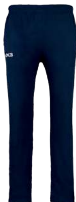
Braca Trackpants Navy Youth: BRAC25 Adult: BRAC23