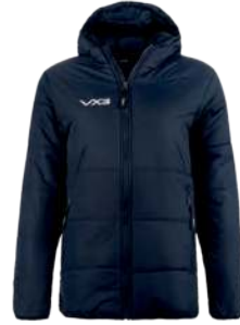
Ladies Navy Code: LRCA05