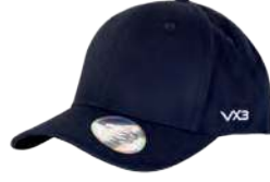
Classic Navy Code: CLAS03