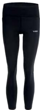
Motus Ladies Leggings Black Code: MTUS29