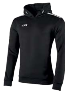
Black/White Youth: 302435 Adult: 302434