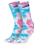
Tie Dye Unicorn Code: P1304