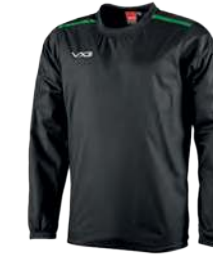
Black/Emerald Youth: 303498 Adult: 303489