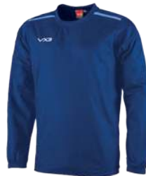
Navy/Sky Youth: 303501 Adult: 303492