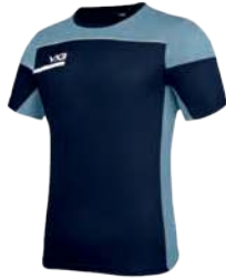
Navy/Sky/White Youth: PUST18 Adult: PUST08