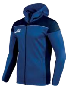
Royal/Navy/White Youth: PUSZ17 Adult: PUSZ07