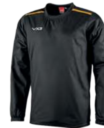
Black/Amber Youth: 303497 Adult: 303488