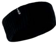
Knitted Headband Black Code: TRUC02