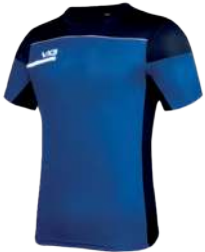
Royal/Navy/White Youth: PUST17 Adult: PUST07