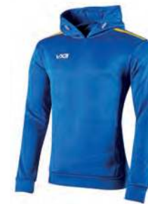
Royal/Yellow Youth: 302504 Adult: 302503