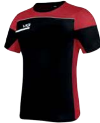
Black/Red/White Youth: PUST14 Adult: PUST04