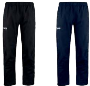
Black Adult: PRTE03

The VX3 Protego Trouser is has waterproof fabric with sealed seams to keep you dry in even the worse conditions. These trousers are lightweight and pack down easily to fit into your kit bag making it convenient to always keep with you. The thigh length side zips make putting them on quick and easy. This product goes perfectly with our Protego Jacket so you can stay dry from head to toe.