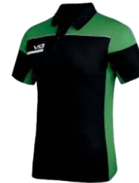
Black/Emerald/White Adult: PUSP02