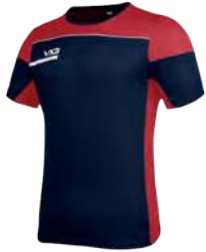
Navy/Red/White Youth: PUST20 Adult: PUST10