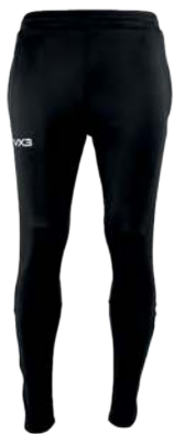
Skinny Pants Black Youth: 92597 Adult: 95746