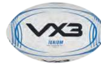
Ignium Ball Size 5 Code: GNUM01