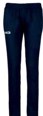
Solum Ladies Trackpants Navy Code: SLUM02