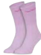
Candy Pink Code: P1300