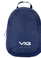
Bootbag Navy Code: P1129