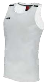
White/Black Adult: 302518