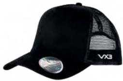
Trucker Black Code: TRUC01