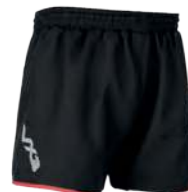
Black/Red Youth: 48644 Adult: 91423