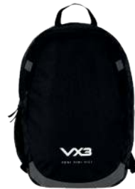
Backpack Black Code: P1126