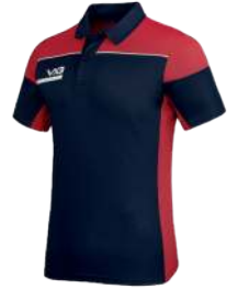
Navy/Red/White Adult: PUSP10