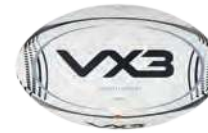
Ballisto Ball Size 5 Code: BALL01