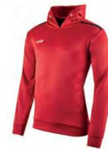
Red/Black Youth: 302478 Adult: 302477