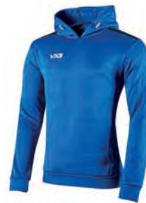
Royal/Navy Youth: 302491 Adult: 302490