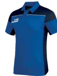
Royal/Navy/White Adult: PUSP07