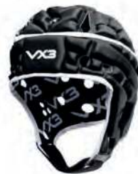
Black/White Youth: AIRF012 Adult: AIRF002