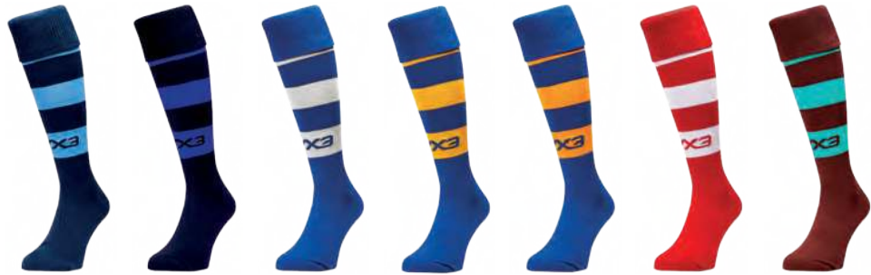
Navy/Sky Youth: 92290 Adult: 92291 Navy/Royal Youth: 92304 Adult: 92305 Royal/White Youth: 92292 Adult: 92293 Royal/Yellow Youth: 92294 Adult: 92295 Royal/Amber Youth: 92302 Adult: 92303 Red/White Youth: 92296 Adult: 92297 Burgundy/Sky Youth: 92298 Adult: 92299