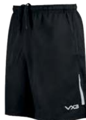
Black/White Youth: 302443 Adult: 302442