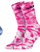
Tie Dye Raspberry Ripple Code: P1302