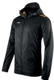
Black/Amber Youth: 302388 Adult: 302387