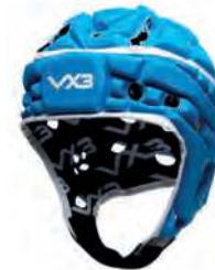
Sky/White/Black Youth: AIRF014 Adult: AIRF006