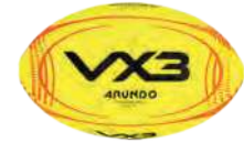
Arundo Ball Sizes 3, 4 & 5 Code: ARUN04