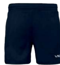
Ludus Gym Shorts Navy Youth: LUDU02 Adult: LUDU04