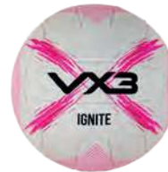
Ignite Netball Size 4 & 5 Code: GNTE01