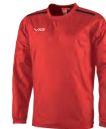
Red/Black Youth: 303503 Adult: 303494