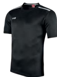
Black/White Youth: 302445 Adult: 302444