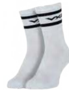
Logo Crew White Code: P1070