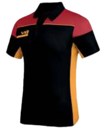
Black/Red/Amber Adult: PUSP05