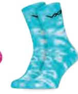
Tie Dye Tropical Teal Code: P1301