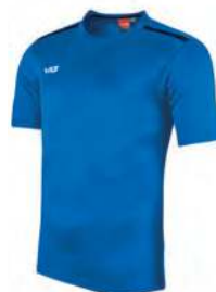
Royal/Navy Youth: 302499 Adult: 302498