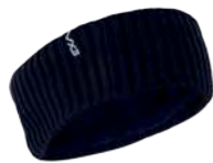
Knitted Headband Navy Code: CLAS02