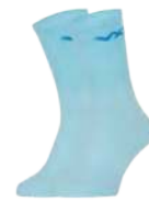
Powder Blue Code: P1299