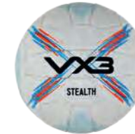
Stealth Netball Size 5 Code: STEA01