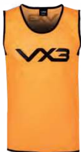
Training Bib Yellow Code: TRAN01