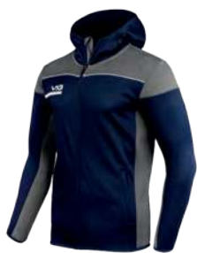
Navy/Grey/White Youth: PUSZ18 Adult: PUSZ08