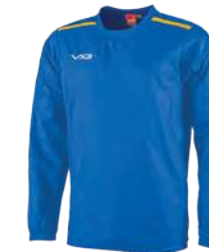
Royal/Yellow Youth: 303505 Adult: 303496