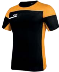
Black/Amber/White Youth: PUST13 Adult: PUST03