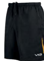
Black/Amber Youth: 302398 Adult: 302397