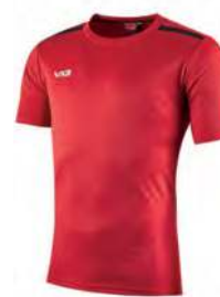
Red/Black Youth: 302486 Adult: 302485