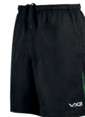
Black/Emerald Youth: 302413 Adult: 302412