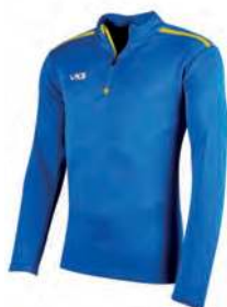
Royal/Yellow Youth: 302506 Adult: 302505