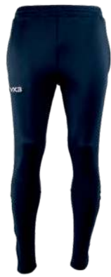
Skinny Pants Navy Youth: 61362 Adult: 95747