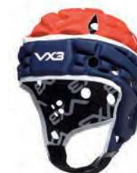
Navy/Orange/White Adult: AIRF011