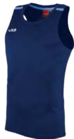
Navy/Sky Adult: 302459