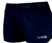
Clarus Ladies Running Short Navy Ladies: CLAR04