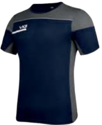
Navy/Grey/White Youth: PUST19 Adult: PUST09