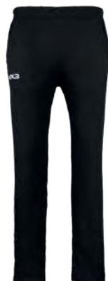
Braca Trackpants Black Youth: BRAC24 Adult: BRAC04