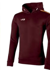
Maroon/Amber Youth: FRTS16 Adult: FRTS17