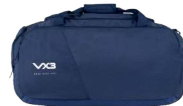
Kit Bag Navy Code: P1131