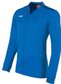
Royal/Navy Youth: 302497 Adult: 302496