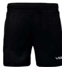
Ludus Gym Shorts Black Youth: LUDU01 Adult: LUDU03