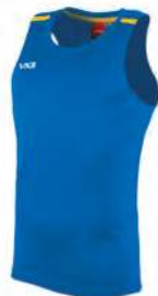
Royal/Yellow Adult: 302513