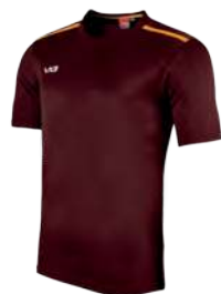
Maroon/Amber Youth: FRTS15 Adult: FRTS14