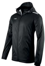
Black/White Youth: 302433 Adult: 302432