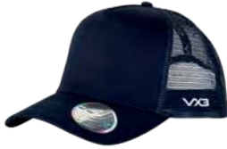
Trucker Navy Code: TRUC02