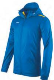
Royal/Yellow Youth: 302502 Adult: 302501