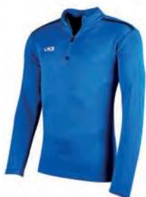
Royal/Navy Youth: 302493 Adult: 302492