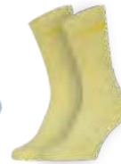
Sunshine Yellow Code: P1298