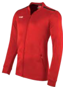
Red/Black Youth: 302484 Adult: 302483