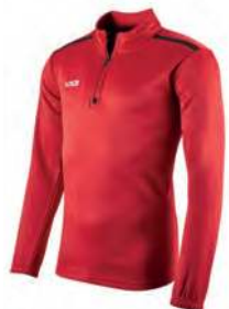
Red/Black Youth: 302480 Adult: 302479