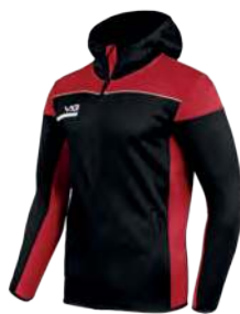
Black/Red/White Youth: PUSZ14 Adult: PUSZ04