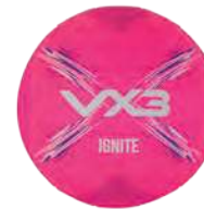
Ignite Netball Size 4 & 5 Code: GNTE02