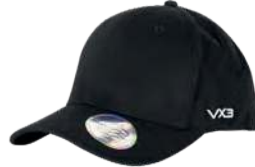
Classic Black Code: CLAS02