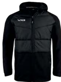
Black Adult: TEMP01

The Tempest hybrid jacket is our variable weather jacket designed to protect against the elements; keeping you warm and dry. It features quilted chest and back panels to retain heat combined with soft shell sleeves and hood. This makes it breathable and shower proof allowing you to regulate body temperature. The perfect jacket for use during warm ups and light sustained activity.