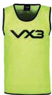
Training Bib Orange Code: TRAN02