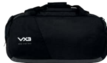
Kit Bag Black Code: P1130