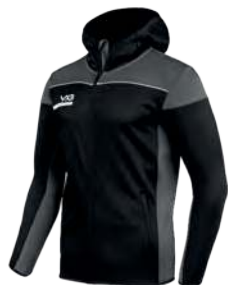
Black/Grey/White Youth: PUSZ11 Adult: PUSZ01

An updated wardrobe staple. The Opus Zoodie offers a modern take on the classic overhead layer. The super soft brushed back 100% Polyester fleece fabric offers warmth and comfort and ensures wicking. Features include a pouch pocket, adjustable hood with stretch drawcord and sports toggles for safety. The subtle high-performance silicone detailing and branding combined with a contoured performance fit offers a practical and versatile training favourite.