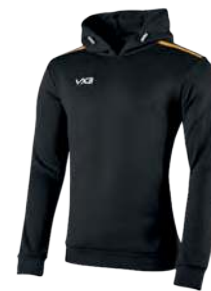
Black/Amber Youth: 302390 Adult: 302389