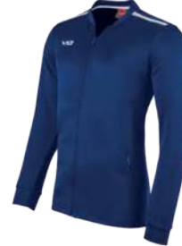
Navy/White Youth: 302469 Adult: 302468