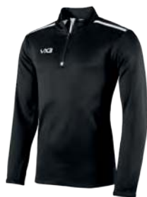
Black/White Youth: 302437 Adult: 302436