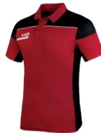
Red/Black/White Adult: PUSP06