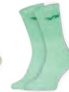
Apple Green Code: P1297