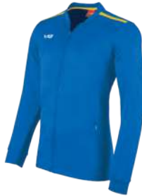
Royal/Yellow Youth: 302510 Adult: 302509