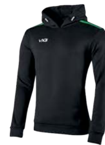
Black/Emerald Youth: 302405 Adult: 302404