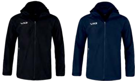
Black Adult: PRTE01

The Protego waterproof jacket is our "Stay dry at all costs" jacket. Its fully waterproof fabric, sealed seams and adjustable wrist straps ensures the rain stays out. This jacket is lightweight and packs down easily to fit into your kit bag making it convenient to keep with you at all times.