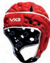
Red/White/Black Youth: AIRF013 Adult: AIRF004

This World Rugby approved Airflow headguard offers improved peripheral vision and maximum protection and it provides maximum temple and occipital protection. The soft closed cell foams maintain shape after high impact whilst also providing comfort.