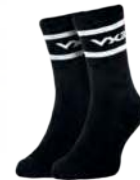
Logo Crew Black Code: P1071