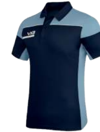
Navy/Sky/White Adult: PUSP09