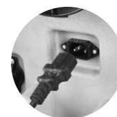
Quick power cord connection