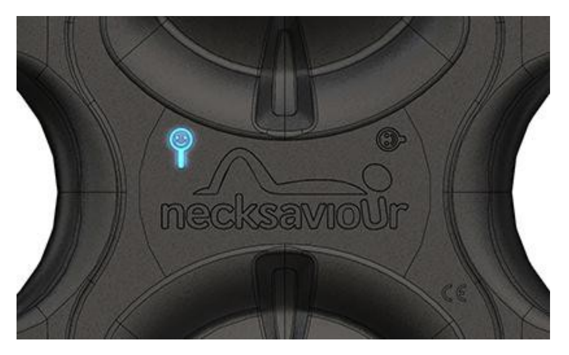
Short neck option - use necksaviour with the short neck symbol facing up.

<u>Long neck option</u> - use necksaviour with the long neck symbol facing up.